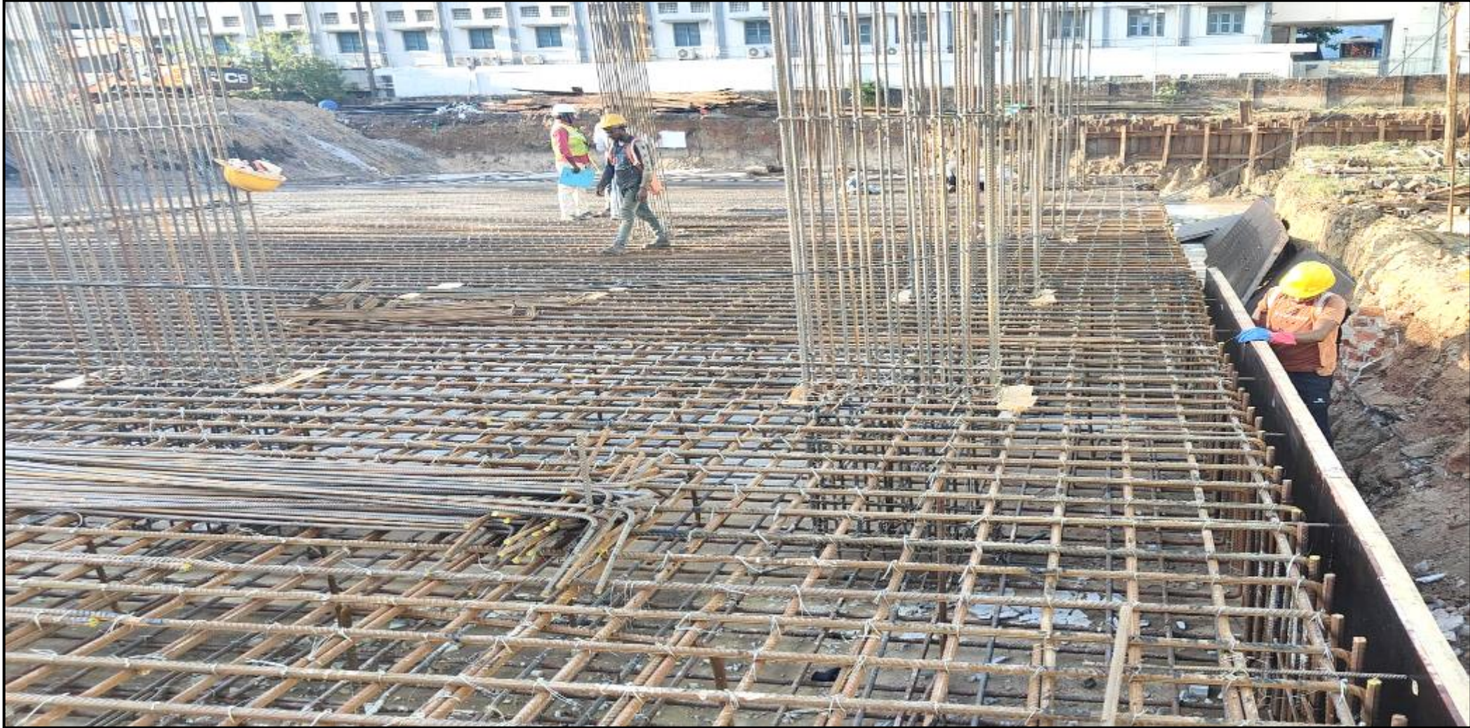
Main building – Pour 2 raft shuttering work completed