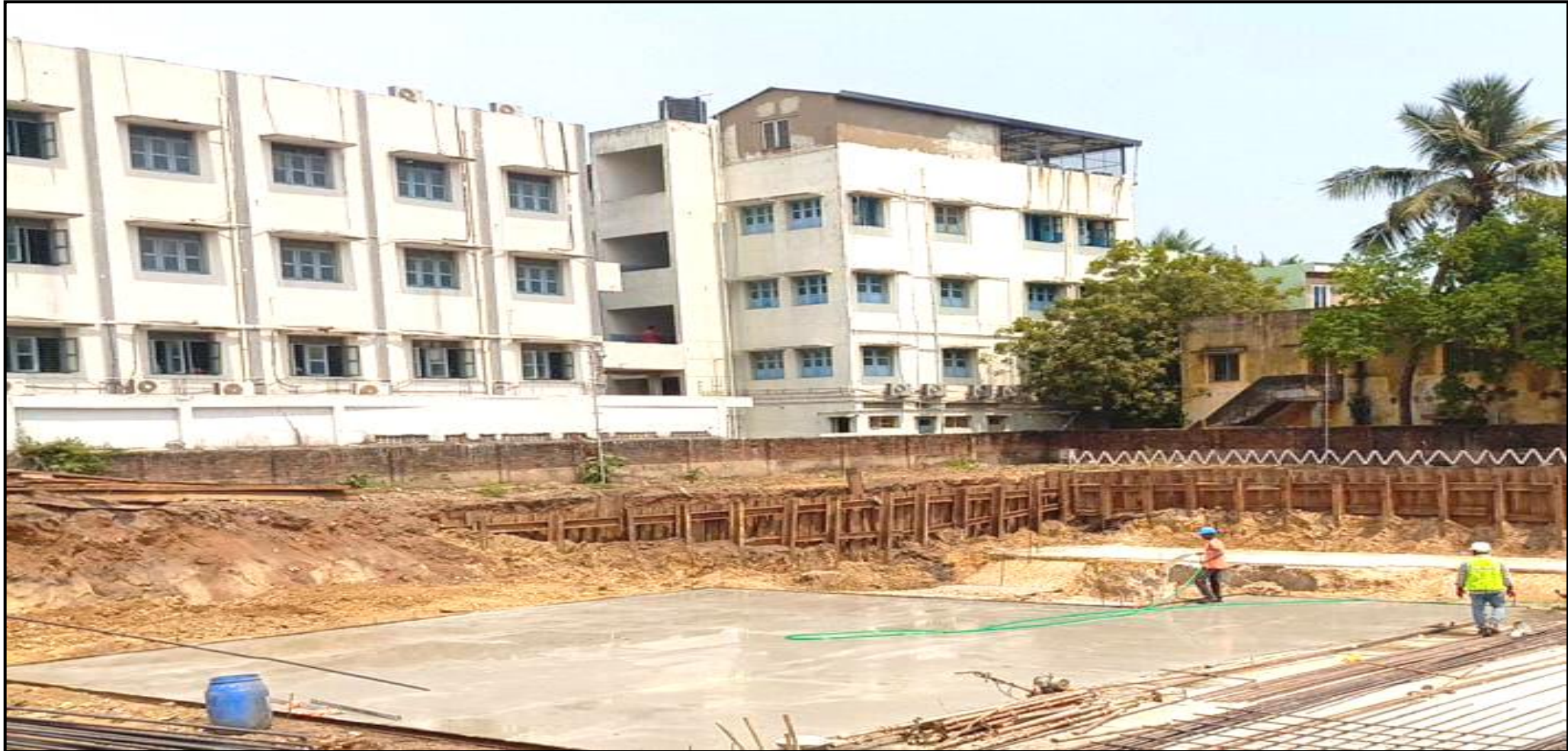
Main building – Pour 3 Raft PCC work completed