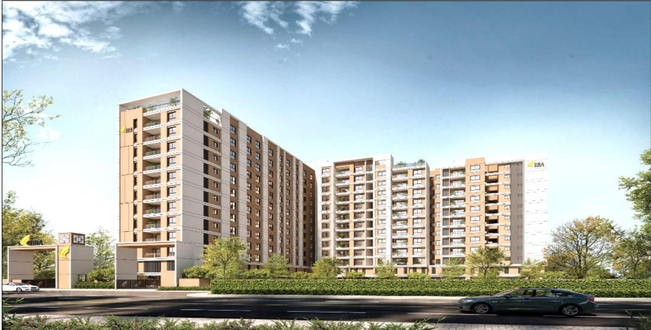
DRA ASTRA Construction update photos – March 2025