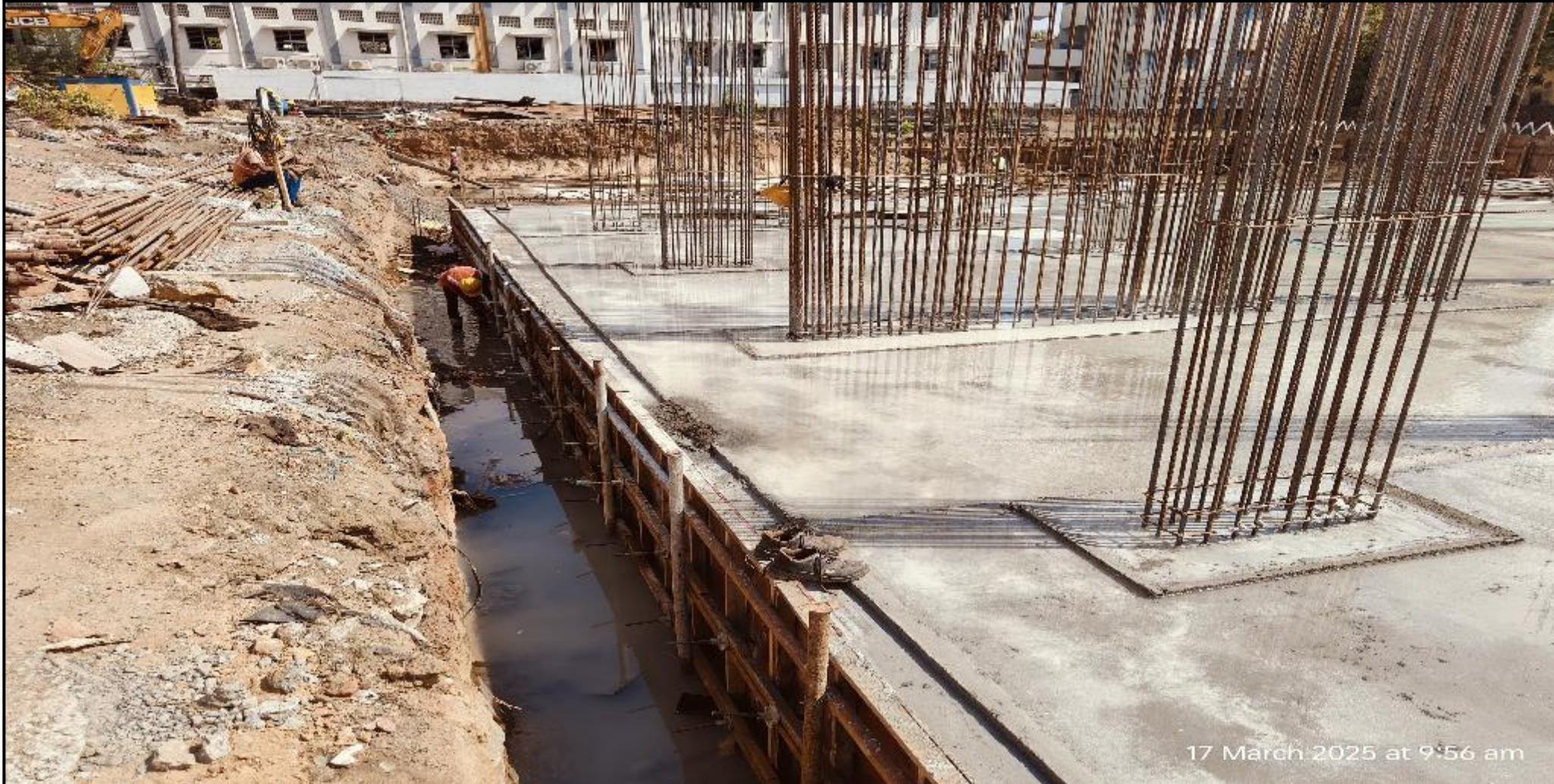
Main building – Pour 2 Raft de-shuttering work completed