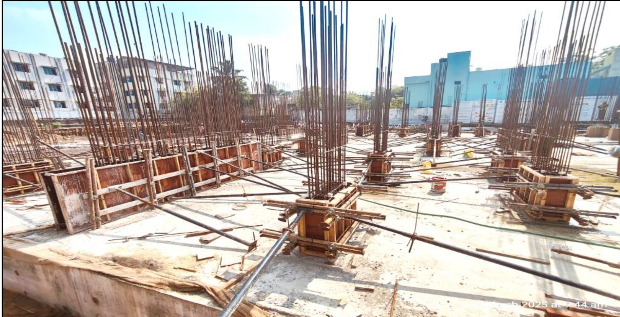
Main building – Pour 2 column shuttering work completed (28/28 no's)