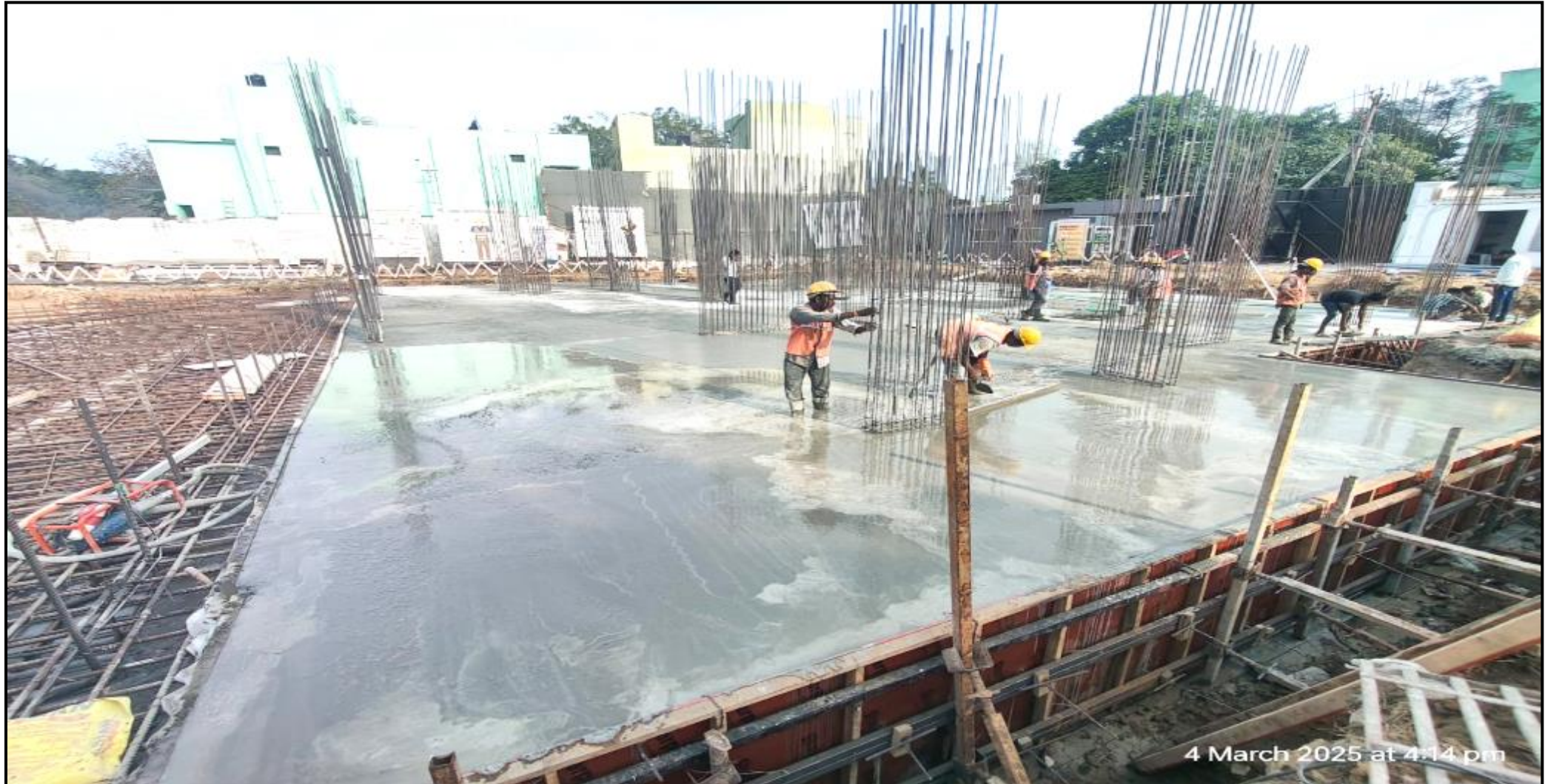
Main building – Pour 1 Raft concrete work completed (509cum)