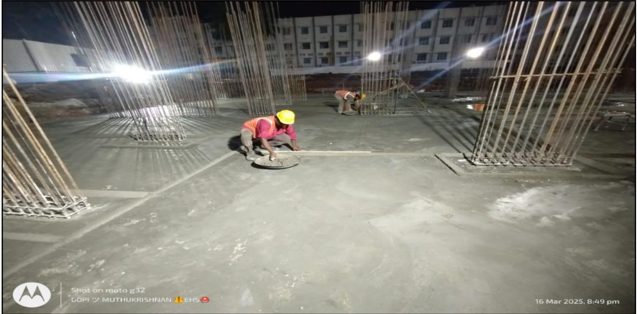
Main building – Pour 2 raft curing bund construction work completed