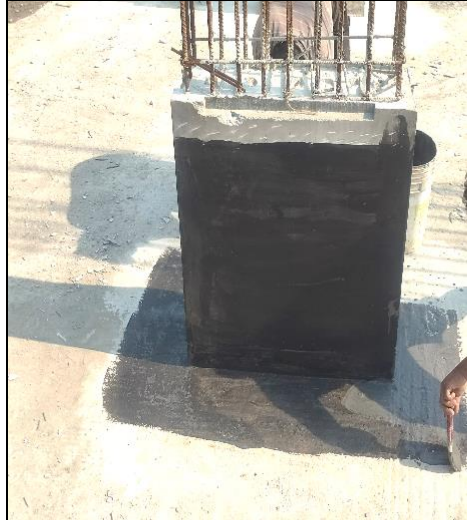
Main building – Pour 1 & 2 DPC primer Applied on column