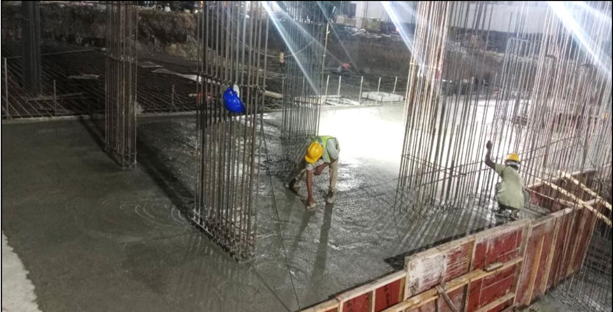
UG Sump & main building pour 3 raft concrete floating work completed