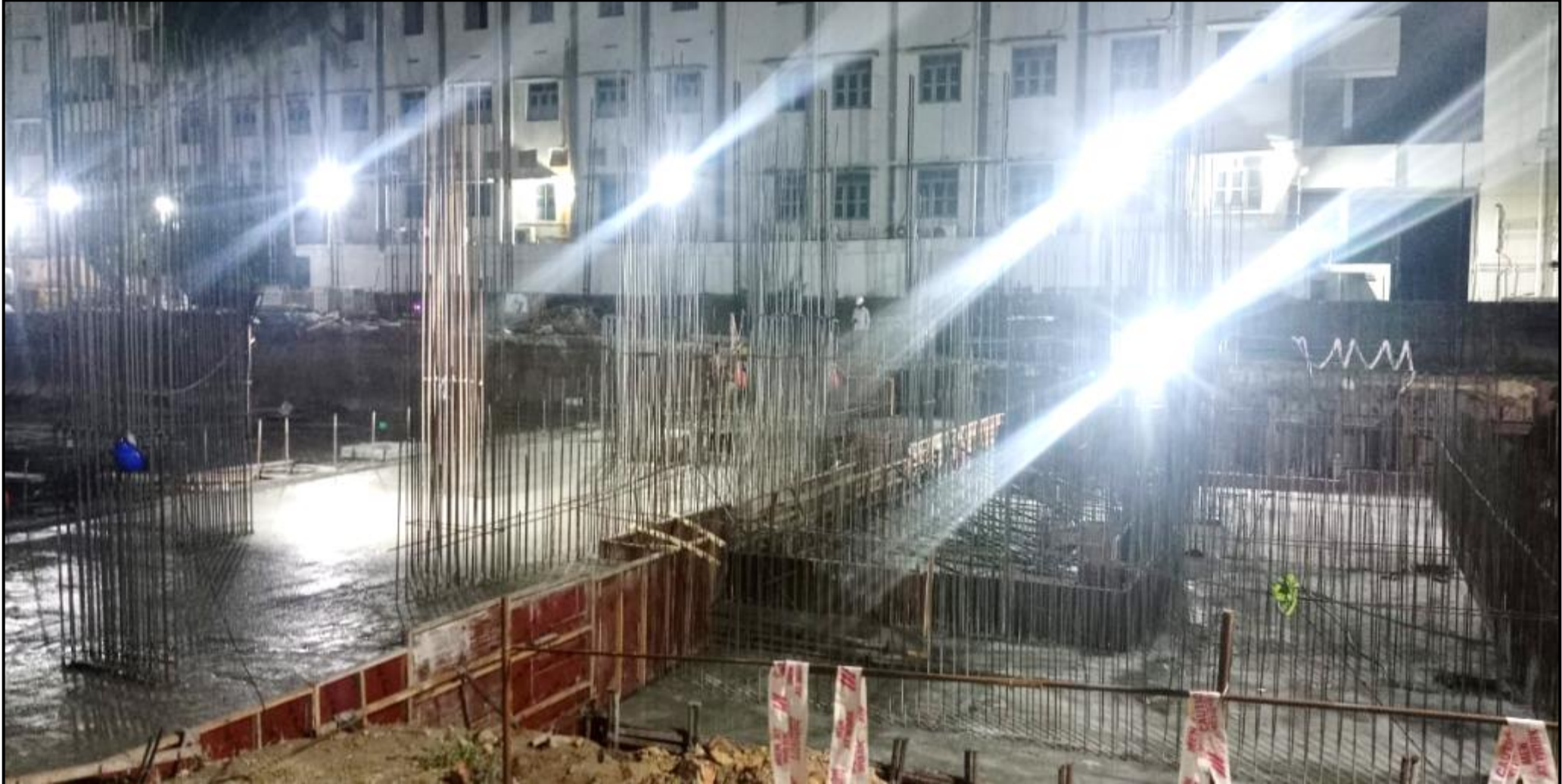
UG Sump & main building pour 3 raft concrete work completed (515.5 cum)