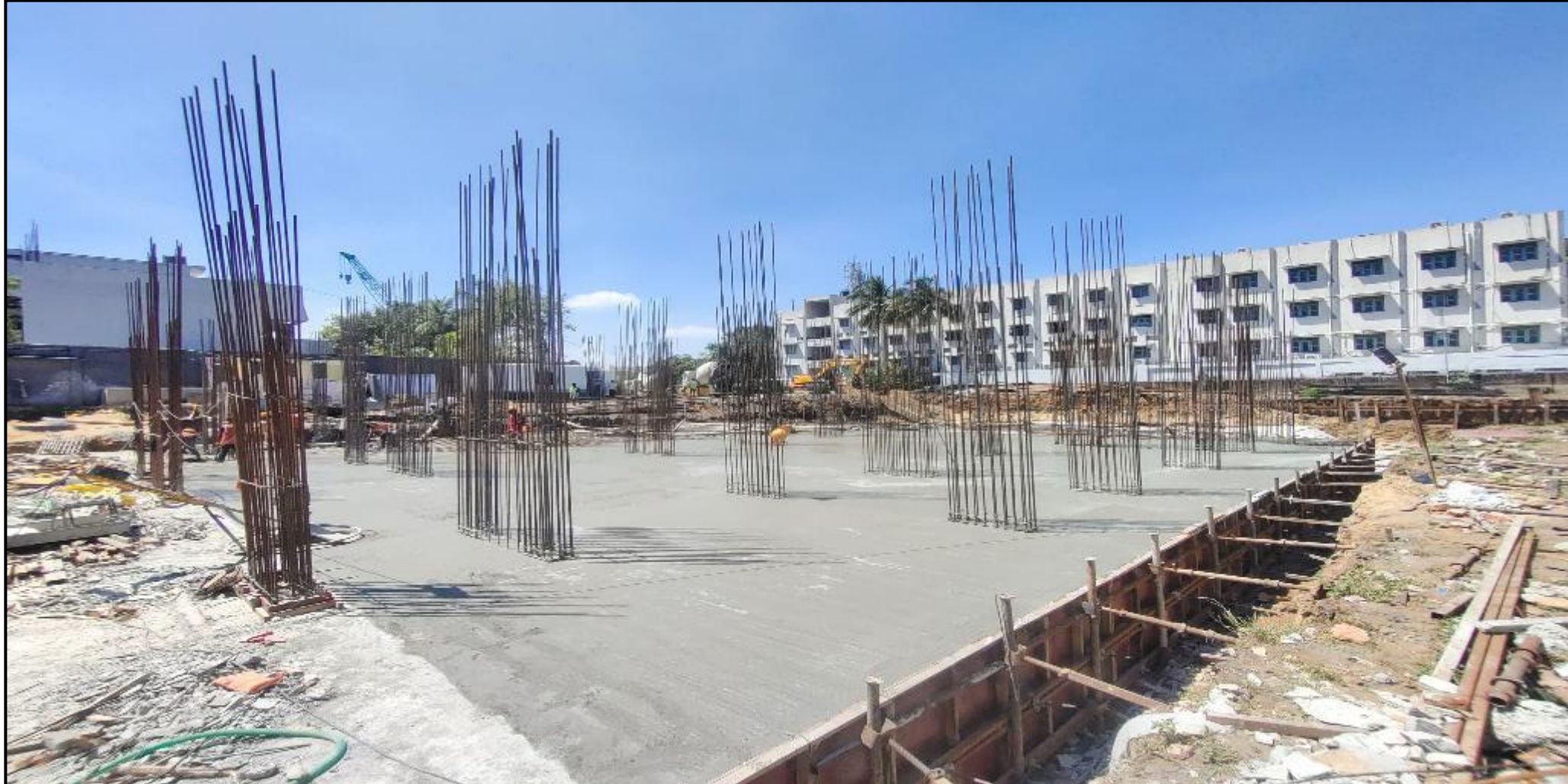
Main building – Pour 2 raft concrete 550 cum completed