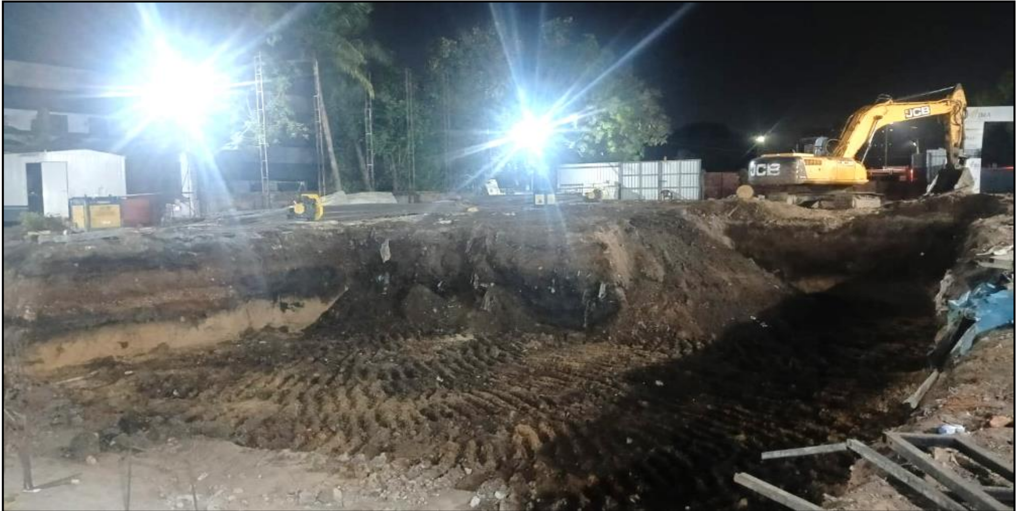
Main building – Pour 4 raft excavation work in progress