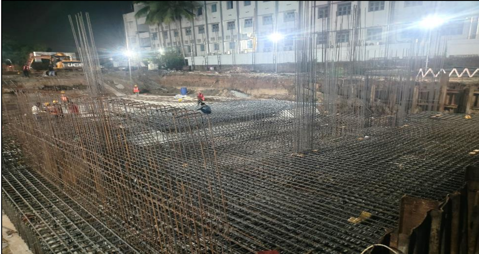
UG sump & Main building pour 3 raft reinforcement work completed