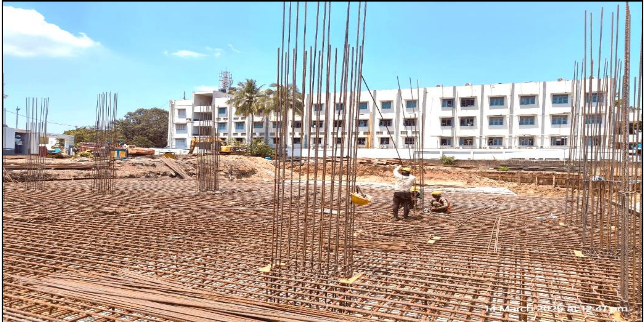
Main building – Pour 2 raft reinforcement work completed