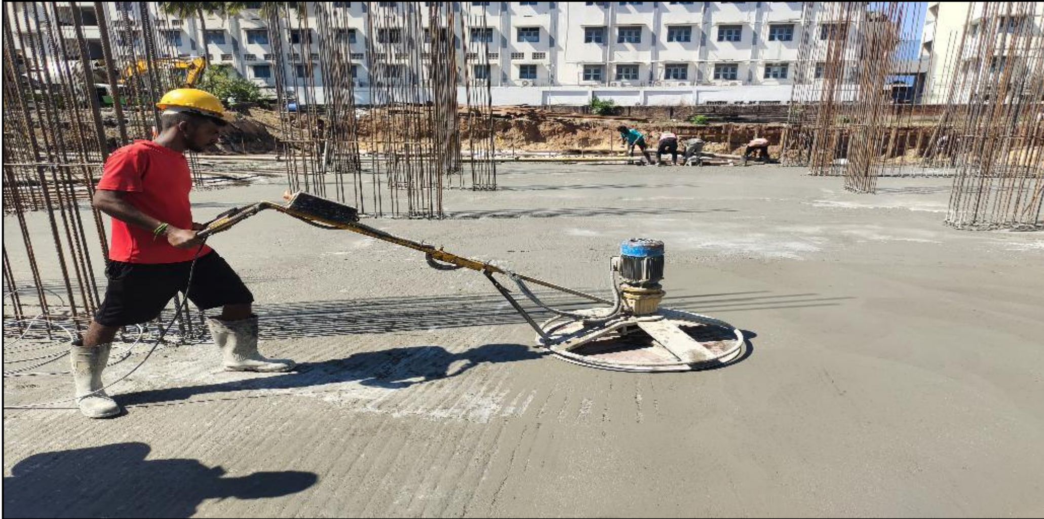
Main building – Pour 2 raft concrete power trowel finishing work completed