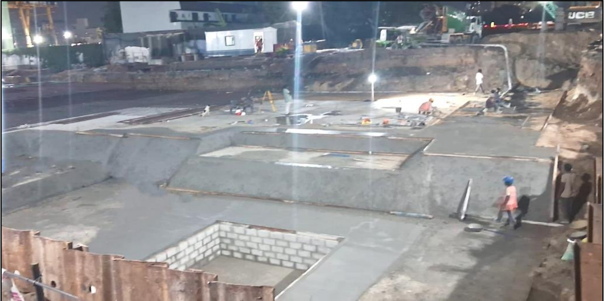
Main building & UG Sump – Raft PCC work completed