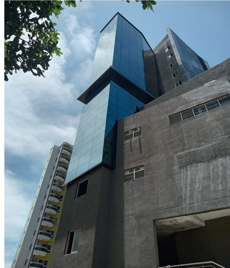
Site Front View