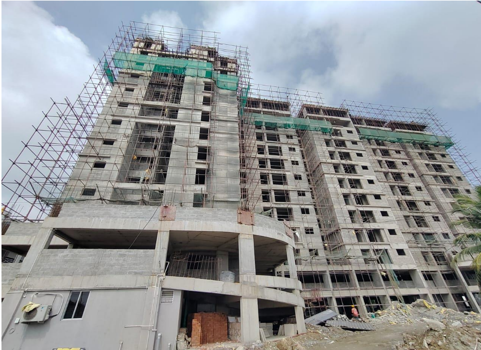
South Side Elevation