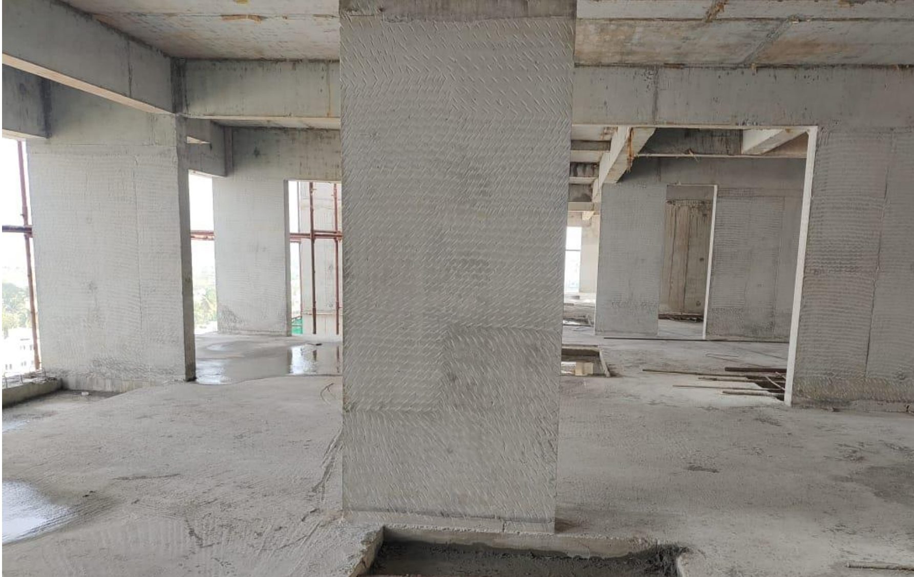
Tenth Floor Hacking Work on Progress