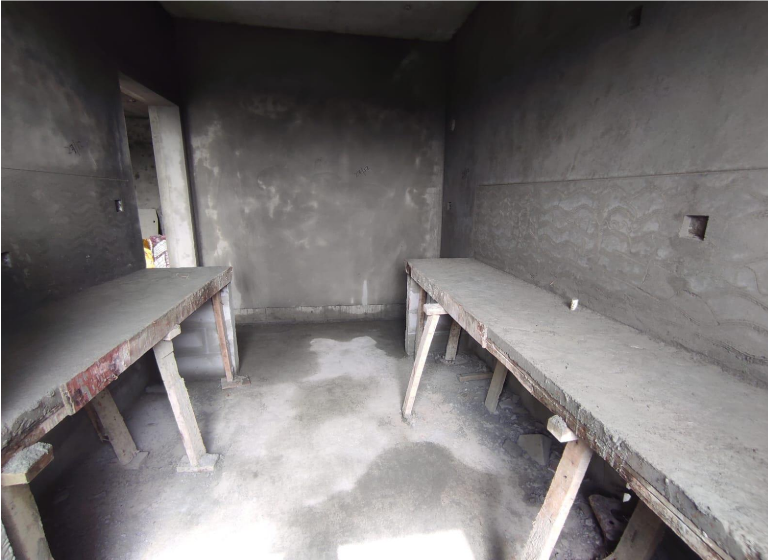
Sixth Floor Kitchen Counter Slab Concrete completed