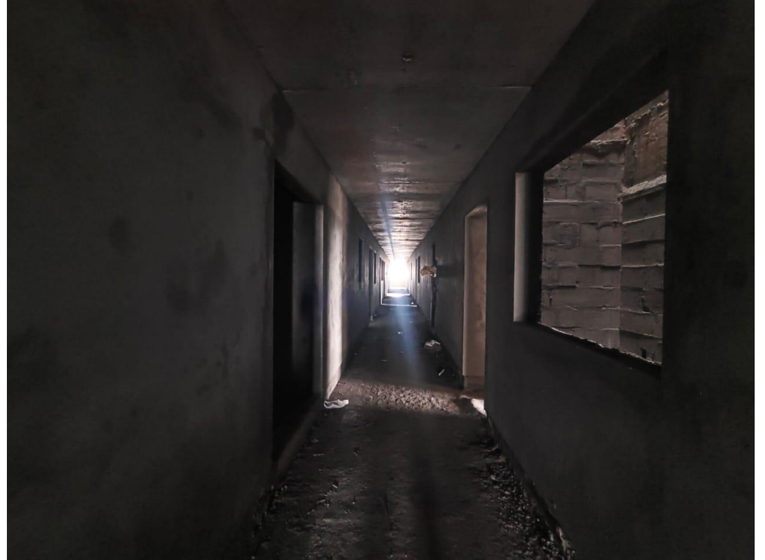
Sixth Floor Plastering Work on Progress