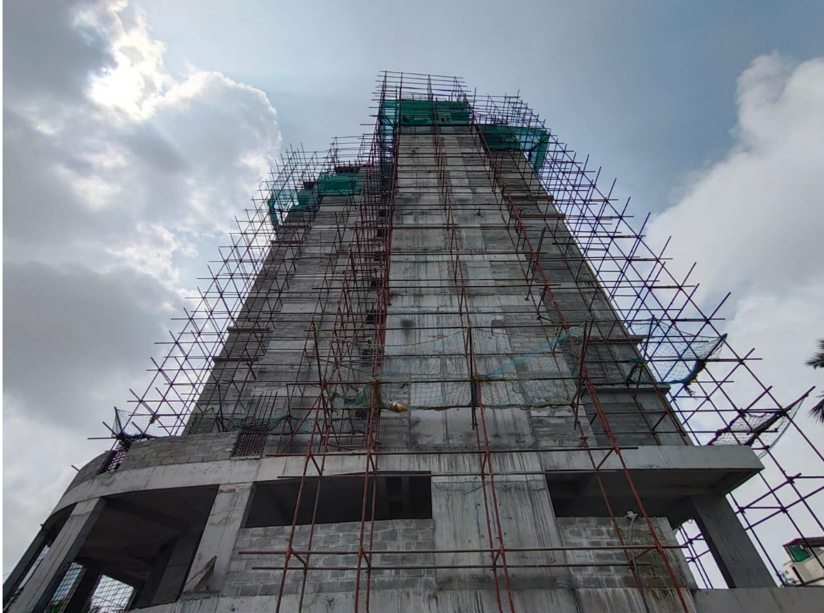
East Side Elevation