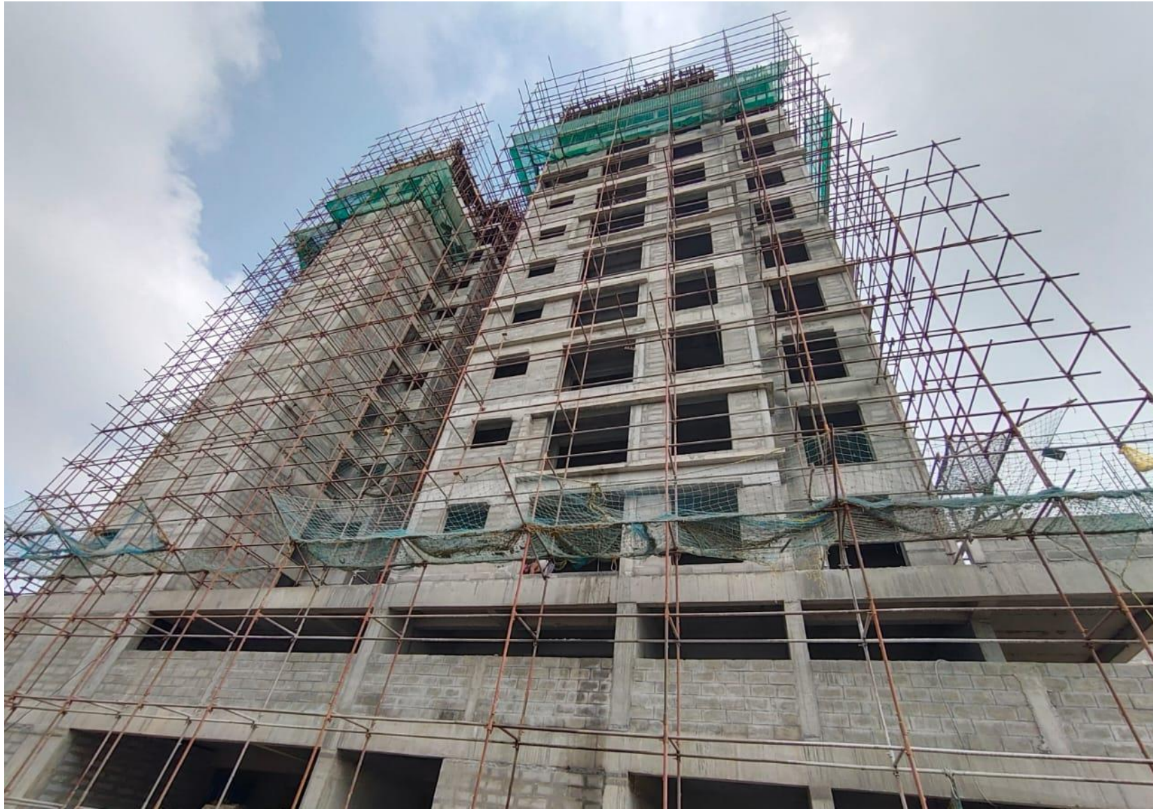
West side Elevation