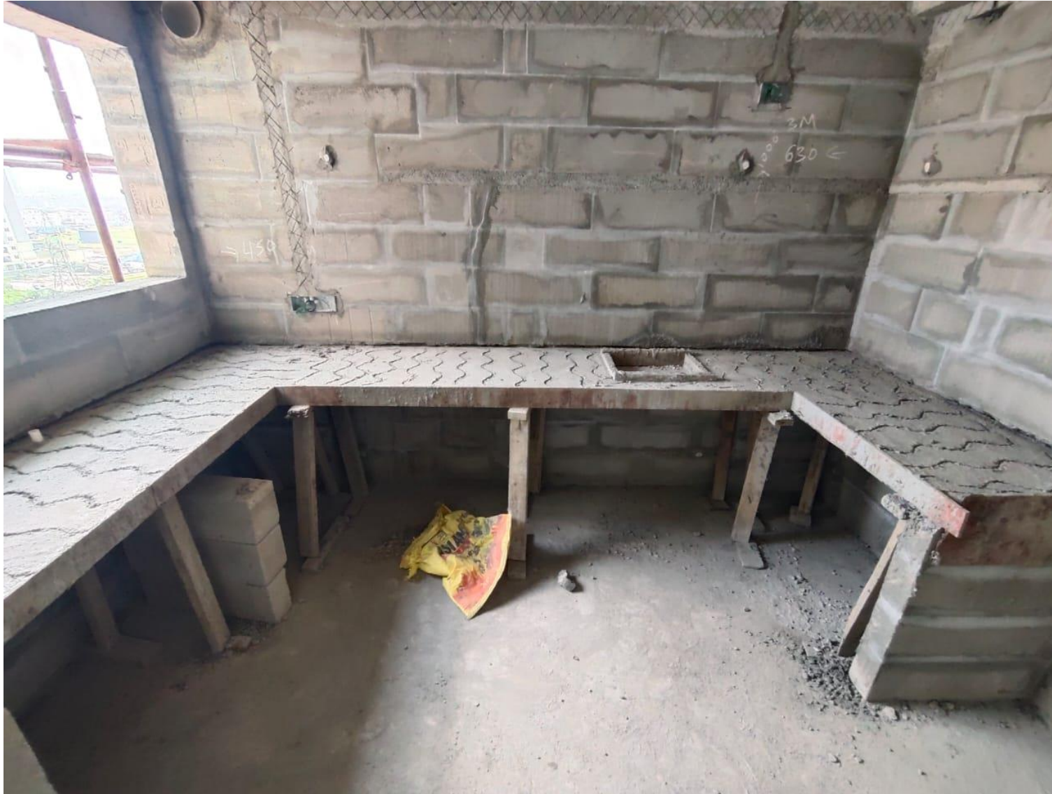
Seventh Floor Kitchen Counter Slab Concrete Work On Progress