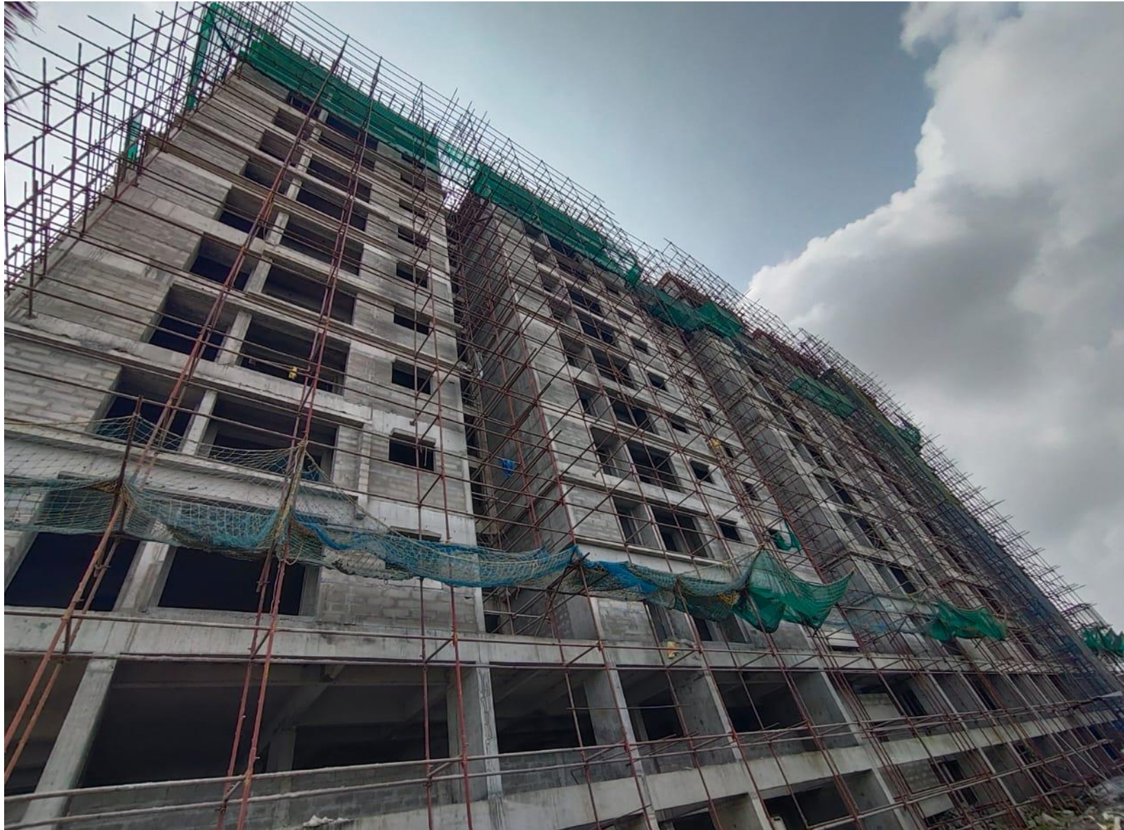
North Side Elevation