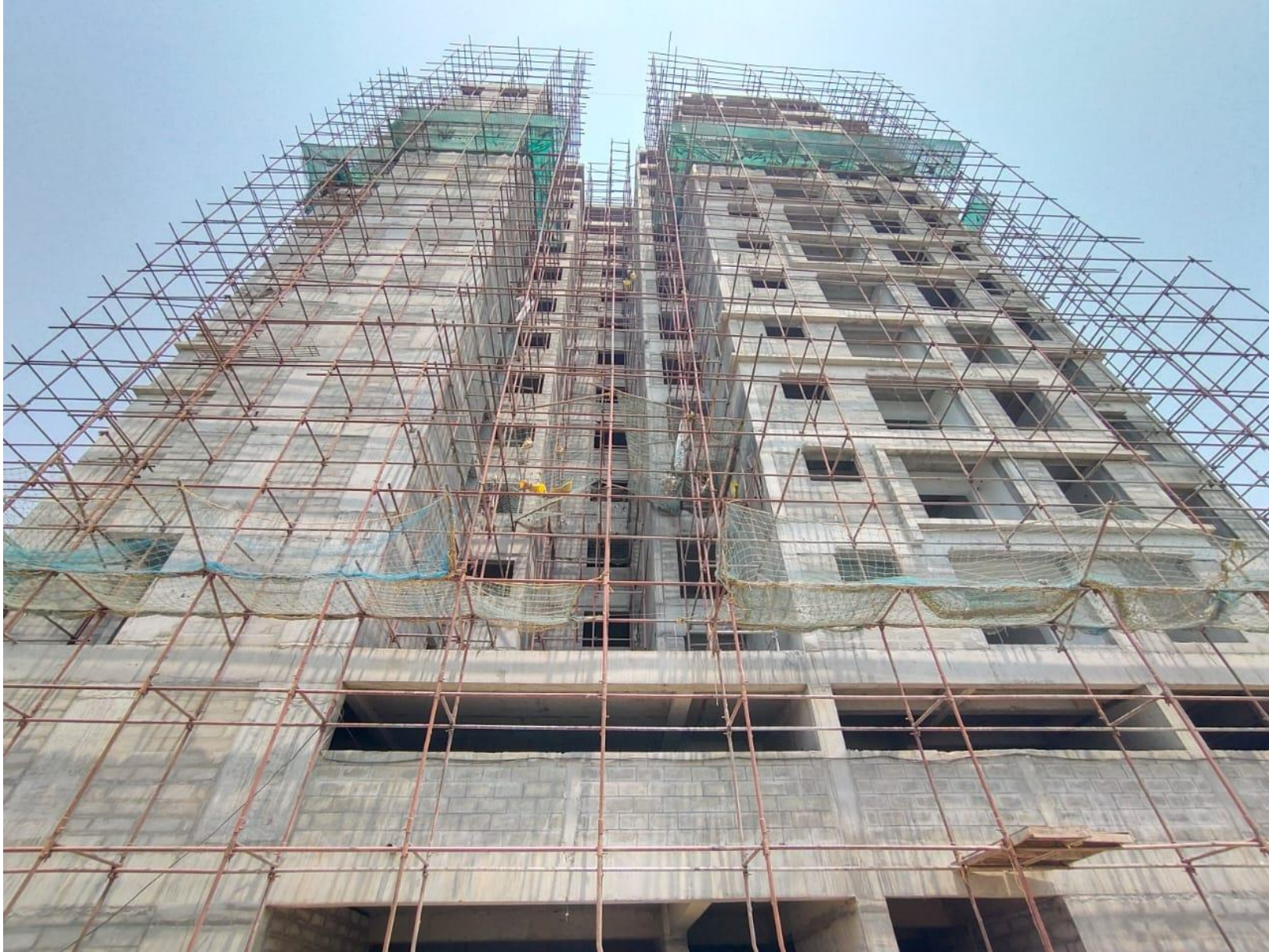
West side Elevation