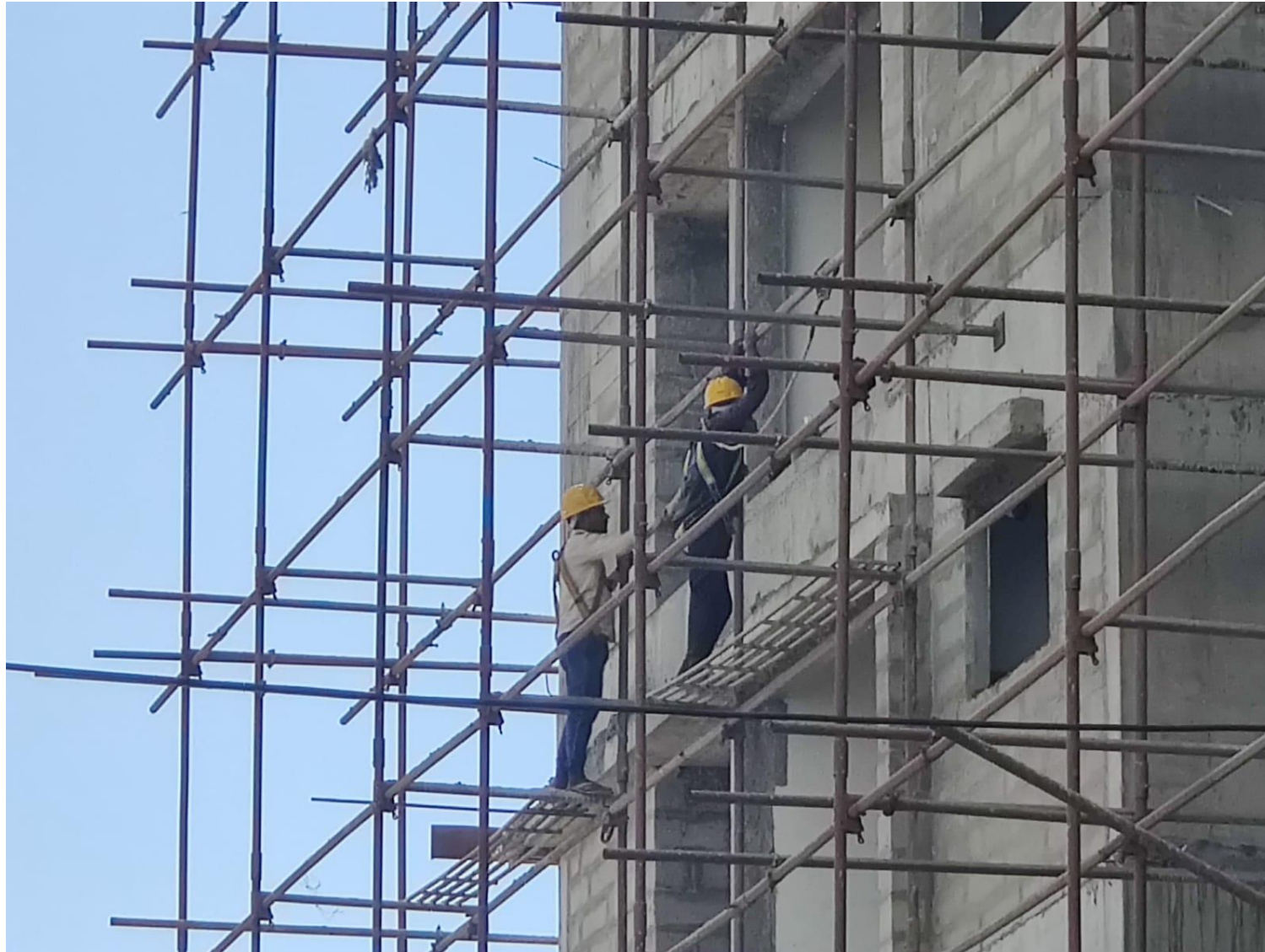
External Plastering Work In Progress