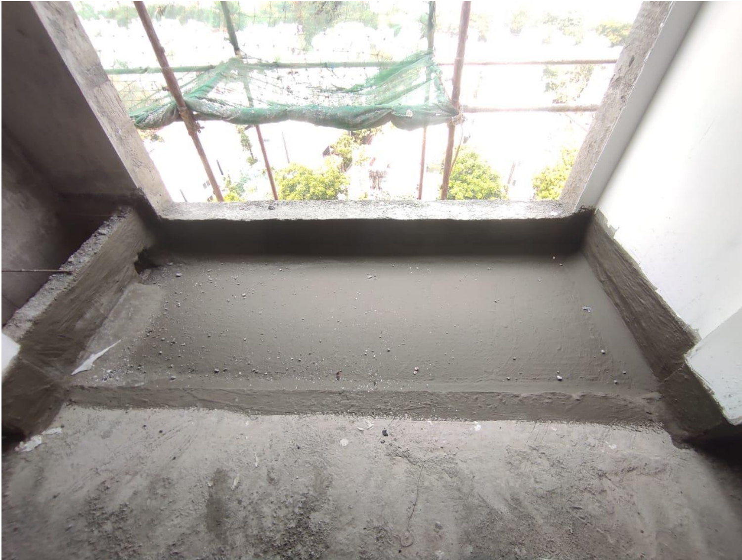
Waterproofing – Ninth Floor Work In Progress