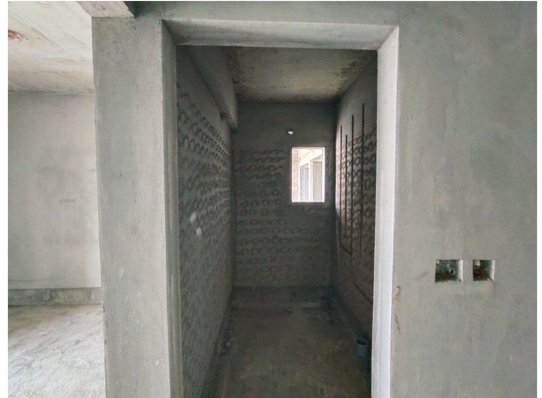
Eleventh Floor Plastering Work In Progress