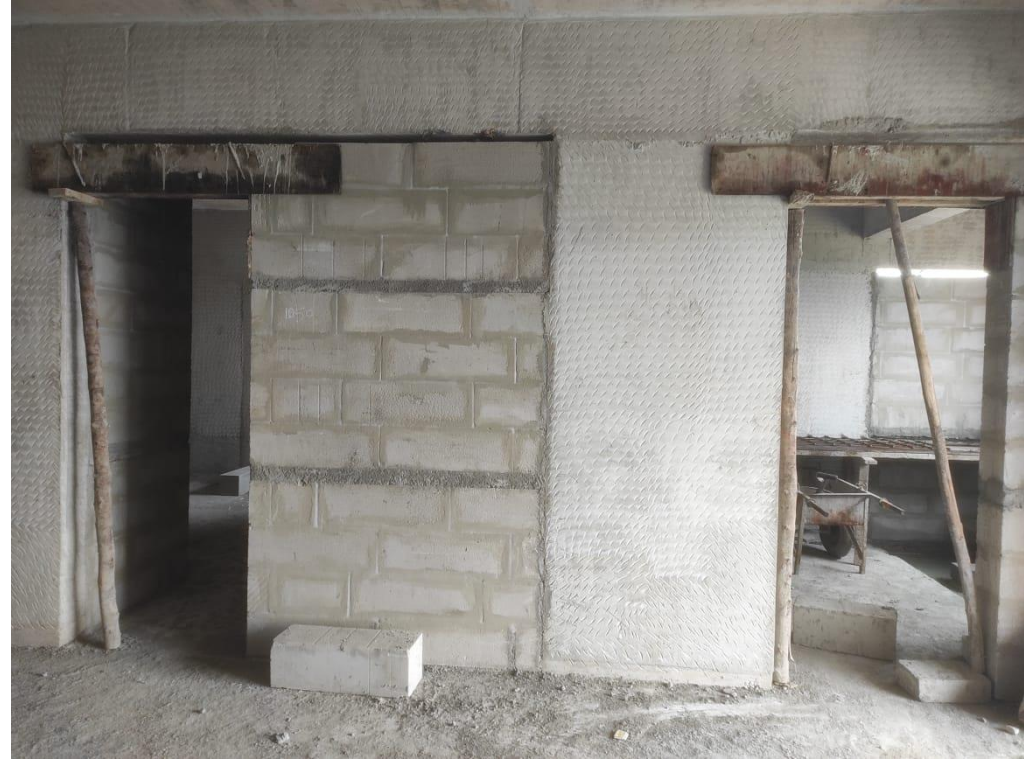
Twelfth Floor Block Work