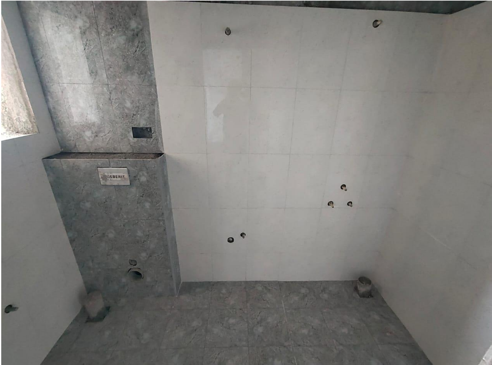
Wall Tile – Sixth Floor Work In Progress