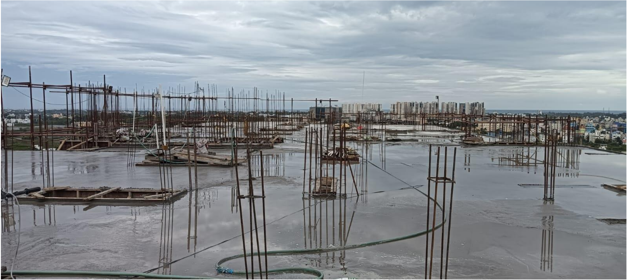
Thirteenth Floor Roof Slab Concrete Work Completed