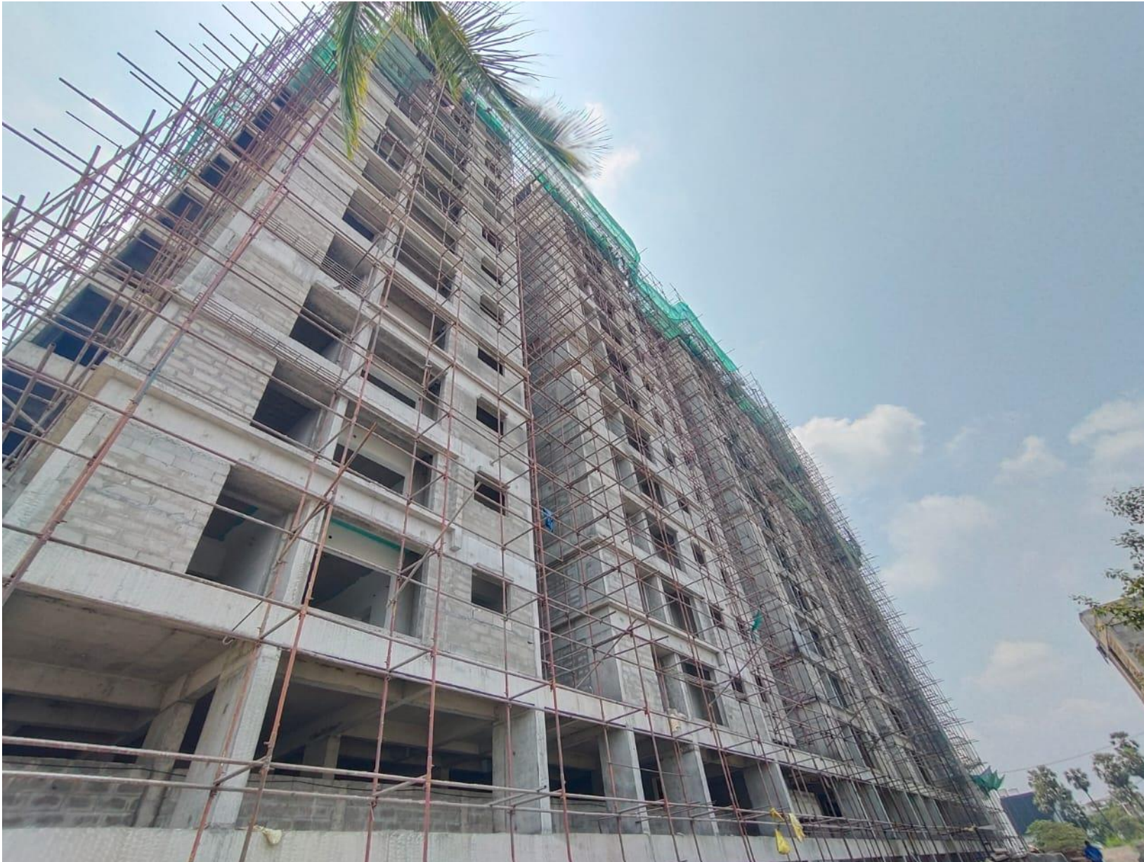
North Side Elevation