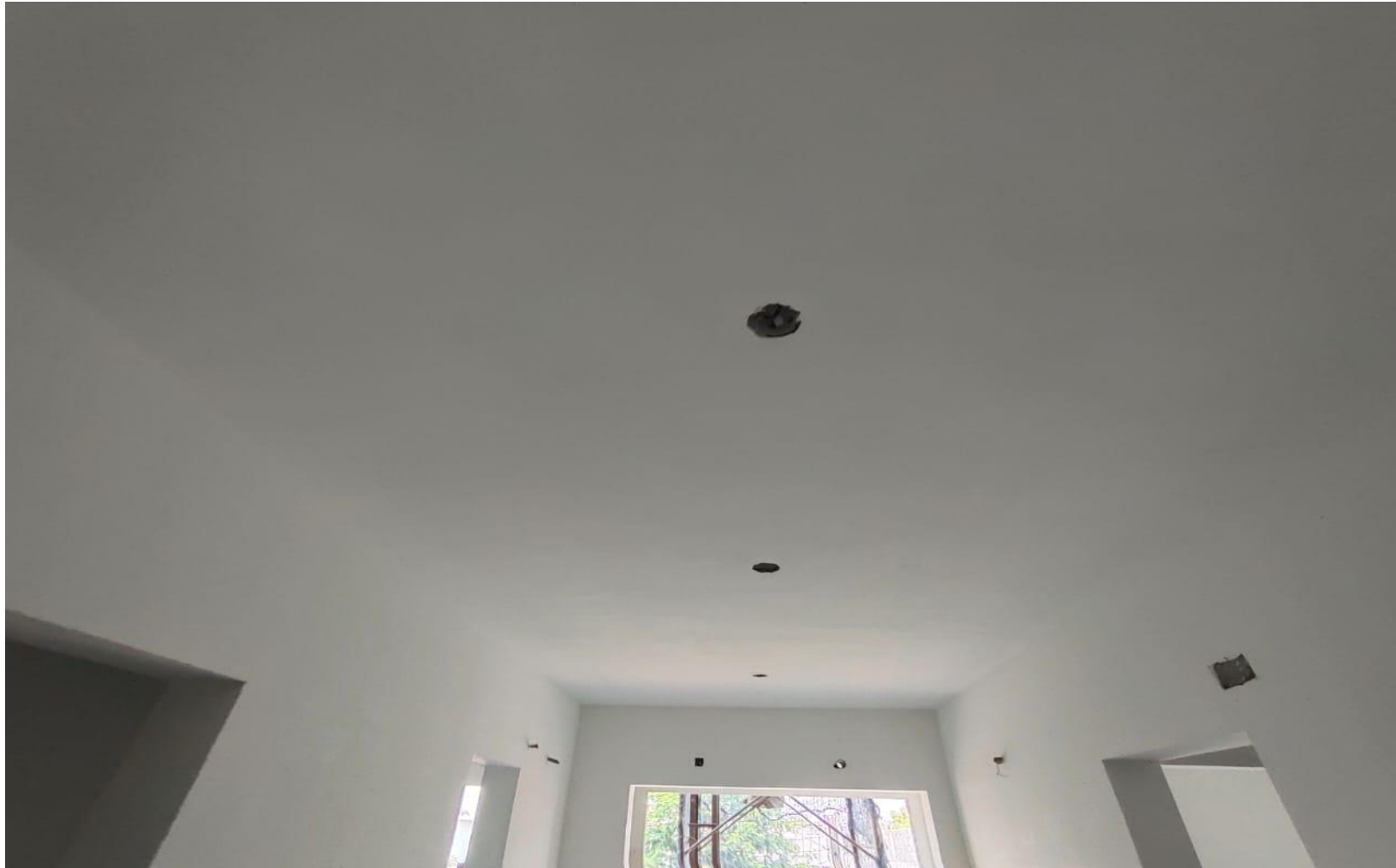
First Floor – 1 st Coat Ceiling Putty Work In Progress