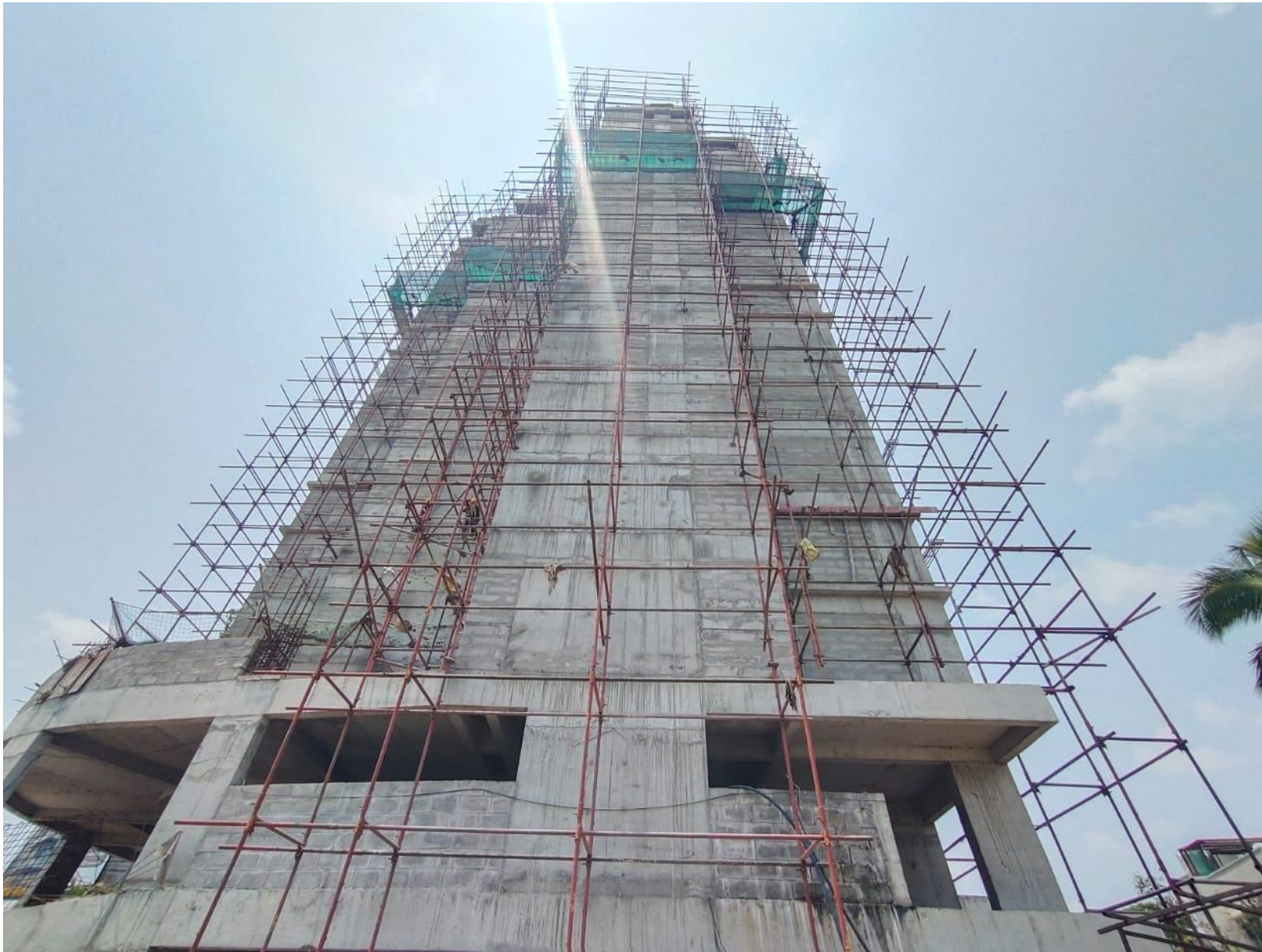
East Side Elevation