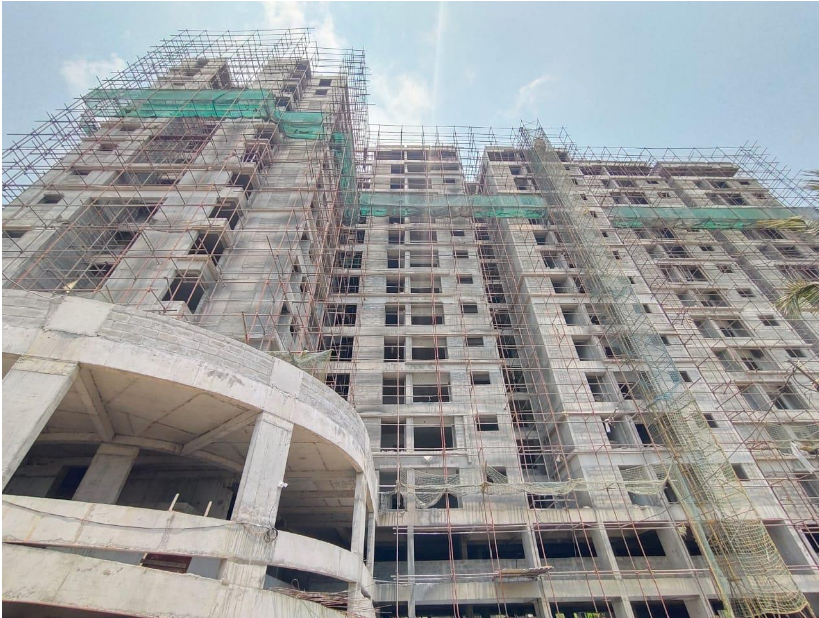
South Side Elevation