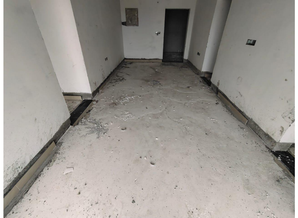
Floor Tile - Third Floor Tile Laying Work In Progress