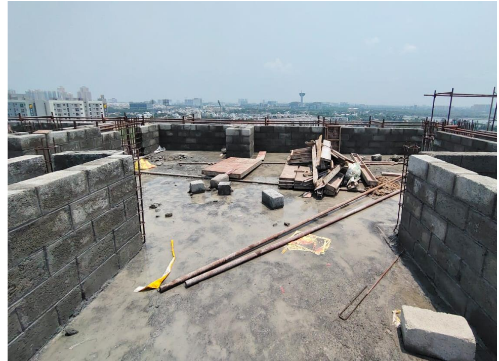
Terrace Parapet Wall Block Work In Progress