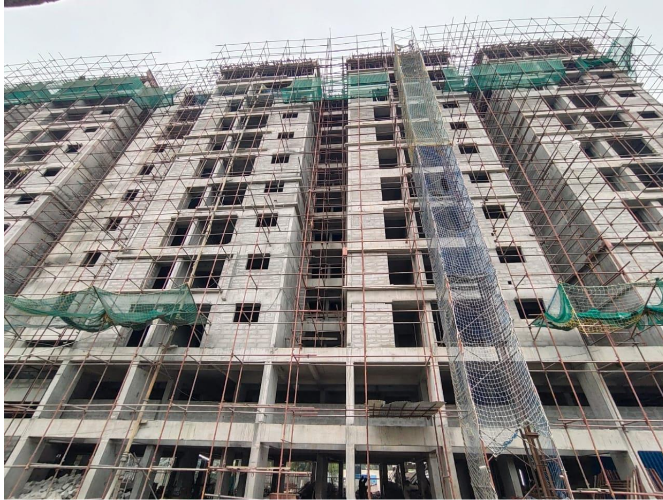
Main Building - North Side View