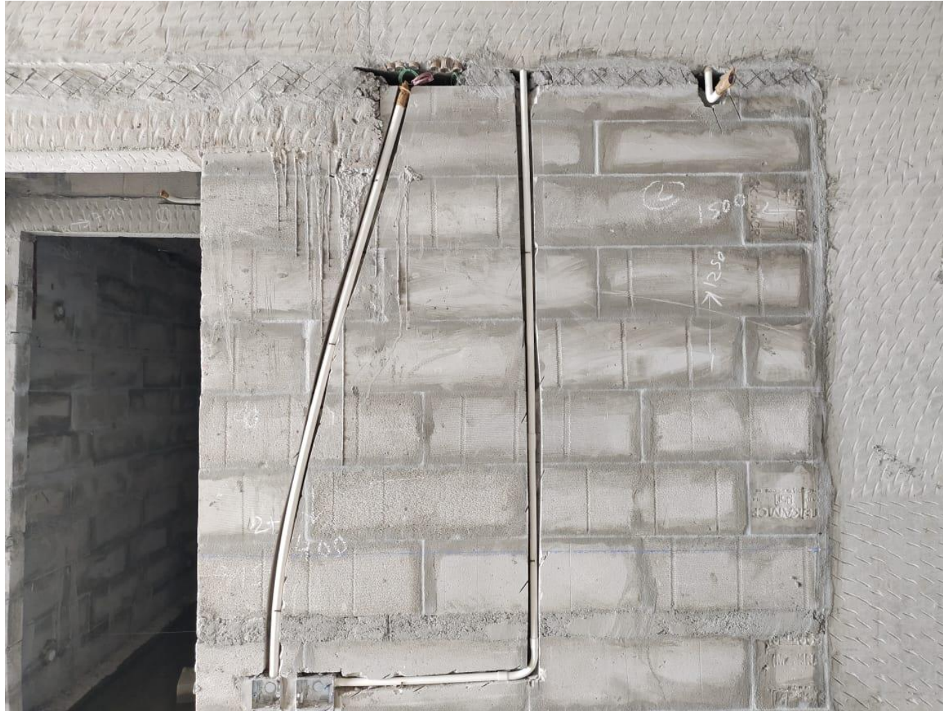
Electrical – Sixth Floor Wall Chasing Work In Progress