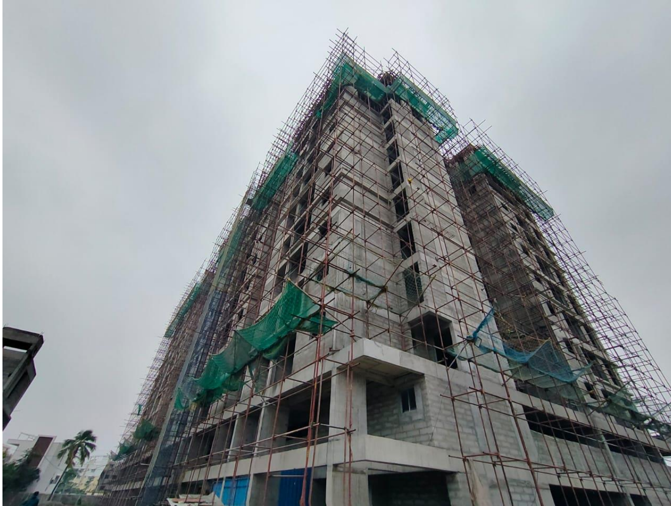
Main Building –Northwest Side View