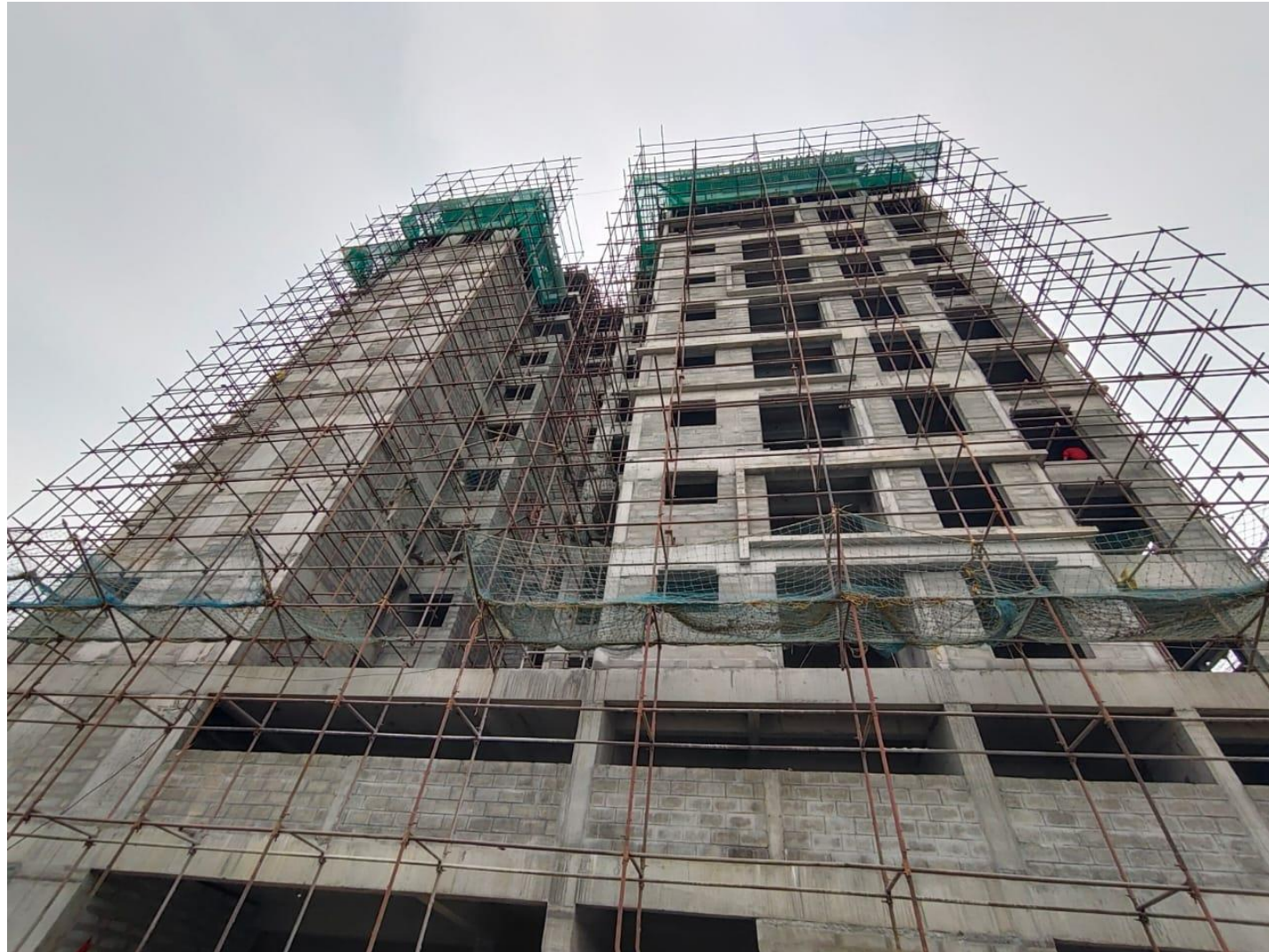
Main Building – West Side View