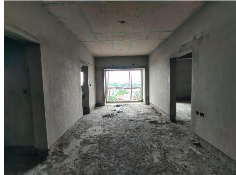
Main Building – Fourth Floor Internal Wall Plastering Work In Progress