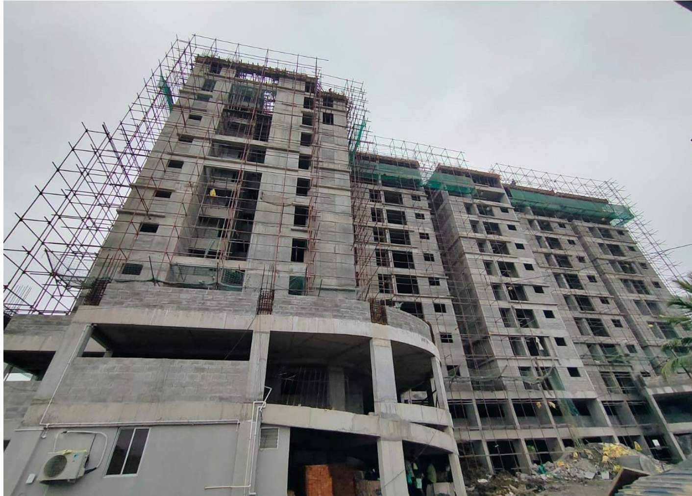
Main Building - South Side View