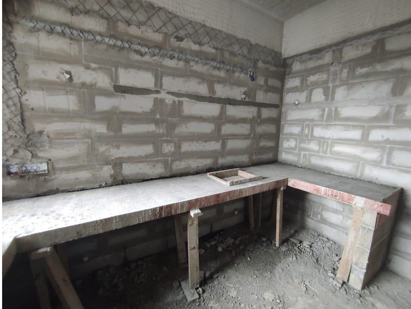
Main Building –Fifth Floor Kitchen Counter Slab Work In Progress