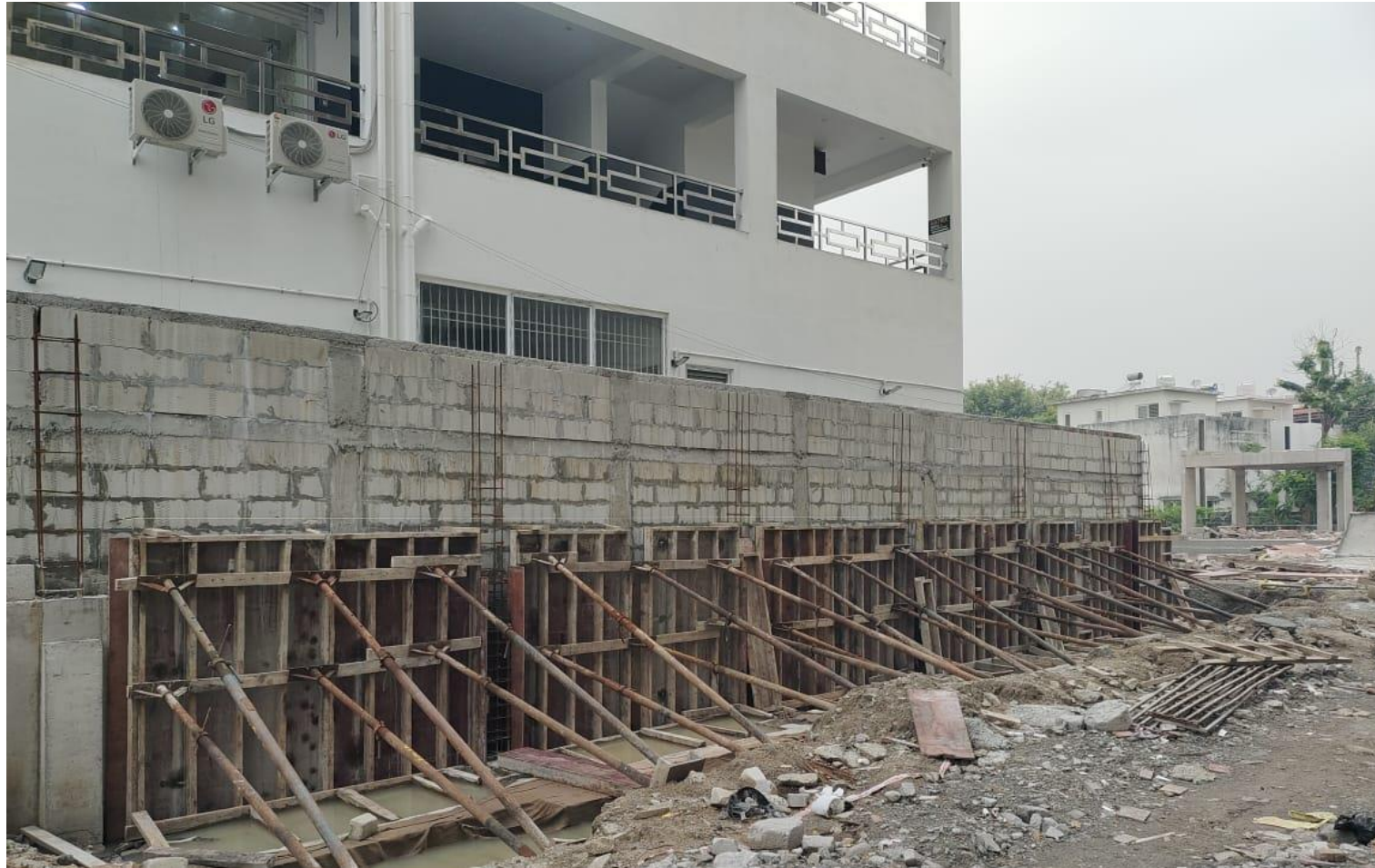
Compound wall – Type-1 Pardi Wall Concrete Work In Progress