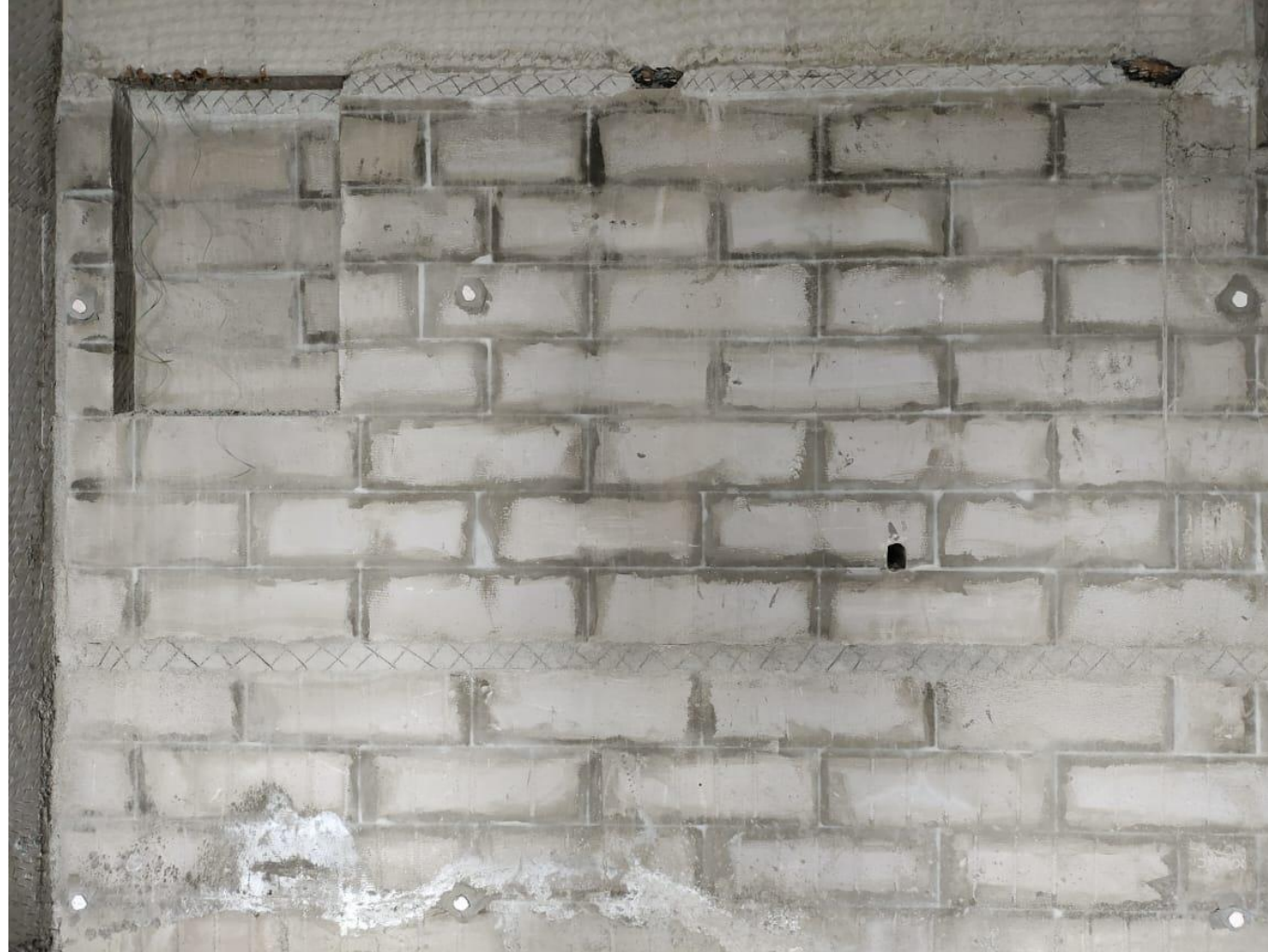
Main Building – Seventh Floor Button Marking Work In Progress