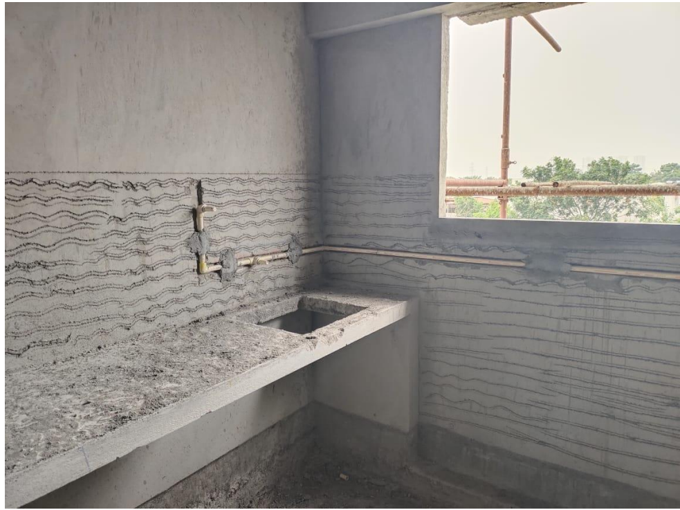
Plumbing – Second Floor Wall Chasing Work In Progress