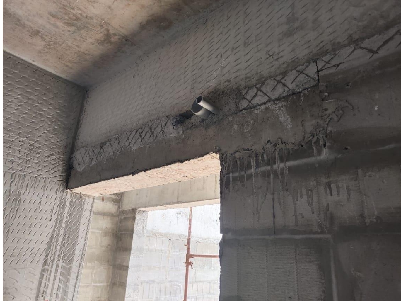
Plumbing – Seventh Floor AC Sleeve Fixing Work Completed