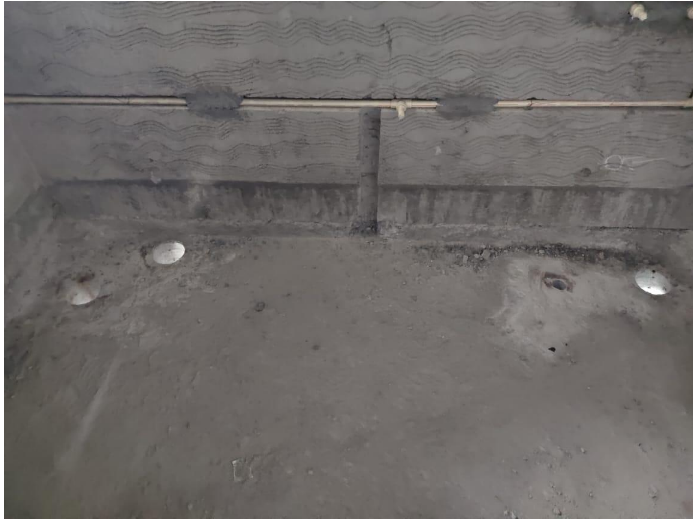
Plumbing – Second Floor Core Cutting Work In Progress