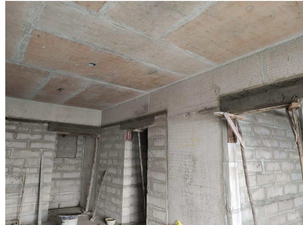
Main Building – Eighth Floor Block Work In Progress