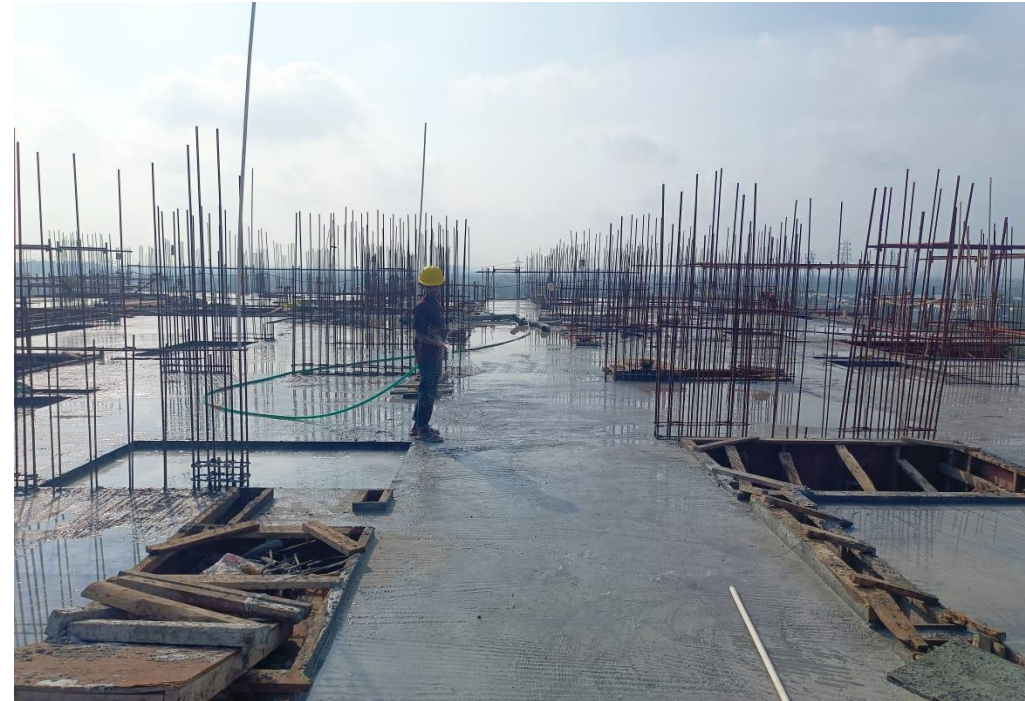
Main Building – Eleventh Floor Roof Slab Completed