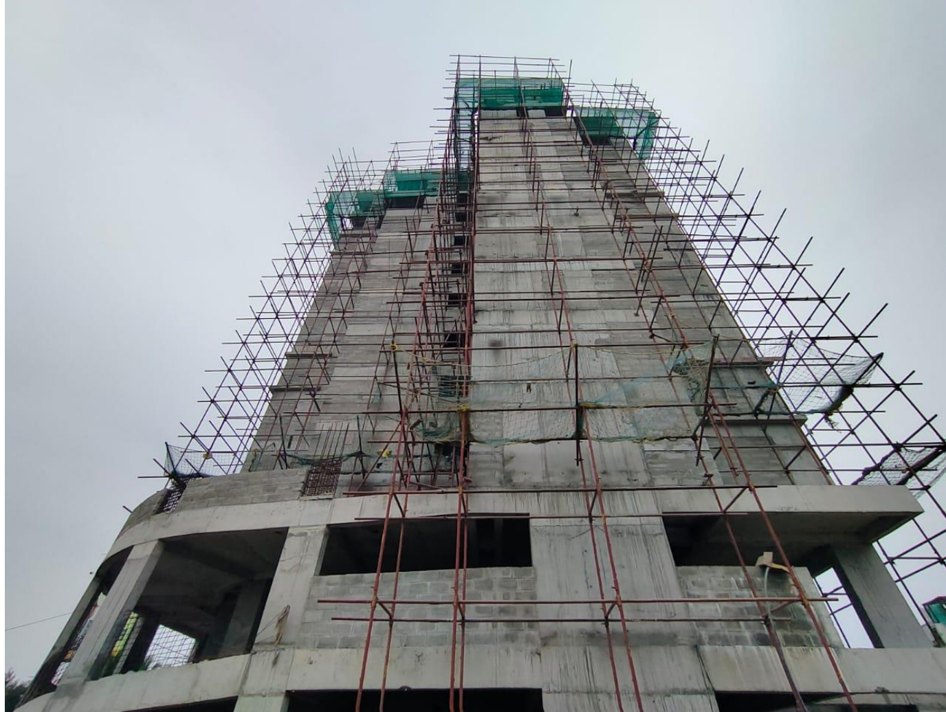
Main Building –East Side View