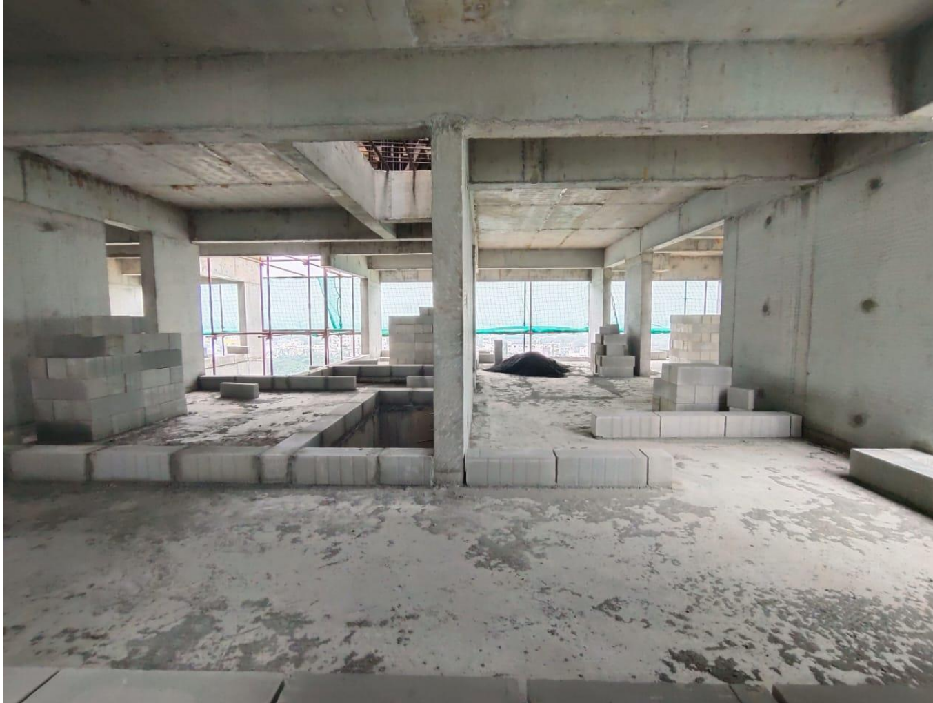
Main Building – Ninth Floor Block Work In Progress