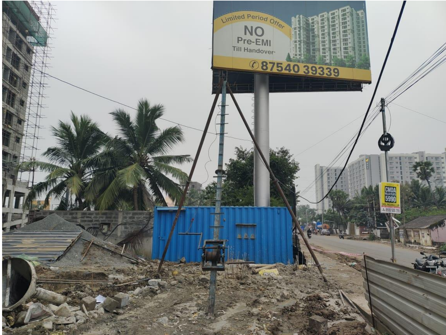
Entrance Arch – Piling Work In Progress