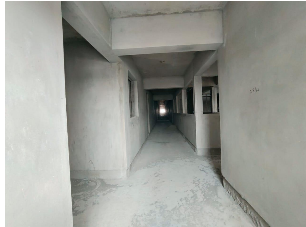
Main Building – Third Floor Internal Wall Plastering Work Completed