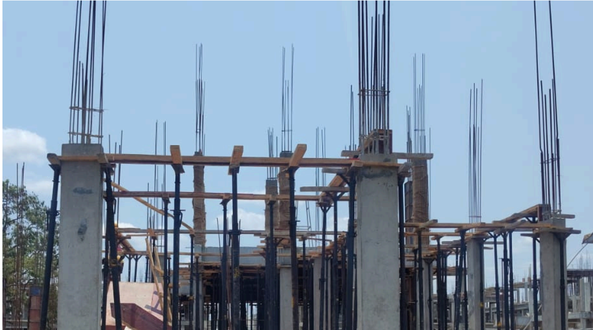
Villa No 119–GF Roof Slab Shuttering Work In Progress