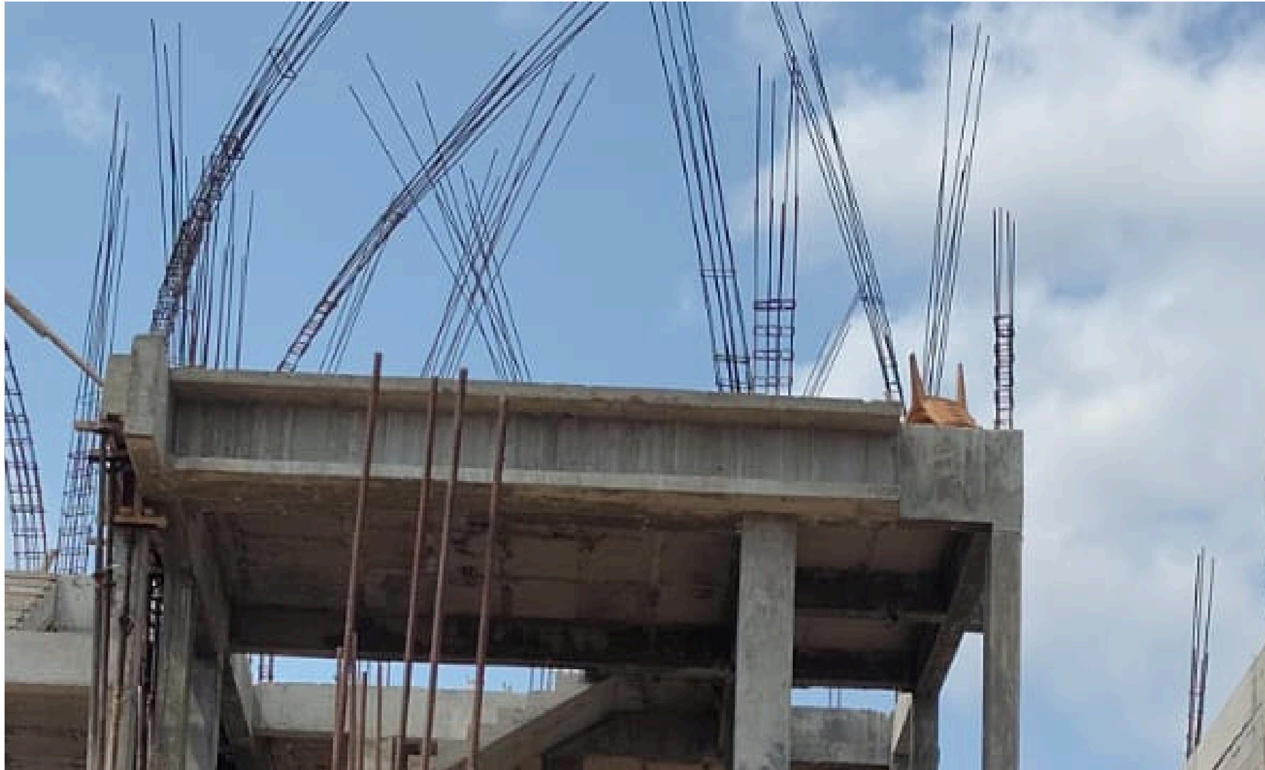
Villa No 28 –Head Room Roof Slab Column Reinforcement Work In Progress