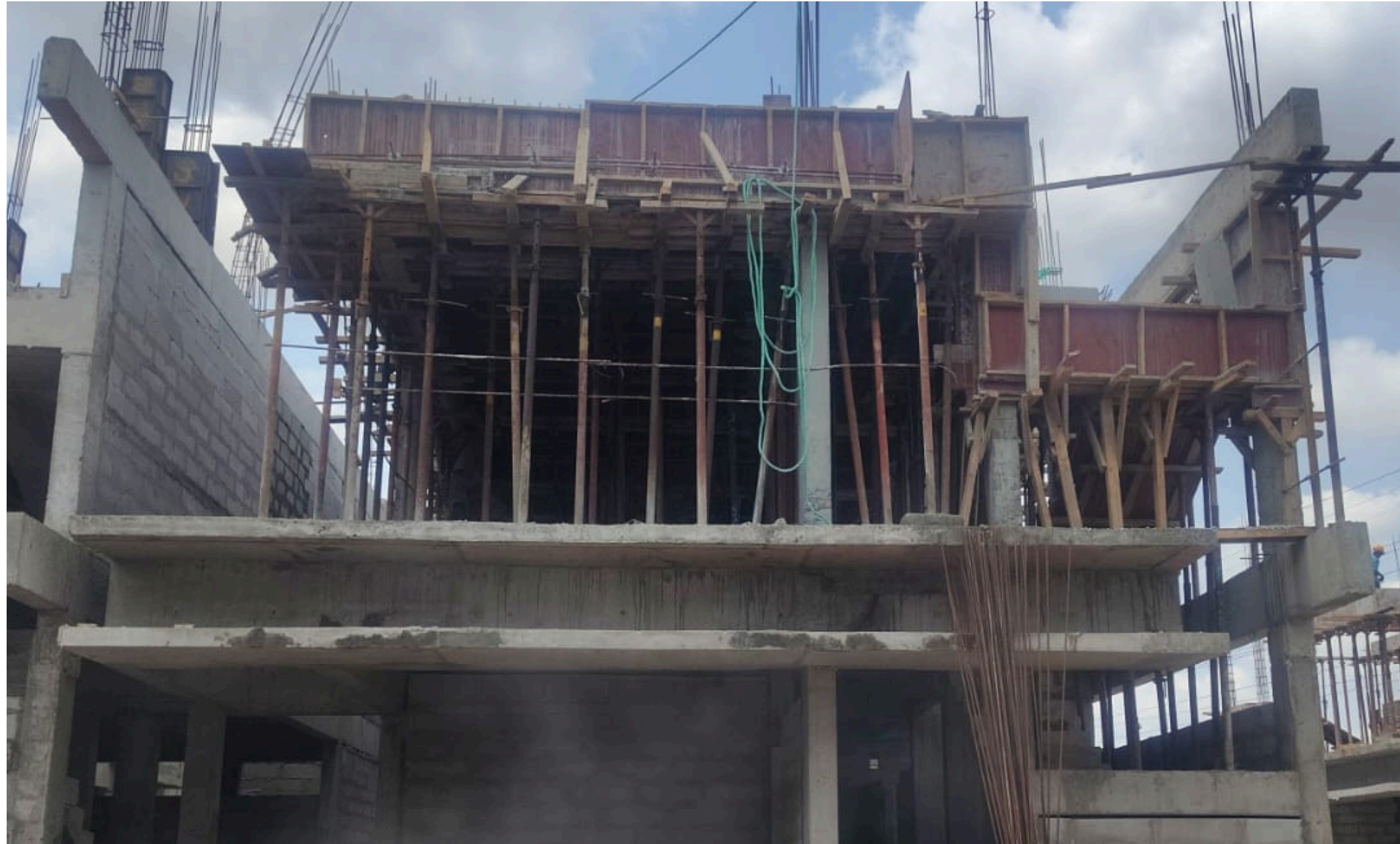
Villa No 43- FF Roof Slab Concrete Pouring Work Completed