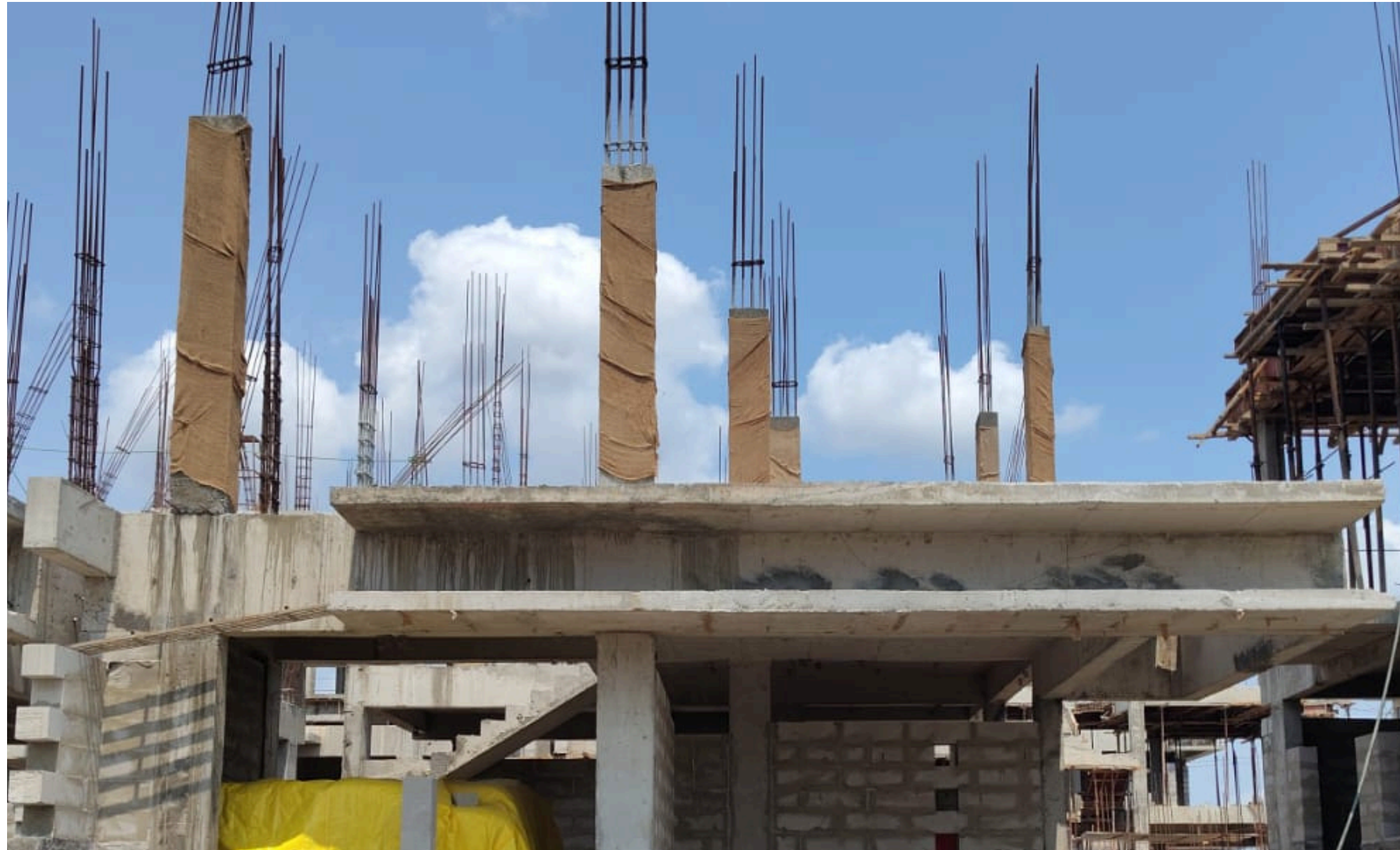
Villa No 32 –FF Column Concrete Pouring Completed