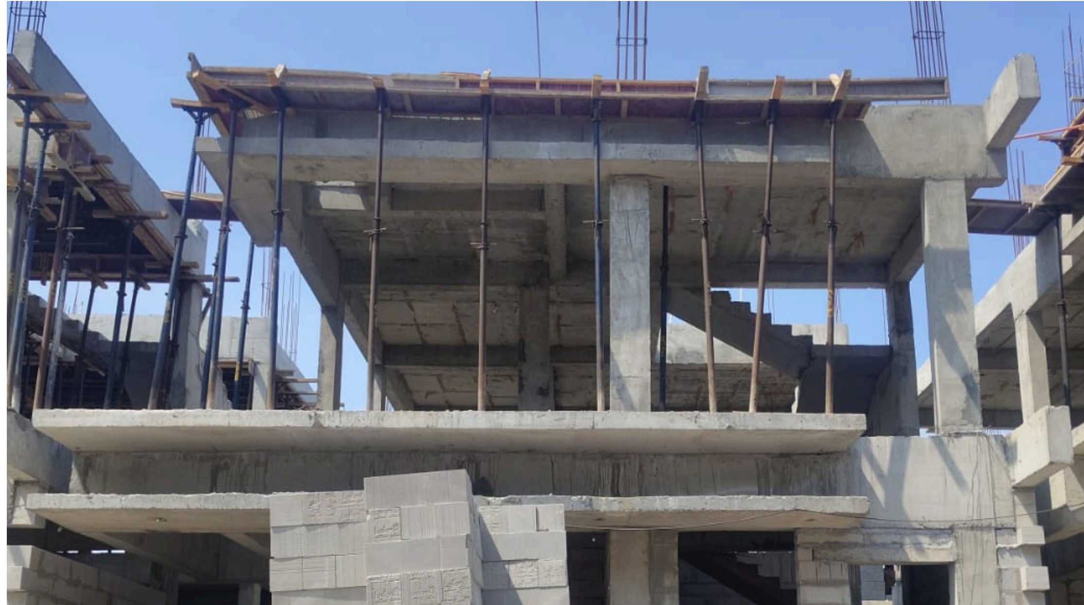
Villa No 66–FF Roof Slab Concrete Pouring Completed