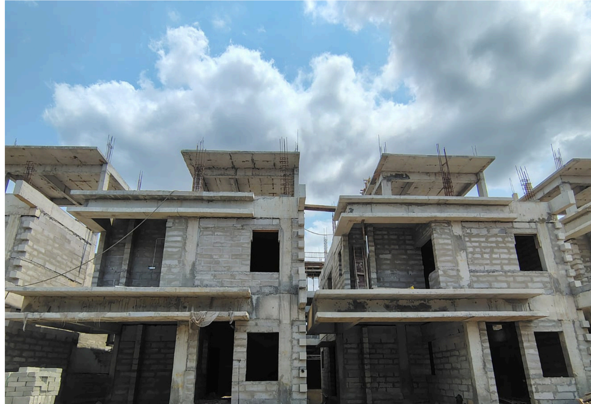
Villa No 49&50- Parapet Wall Column Reinforcement Work In Progress