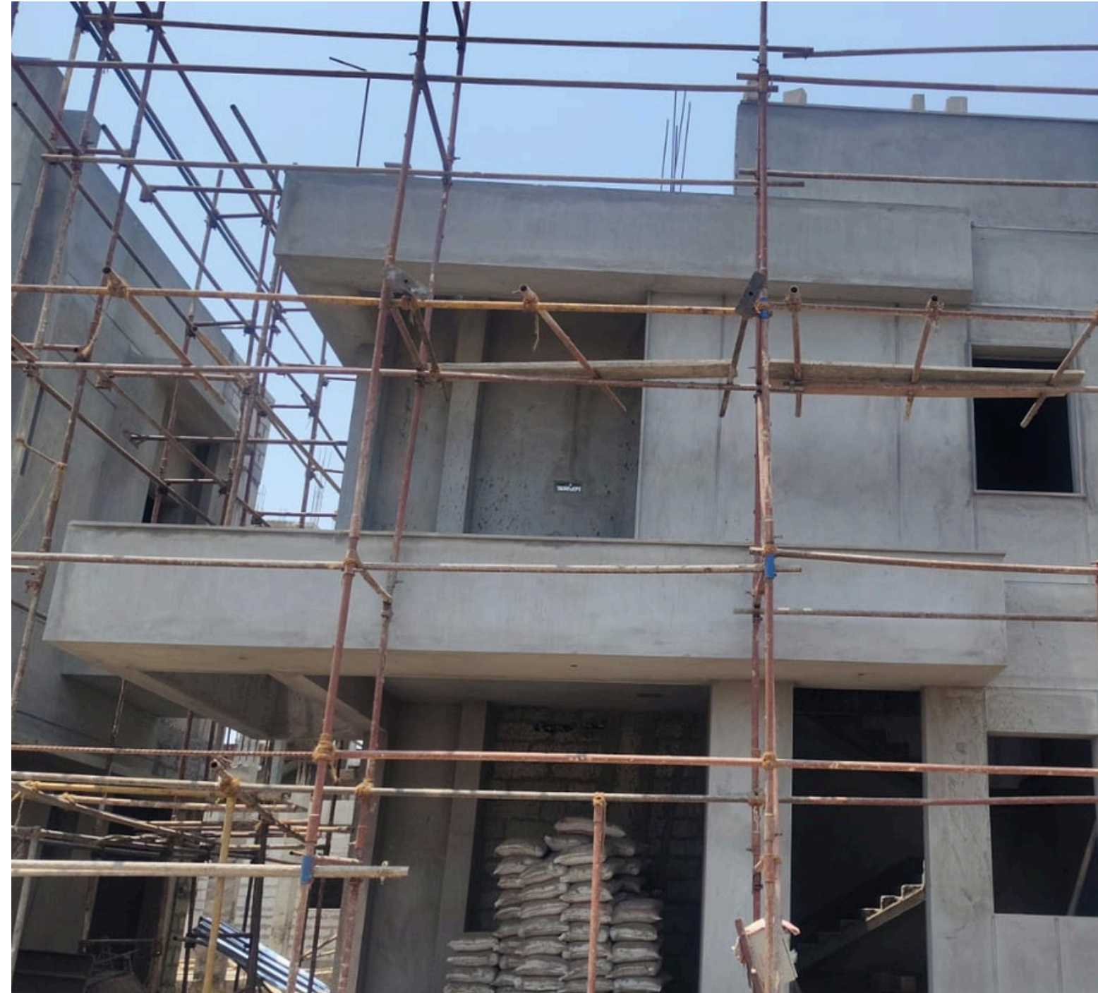
Villa No 74 – External Plastering Work In Progress