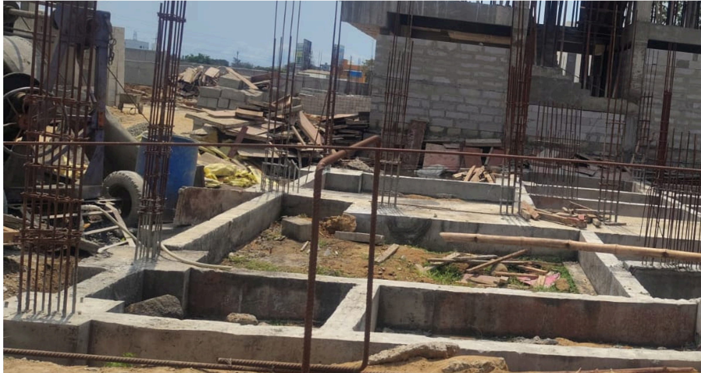
Villa No 35 –Plinth Beam Concrete Pouring work Completed