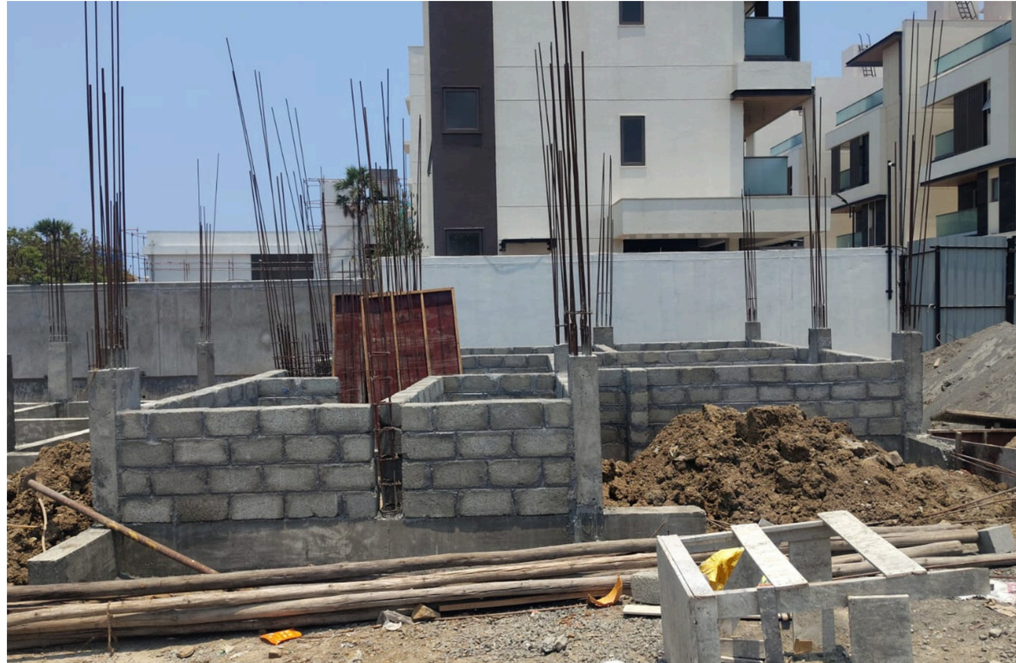
Villa No 123–Basement Block Work Completed