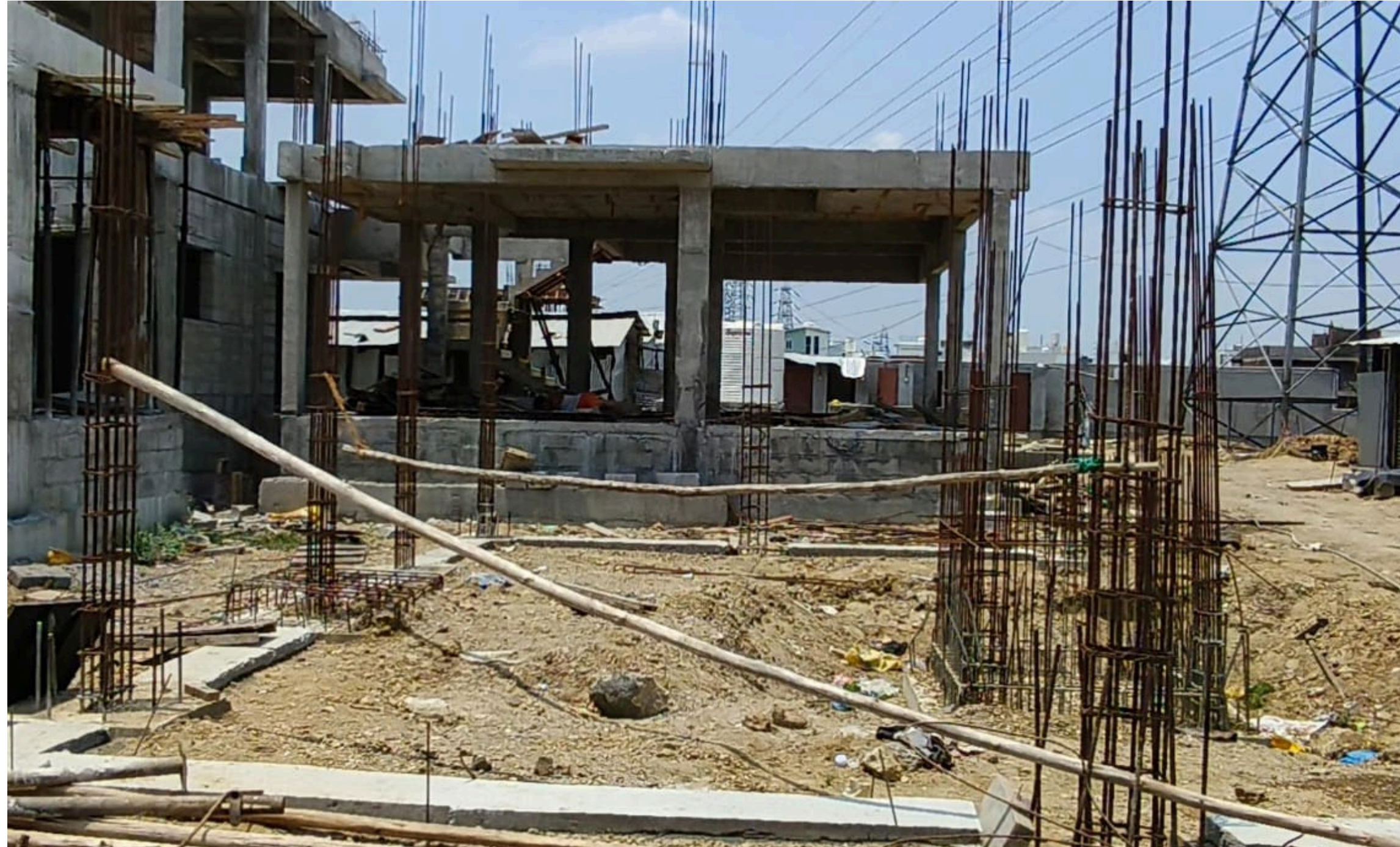
Villa No 82- Plinth Beam PCC Pouring Work In Progress