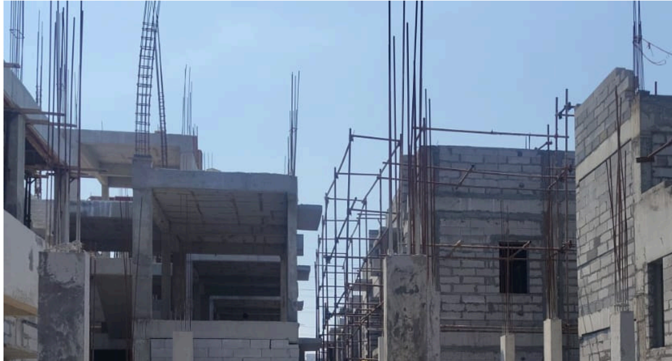
Villa No 72 –GF Column Concrete Pouring Completed