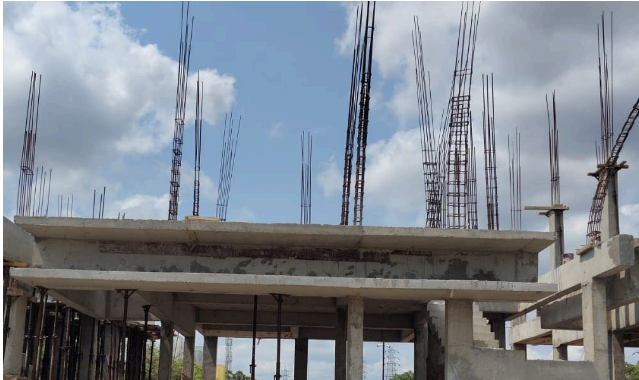
Villa No 24- FF Column Reinforcement work In Progress