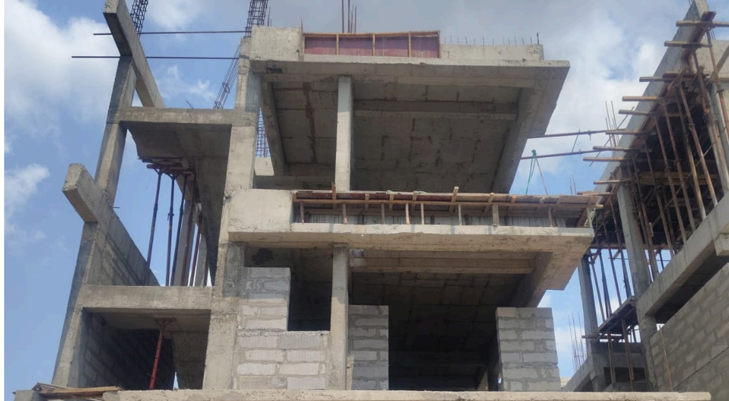
Villa No 39 –Head Room Column Reinforcement Work In Progress