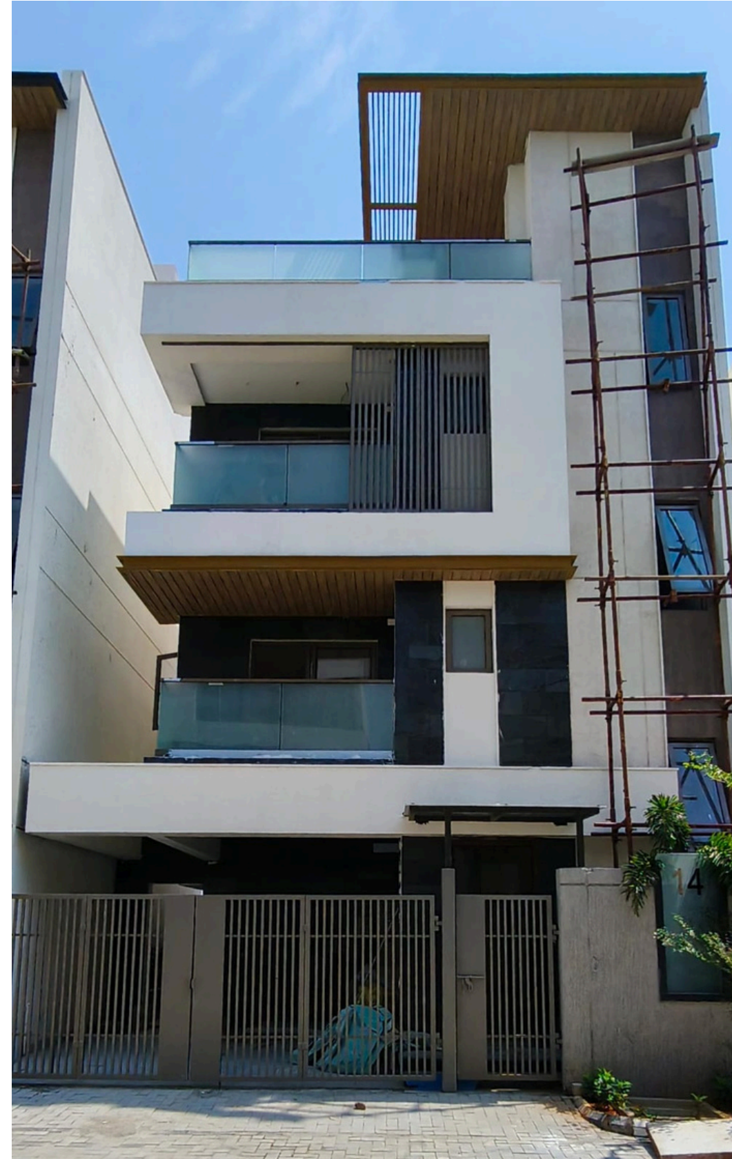
Villa No 14 –Front Elevation View