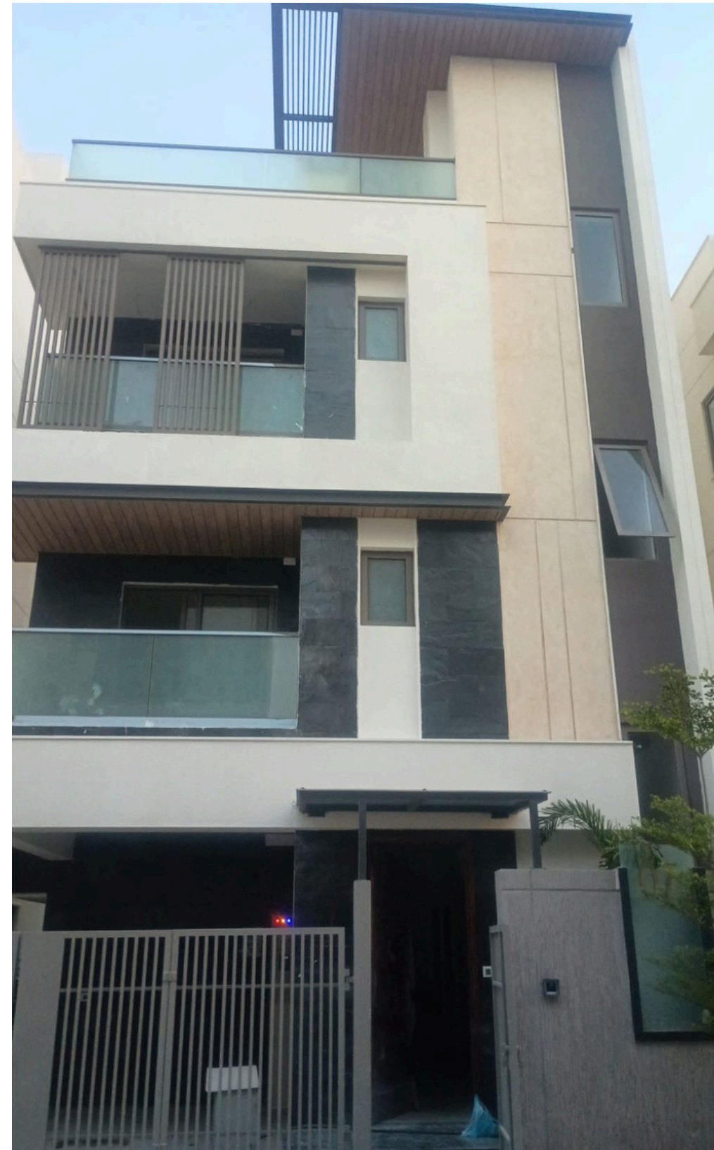
Villa No 7 –Front Elevation View