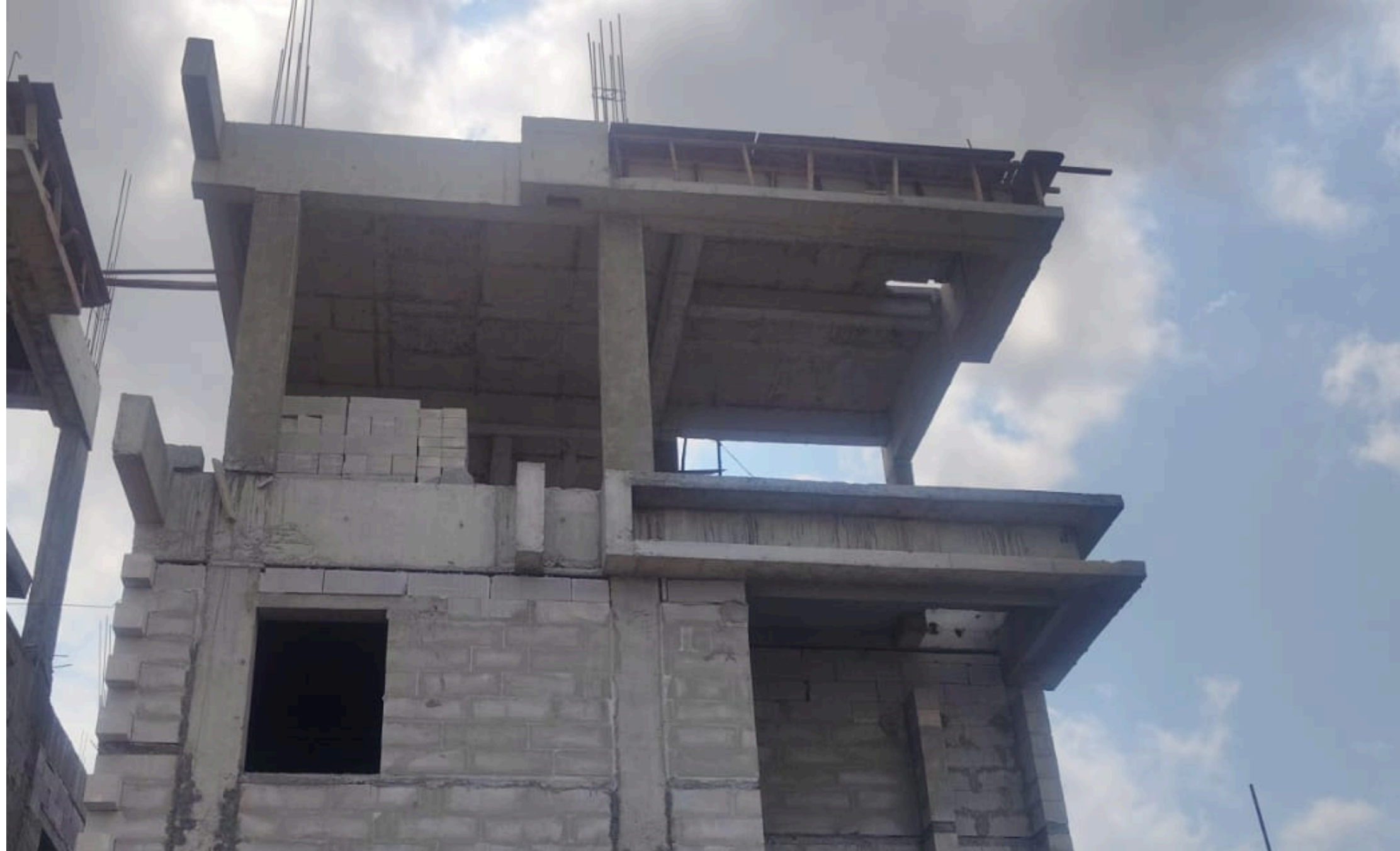
Villa No 45-FF Block Work Completed