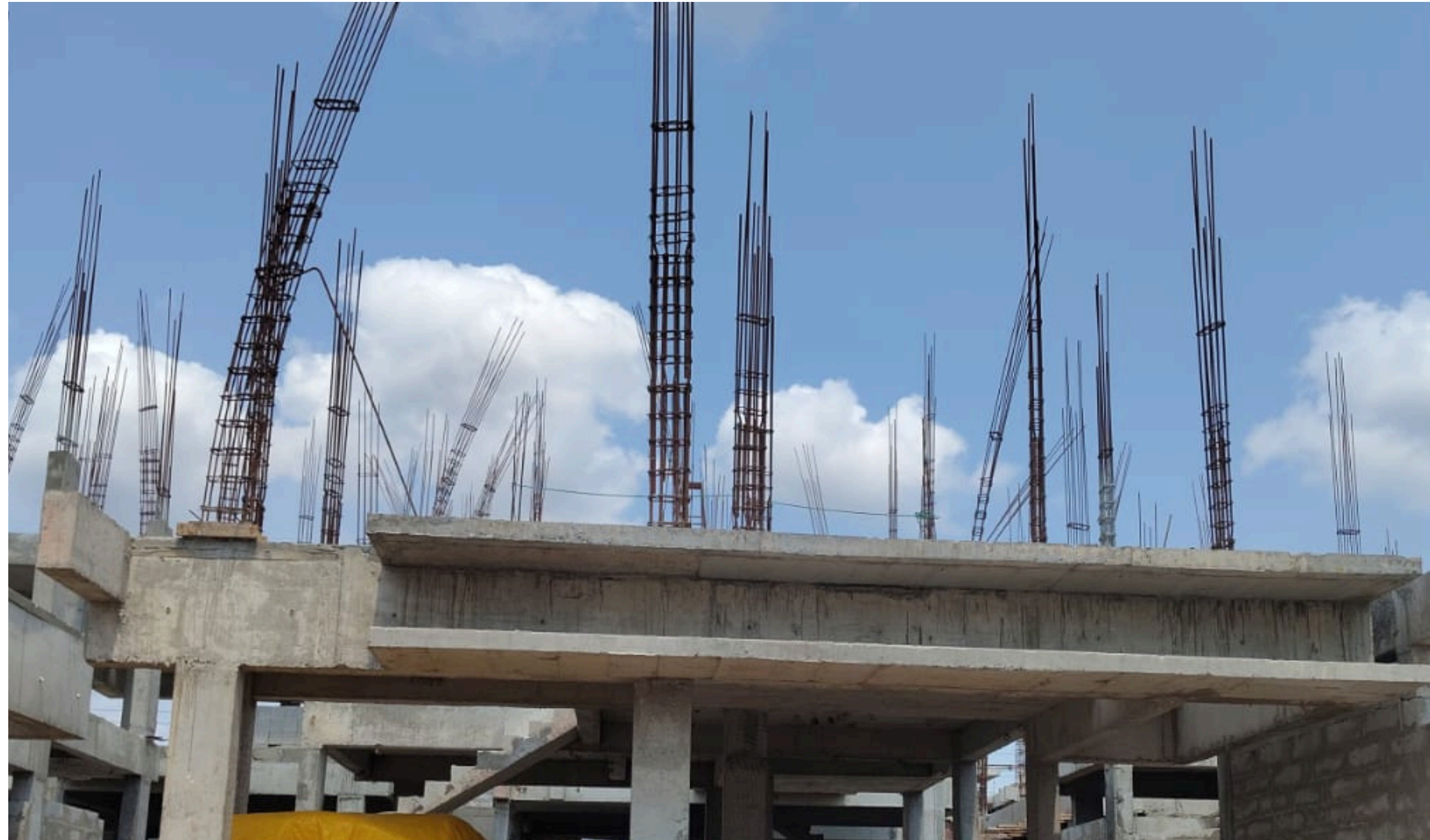
Villa No 31- FF Column Reinforcement Work In Progress