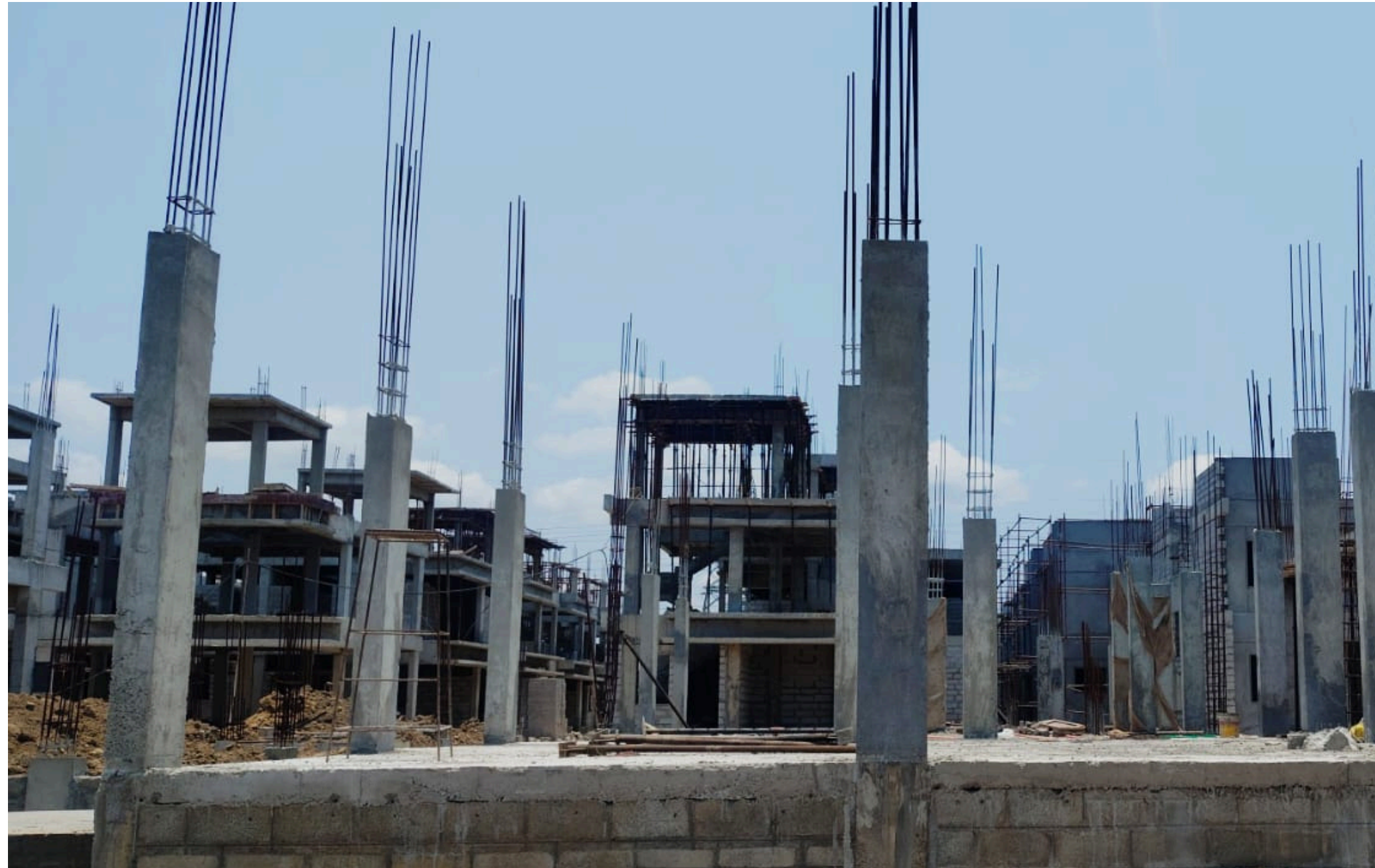
Villa No 103–GF Column Concrete Pouring Work Completed