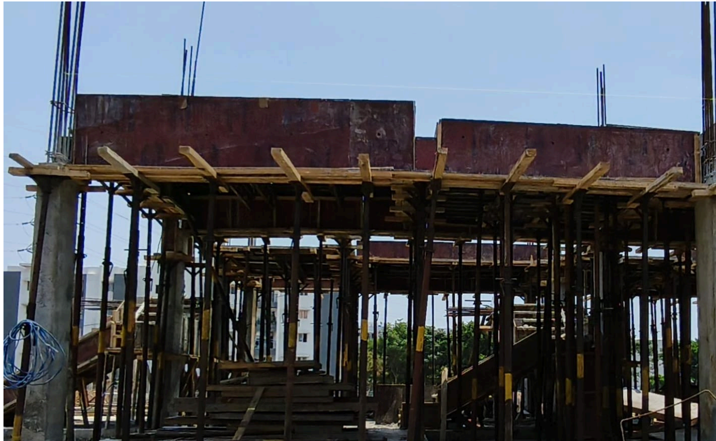
Villa No 91–GF Roof Slab Shuttering Work In Progress