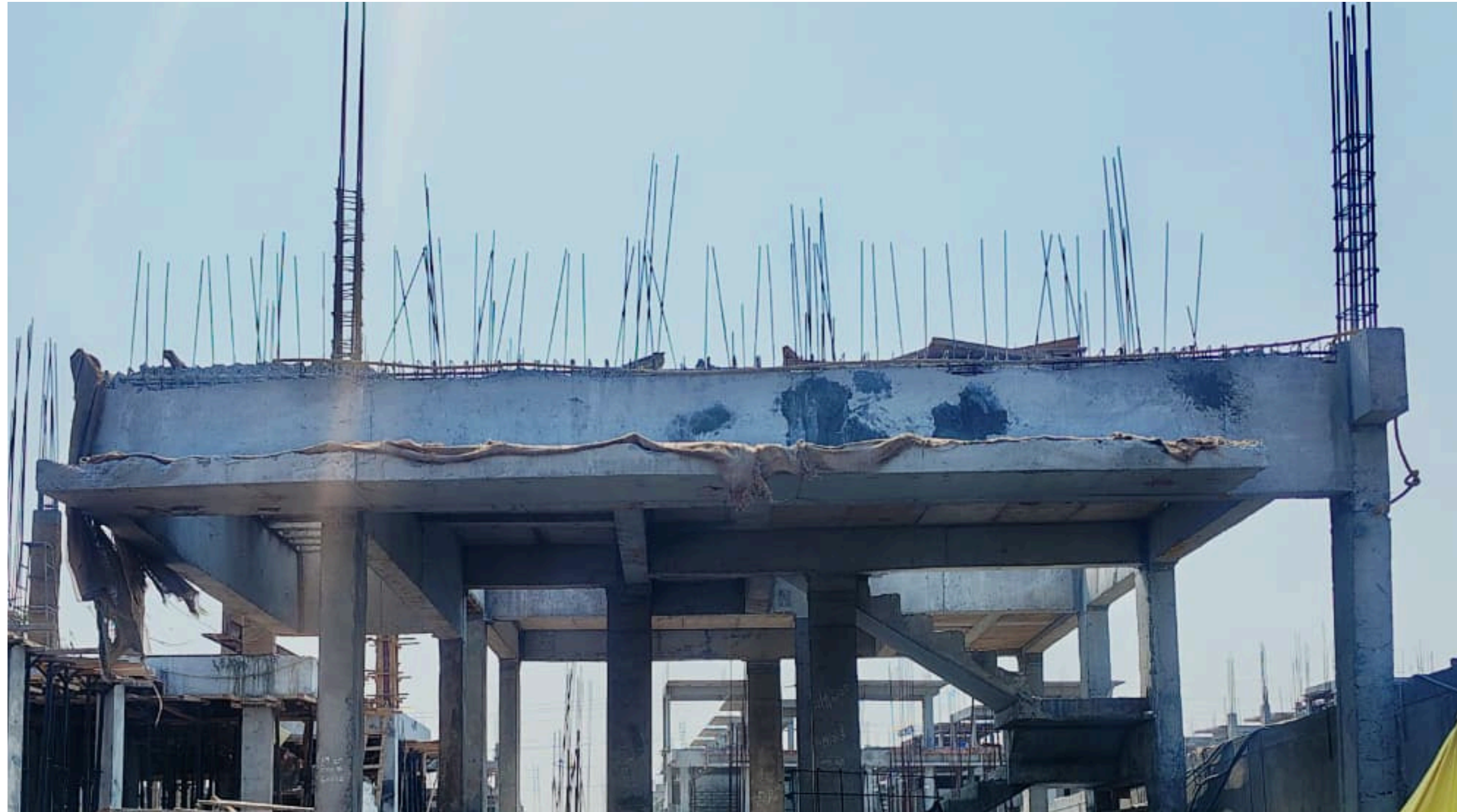
Villa No 120–FF Column Reinforcement Work In Progress