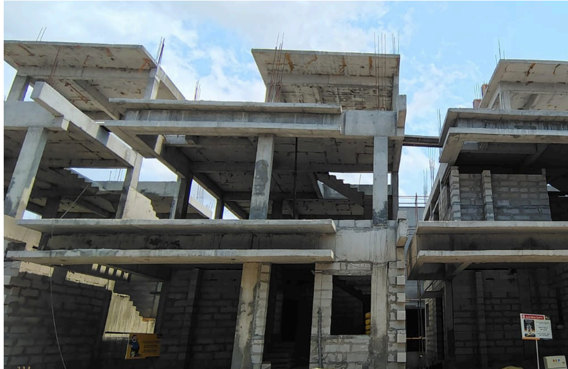
Villa No 68&69–FF Block Work In Progress