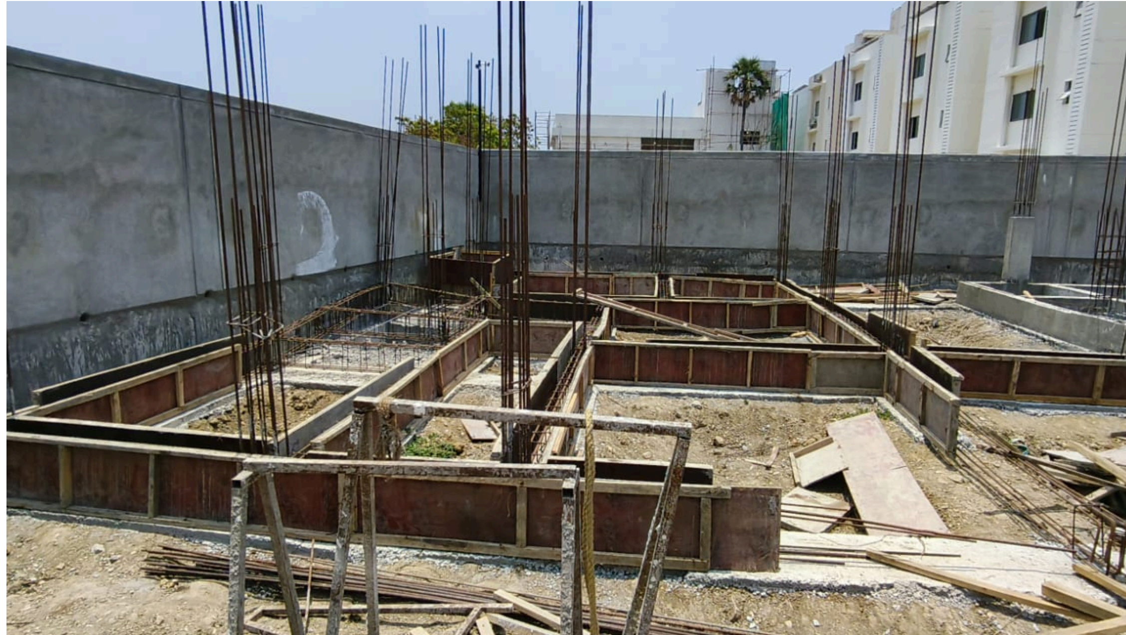
Villa No 121–Plinth Beam Shuttering Work In Progress