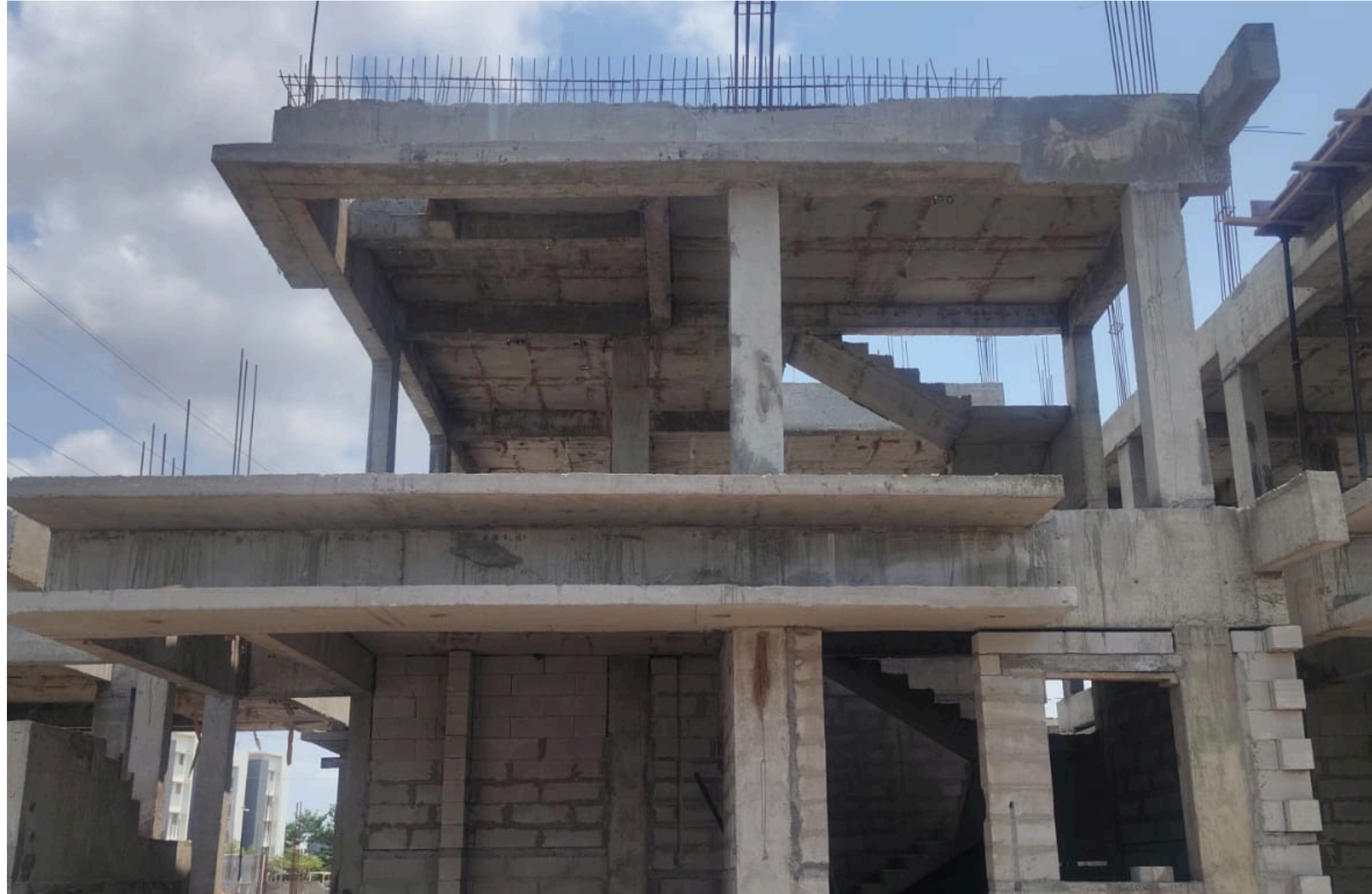
Villa No –63 GF Block Work Completed