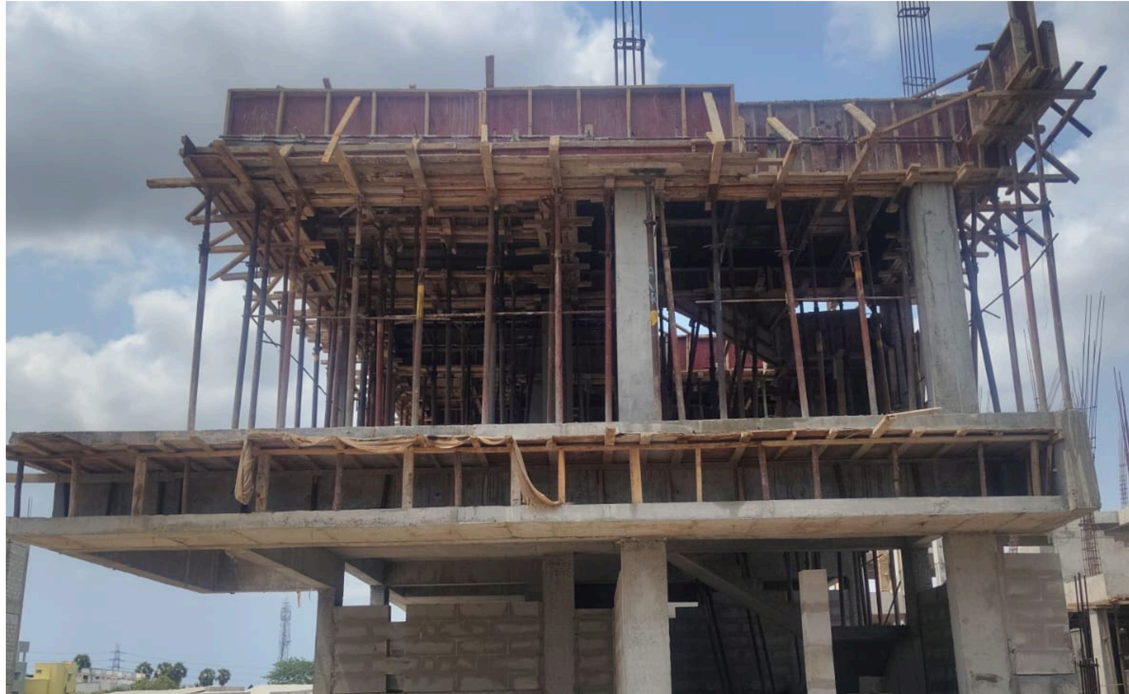
Villa No 33 –FF Roof Slab Concrete Pouring work Completed