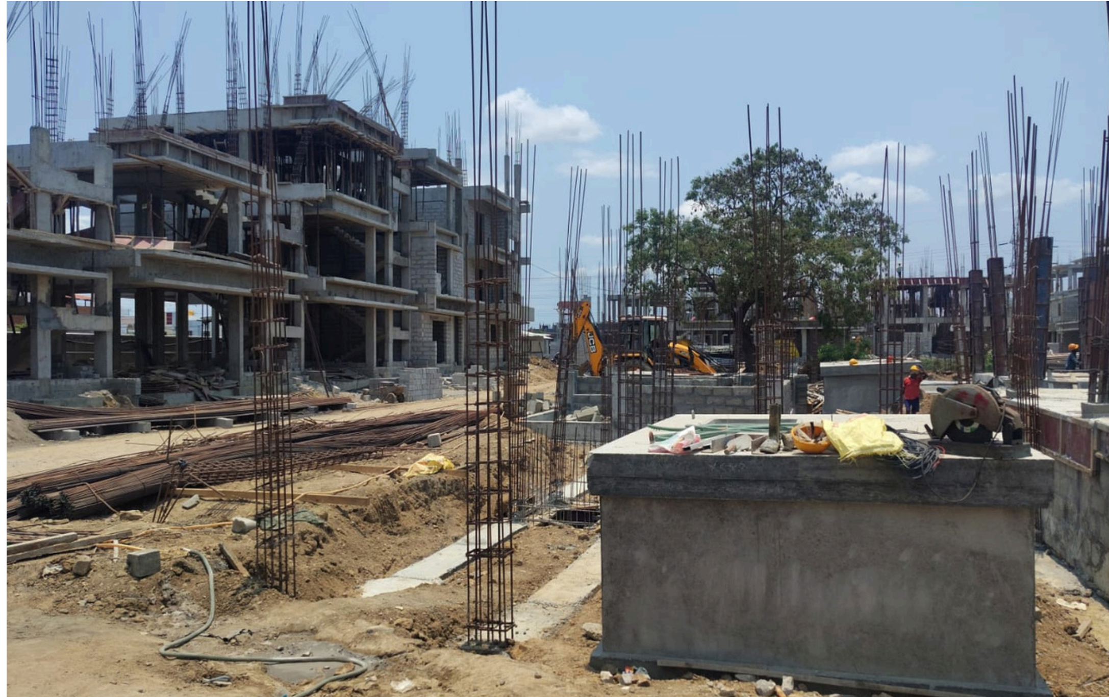
Villa No 117–Plinth Beam PCC Pouring Completed