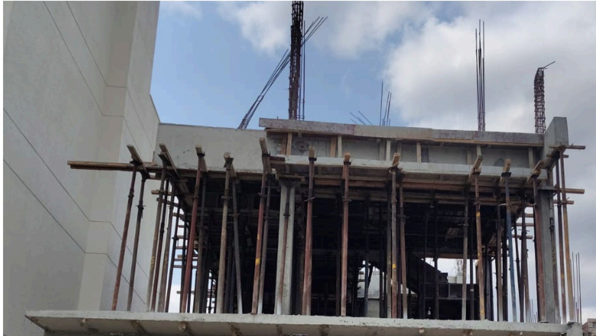
Villa No 22 –SF Column Reinforcement work In Progress