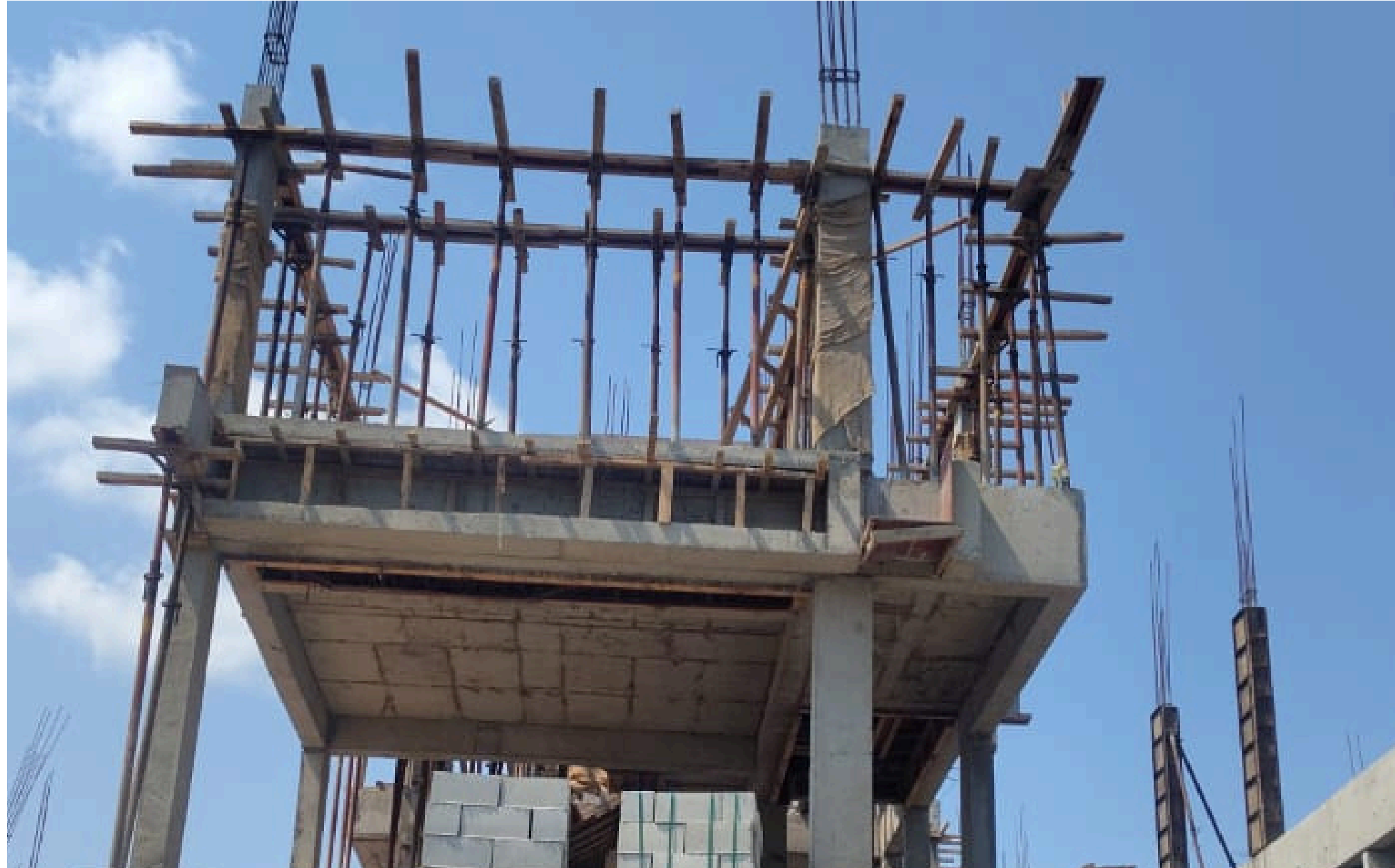
Villa No 41- SF Roof Slab Shuttering work Progress