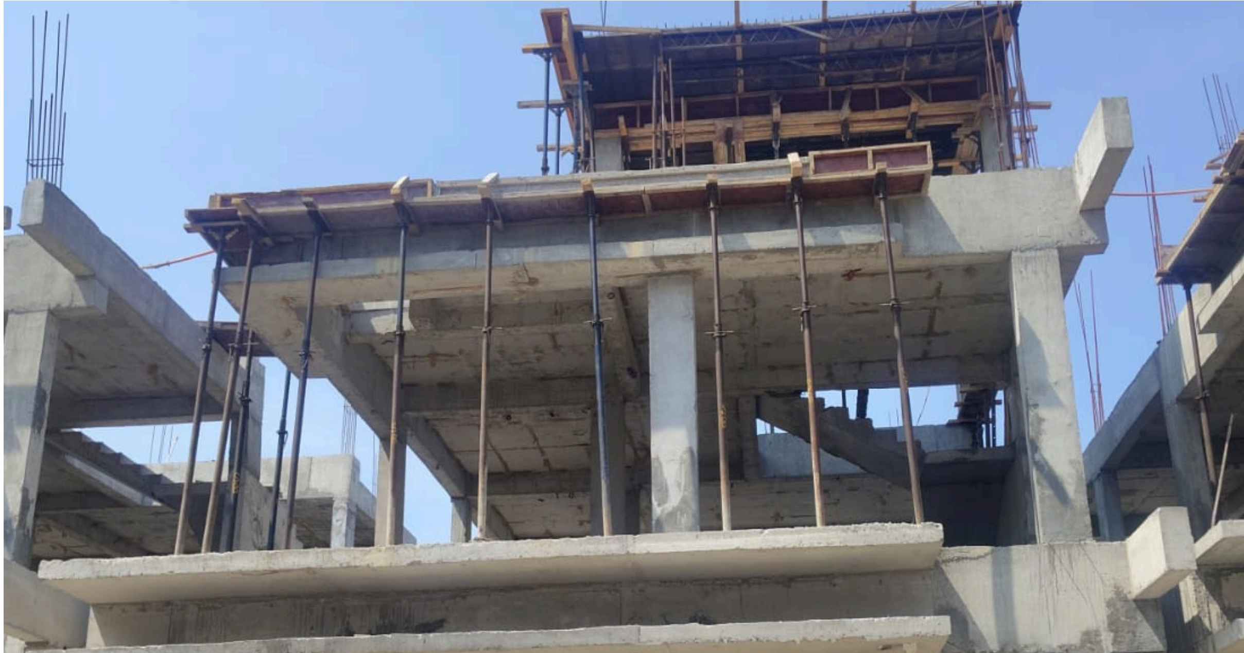
Villa No 67 –Head Room Roof Slab Concrete Pouring Completed