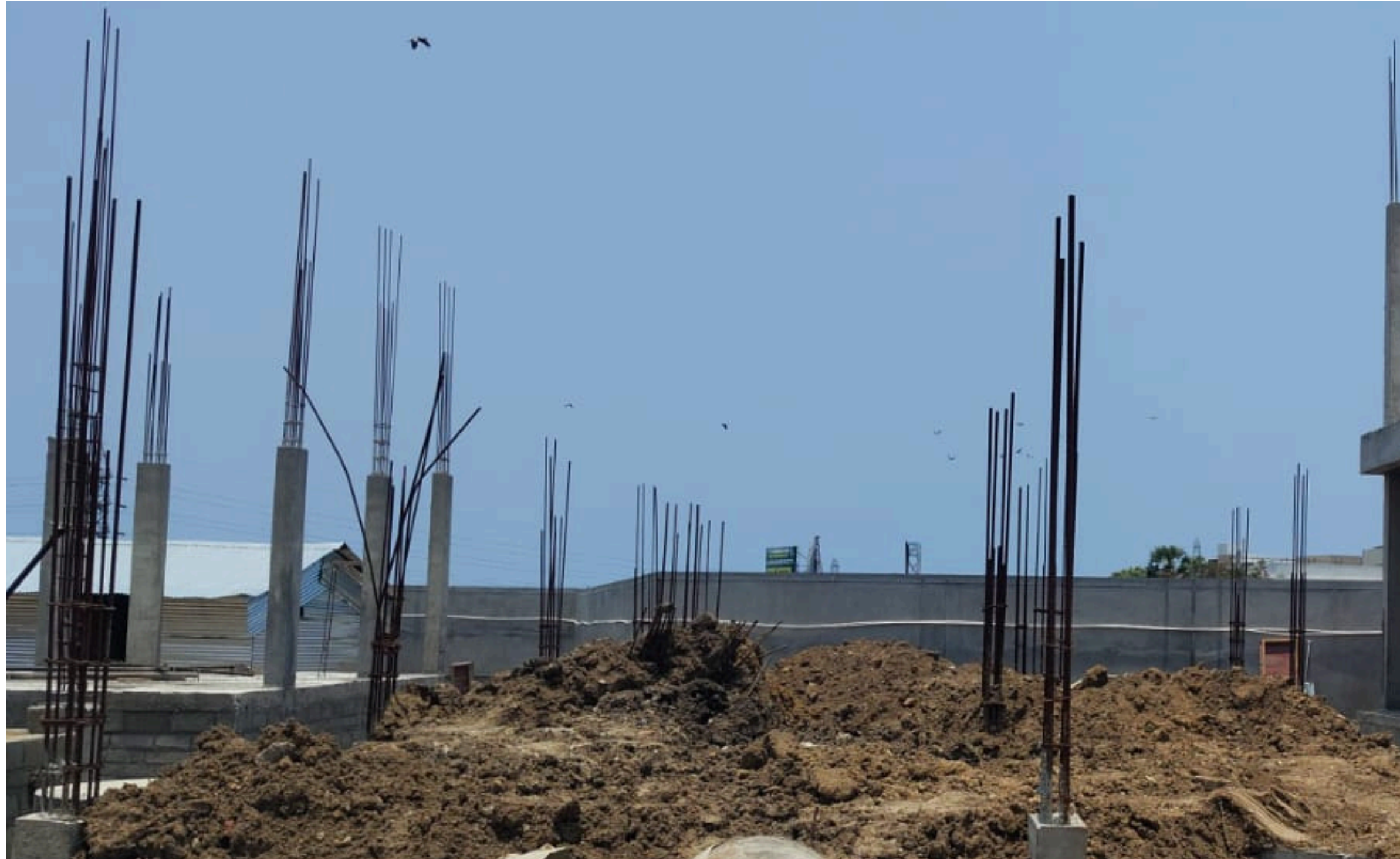
Villa No 107–Basement Back Filling Work In Progress