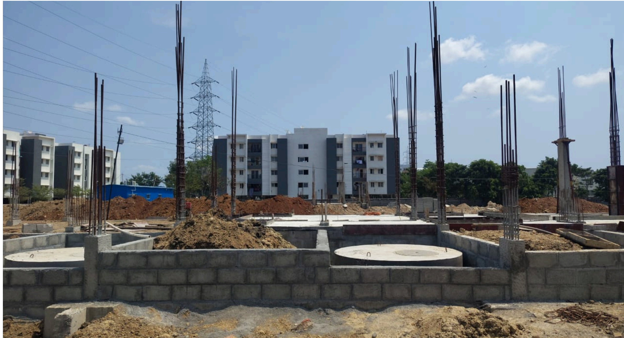
Villa No 87–Basement Backfilling Work In Progress