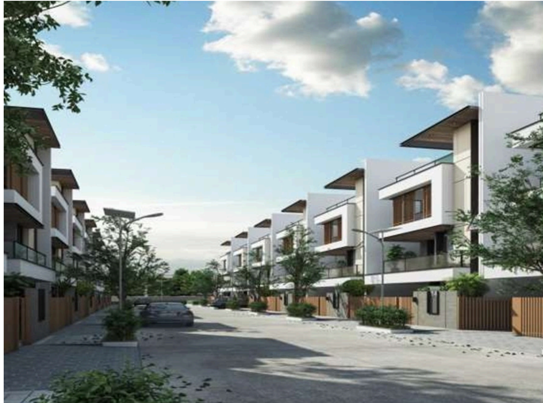
DRA INARA Monthly Progress Photos –April 2026