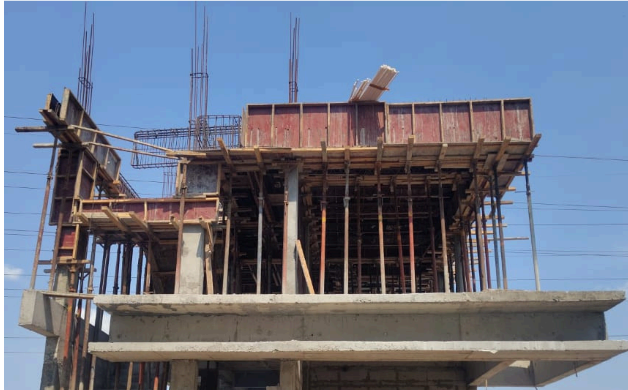
Villa No 46–FF Roof Slab Reinforcement Work Progress