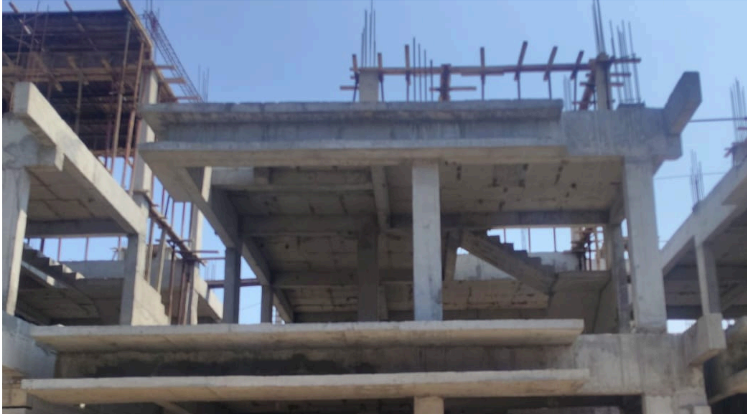
Villa No 59 –Head Room Roof Slab Shuttering Work In Progress