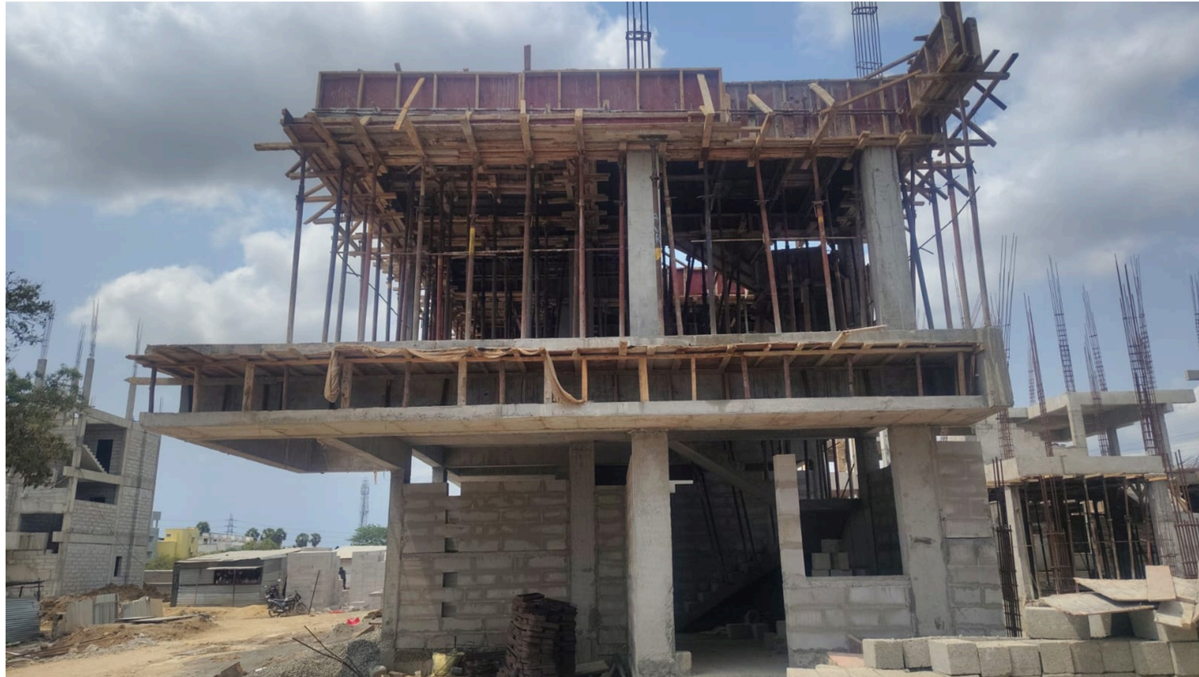
Villa No 33- FF Roof Slab Concrete Pouring work Completed