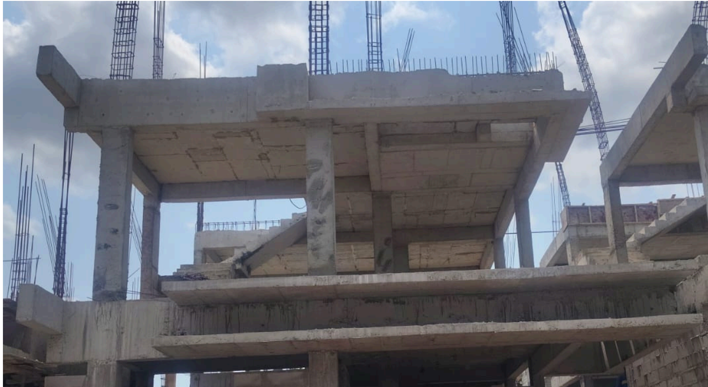
Villa No 37 –SF Column Reinforcement Work In Progress