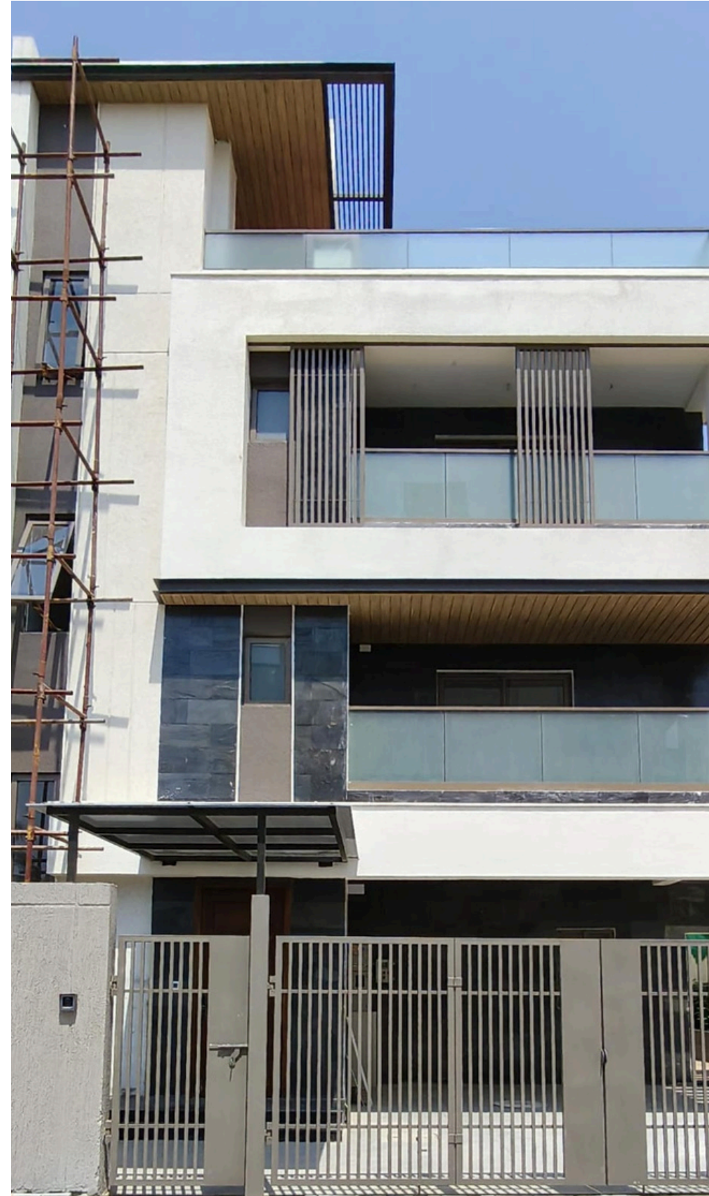
Villa No 17 –Front Elevation View