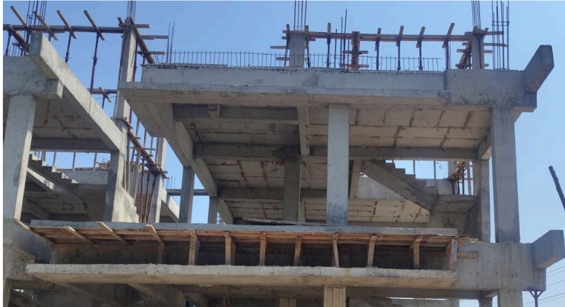
Villa No 61 –Head Room Roof Slab Shuttering Work In Progress