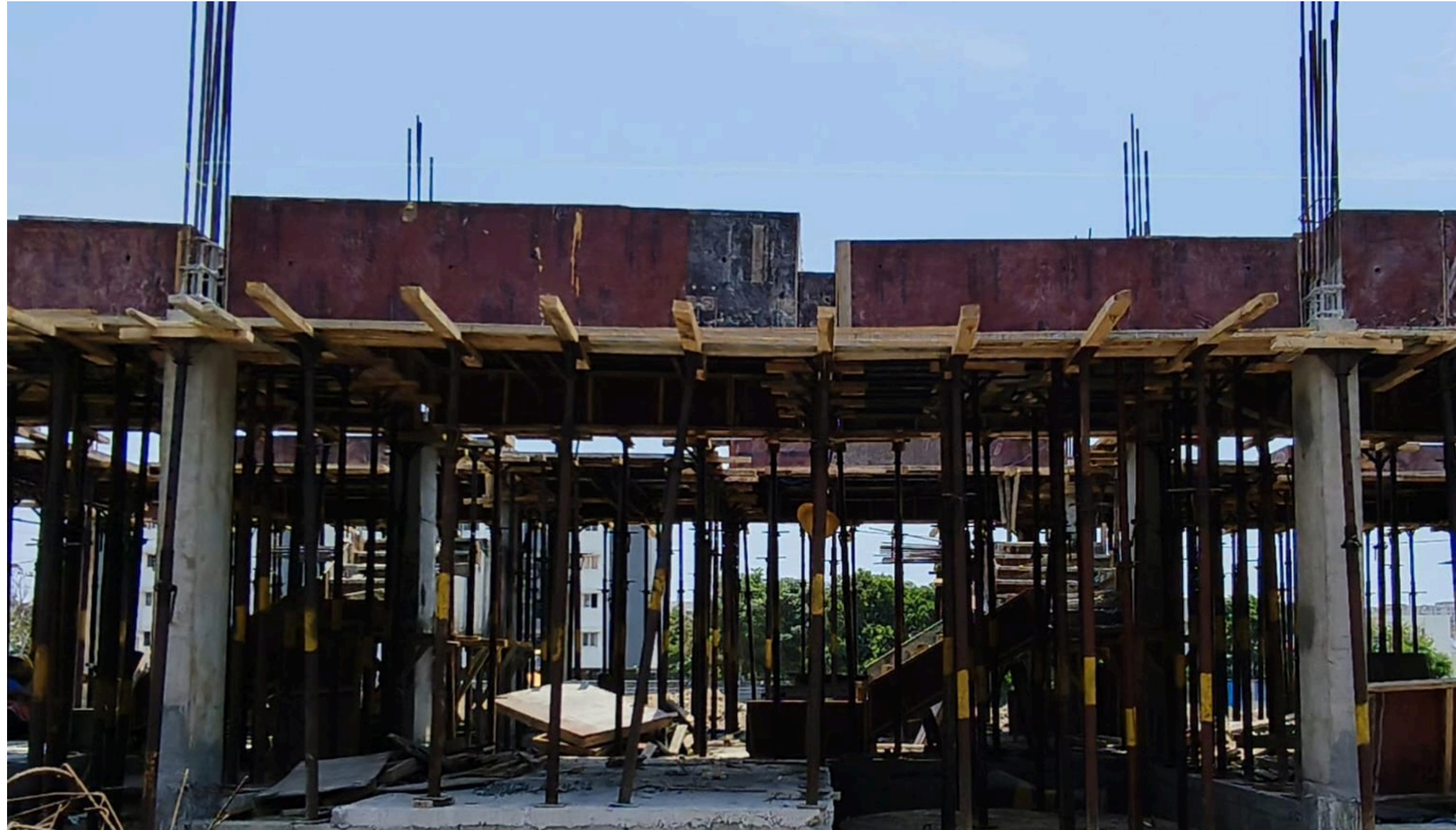
Villa No 92–GF Roof Slab Shuttering Work In Progress