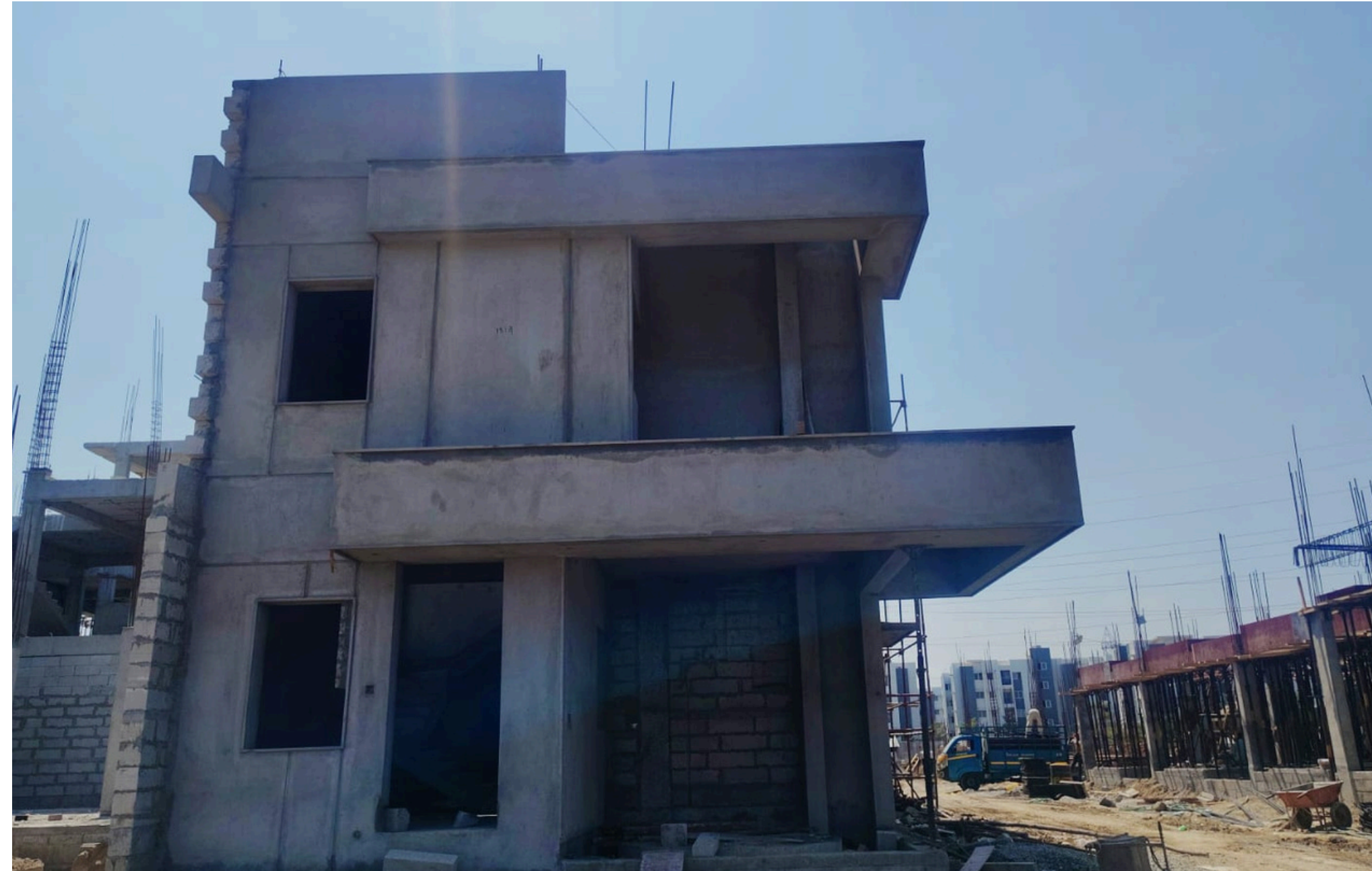
Villa No 73 –External Plastering Work In Progress