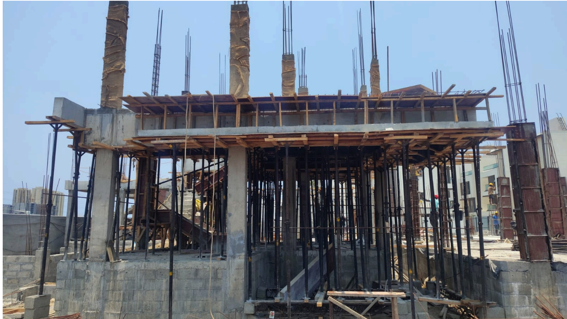
Villa No 114-FF Column Concrete Pouring Work Completed