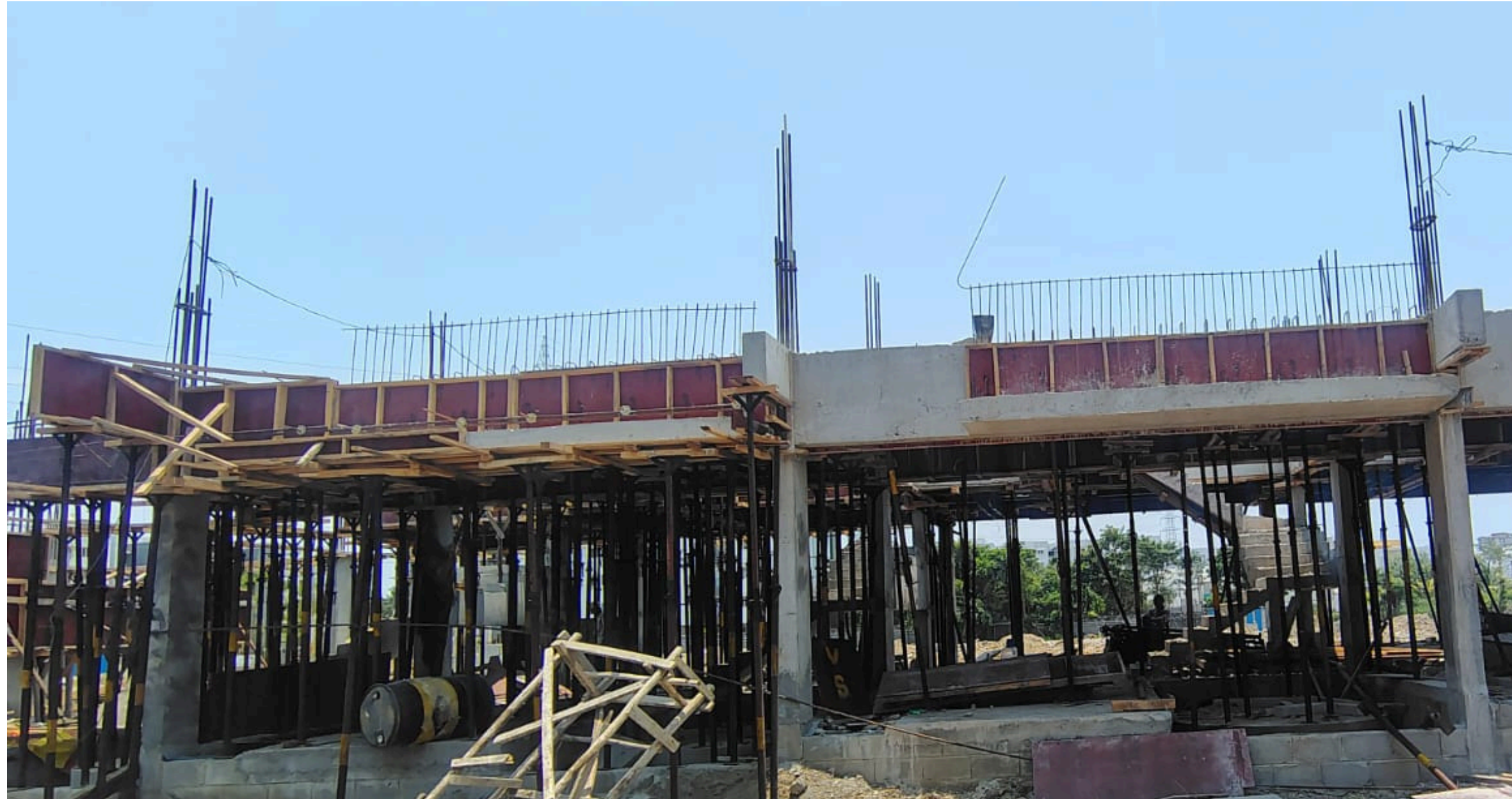
Villa No 94 to 96–GF Roof Slab Concrete Pouring Work Completed