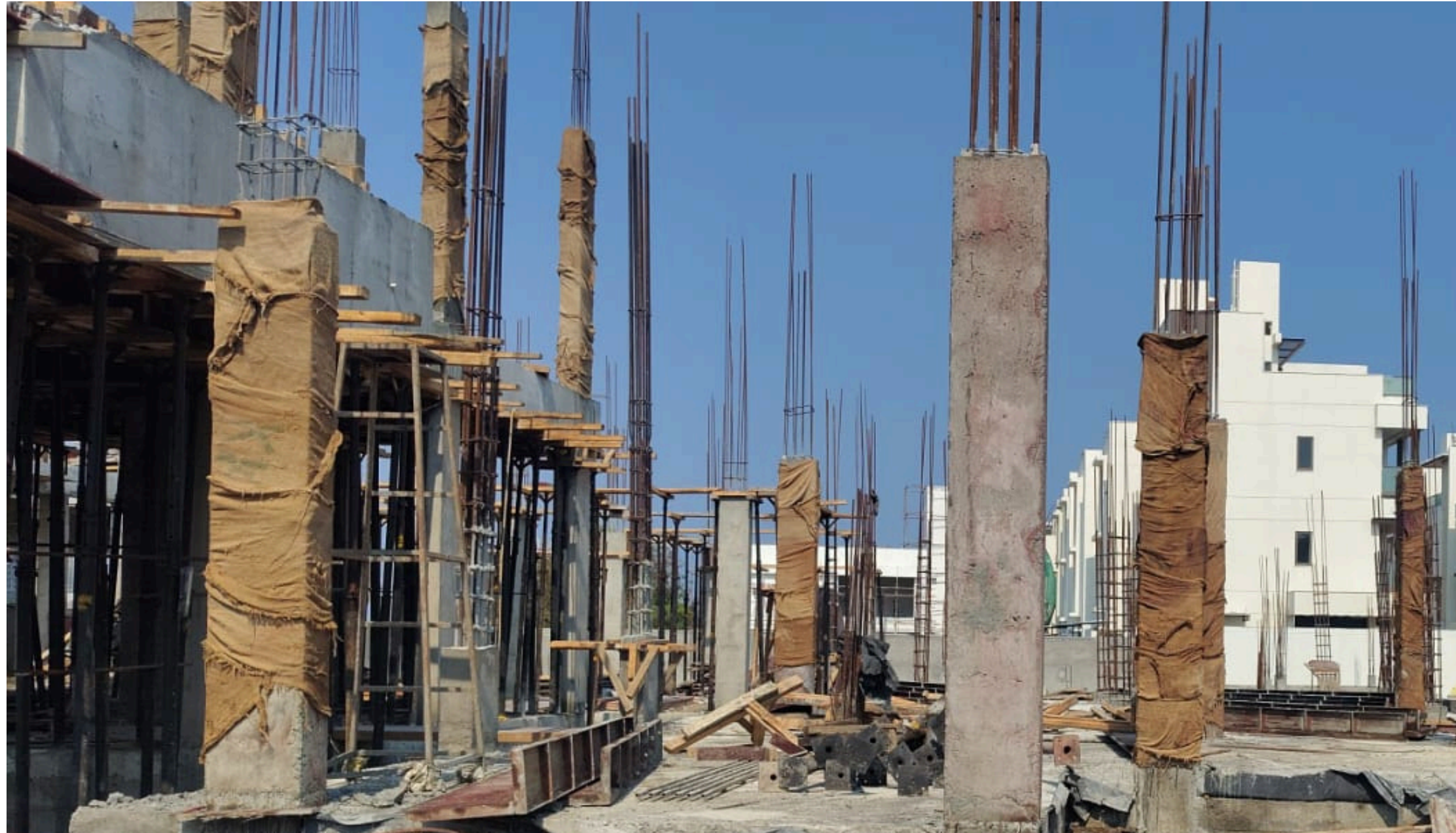
Villa No 115–GF Column Concrete Pouring Work Completed