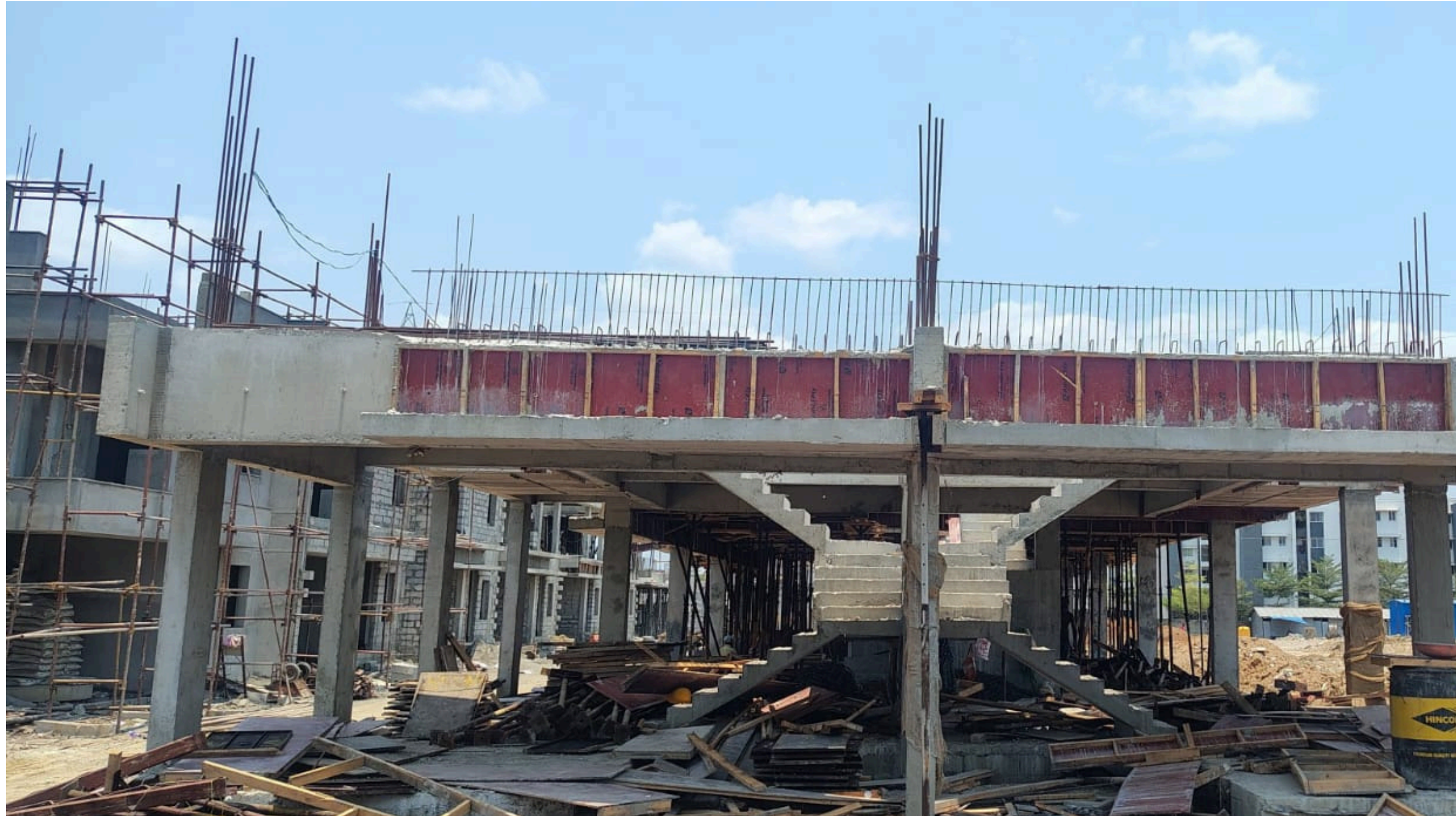
Villa No 97 to 98 –GF Roof Slab Concrete Pouring Work Completed