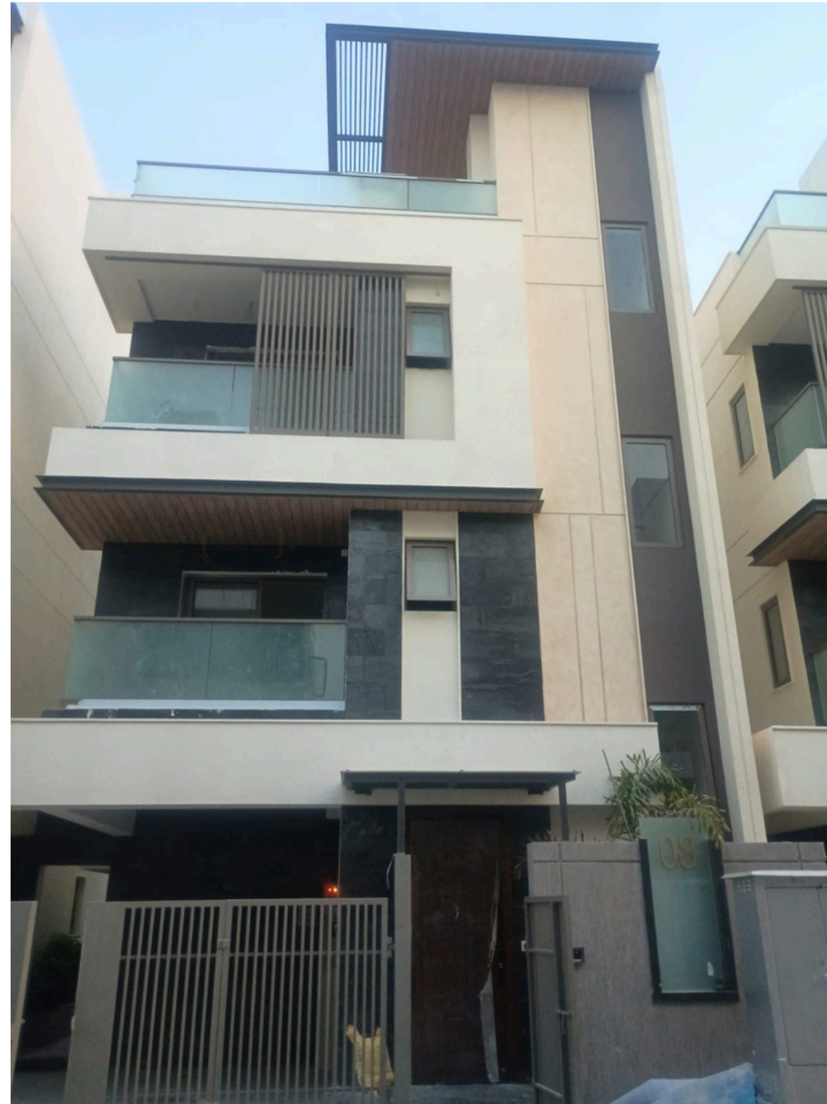
Villa No – 8 Front Elevation View