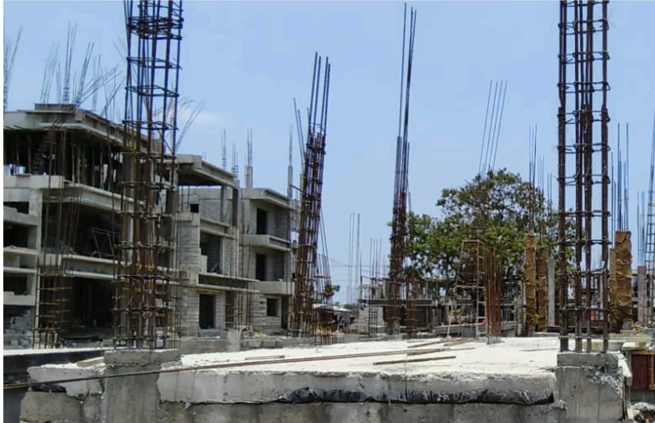
Villa No 118– GF Column Reinforcement Work Completed