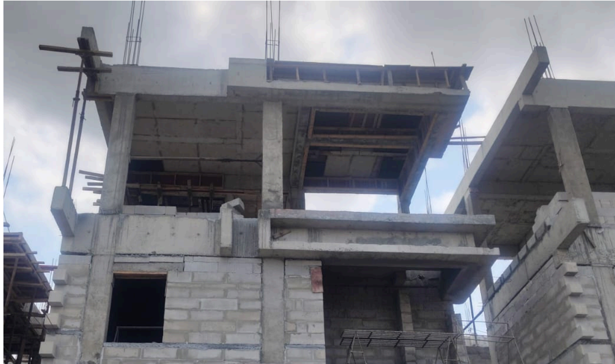
Villa No 44 –FF Block Work Completed