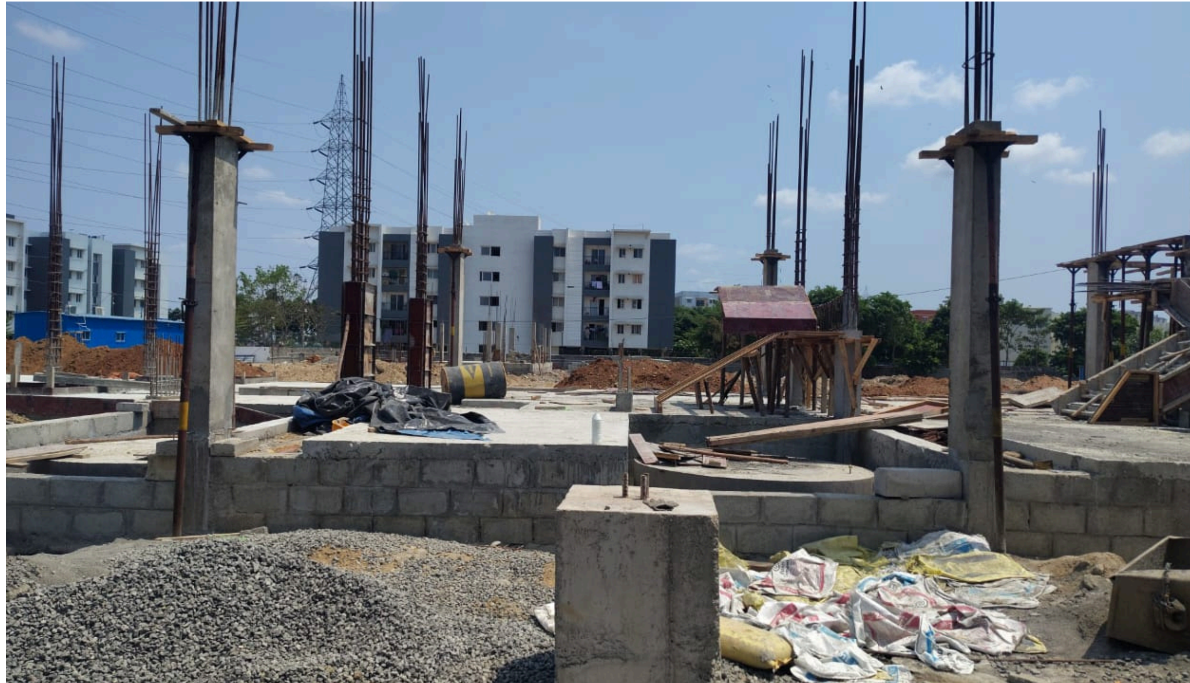
Villa No 89–GF Staircase Shuttering Work In Progress