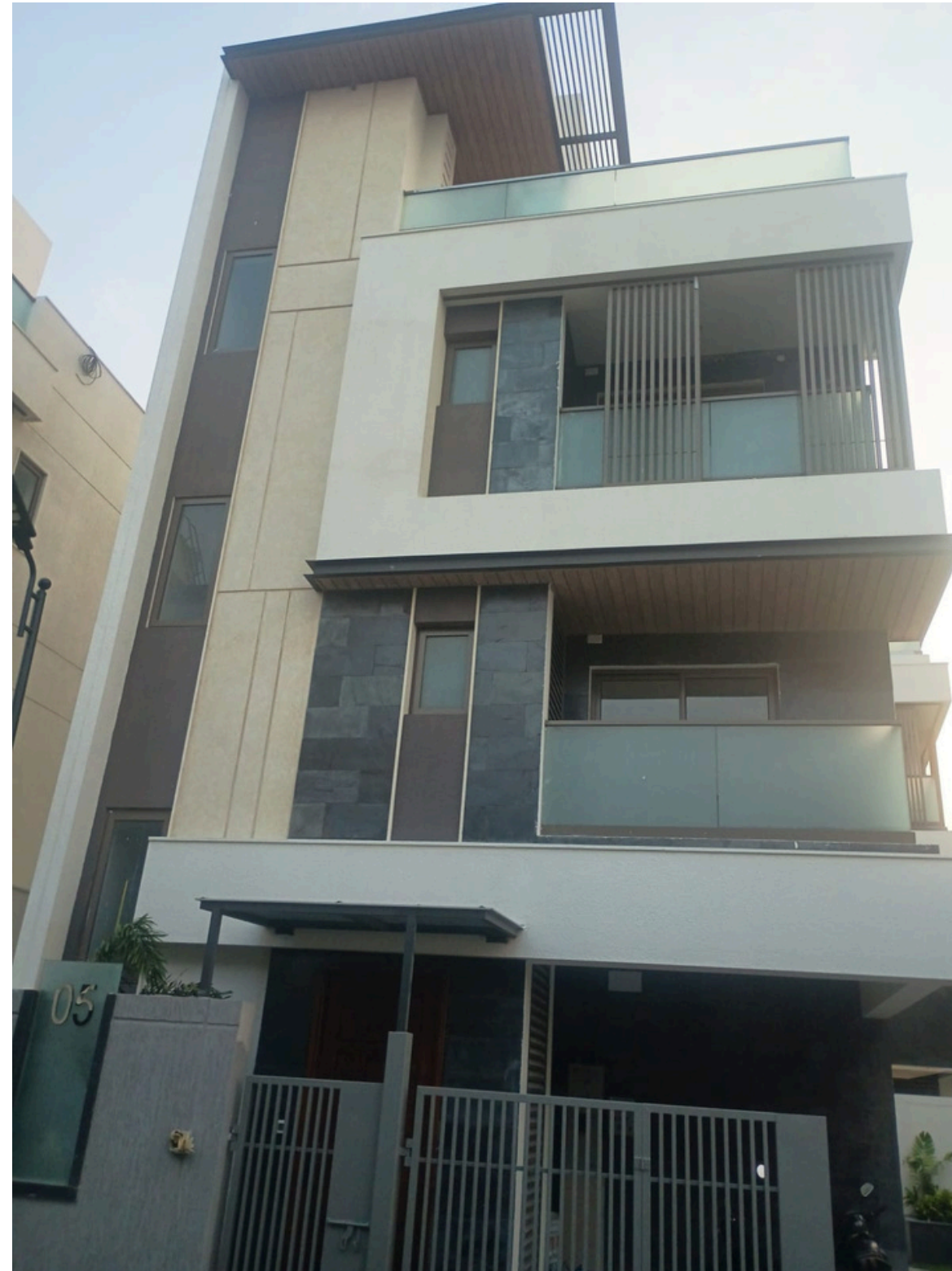
Villa No 5 –Front Elevation View