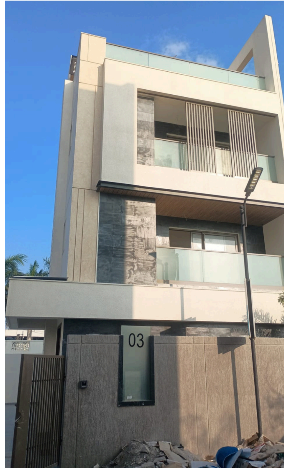
Villa No 3 –Front Elevation View