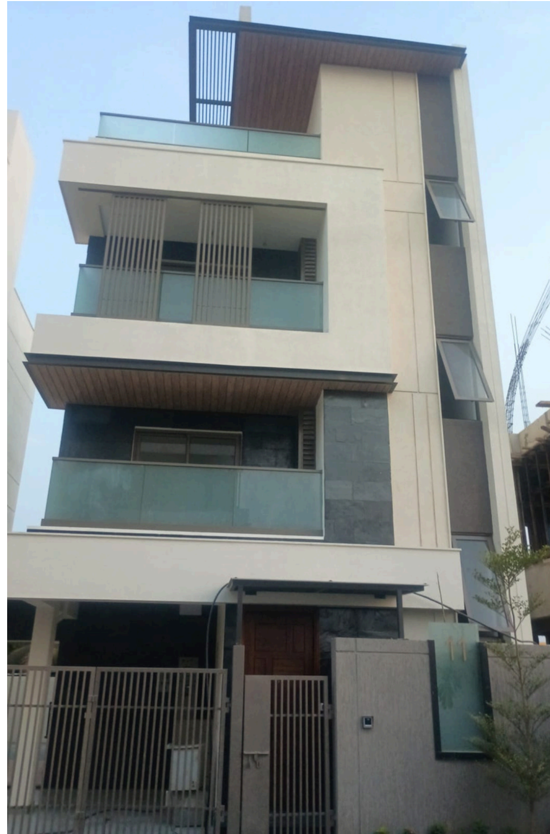
Villa No 11- Front Elevation View