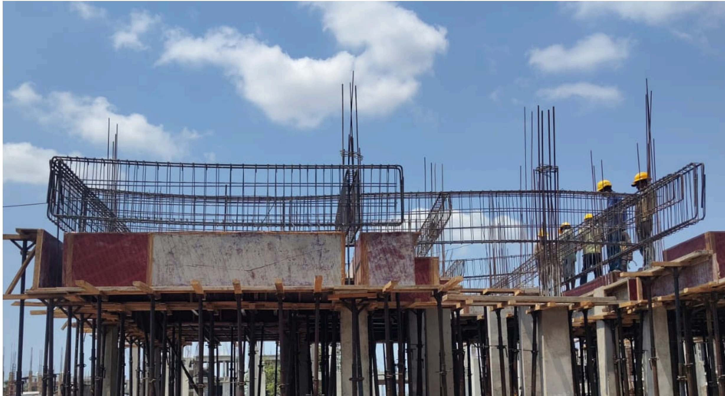
Villa No 104–GF Roof Slab Reinforcement Work In Progress