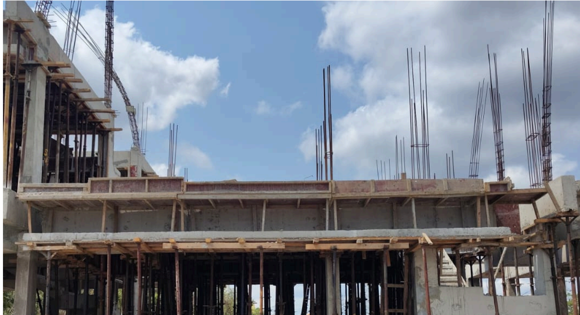
Villa No 23 –FF Column Reinforcement work In Progress