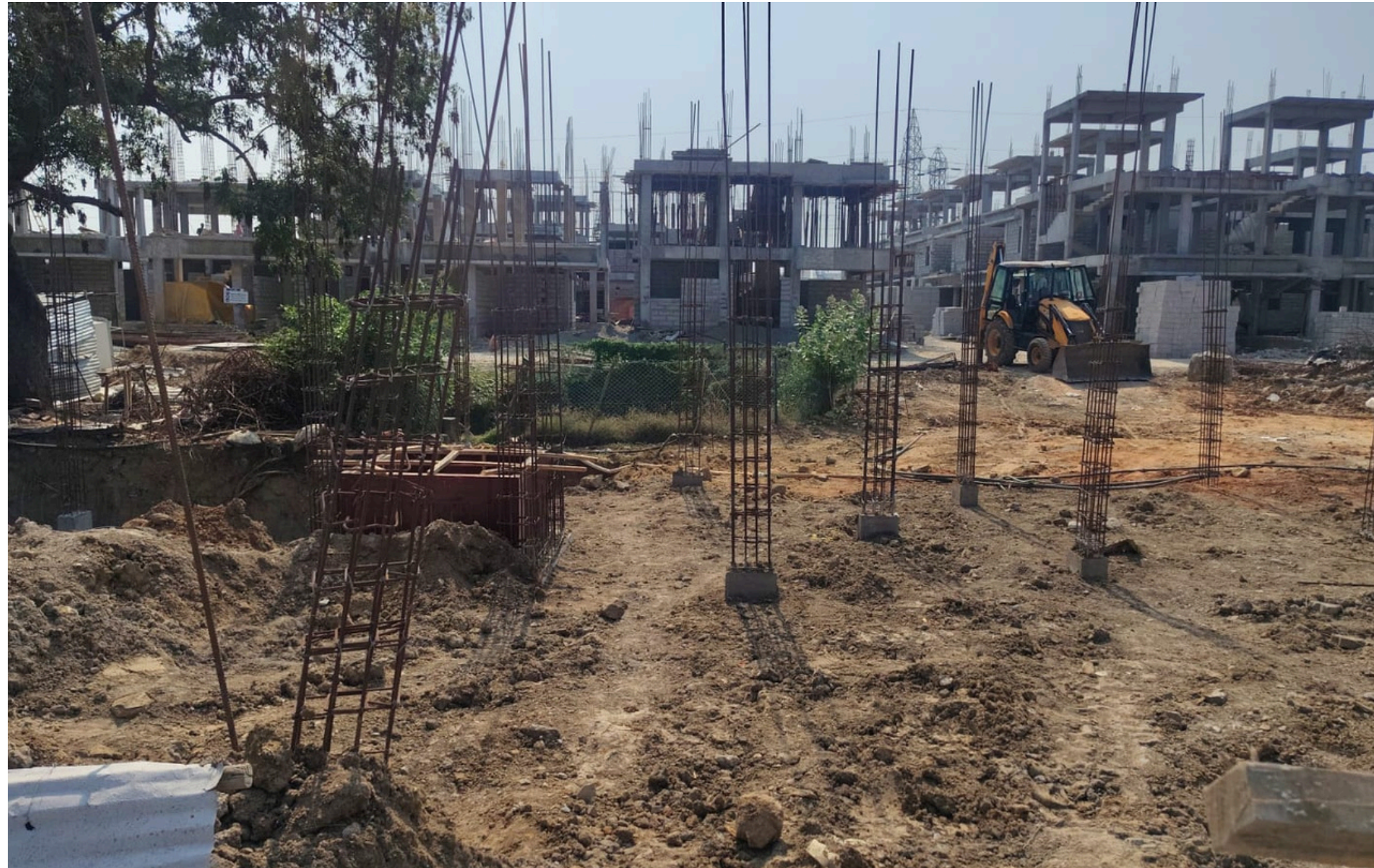
Villa No 110–Plinth Beam PCC Dressing Work In Progress