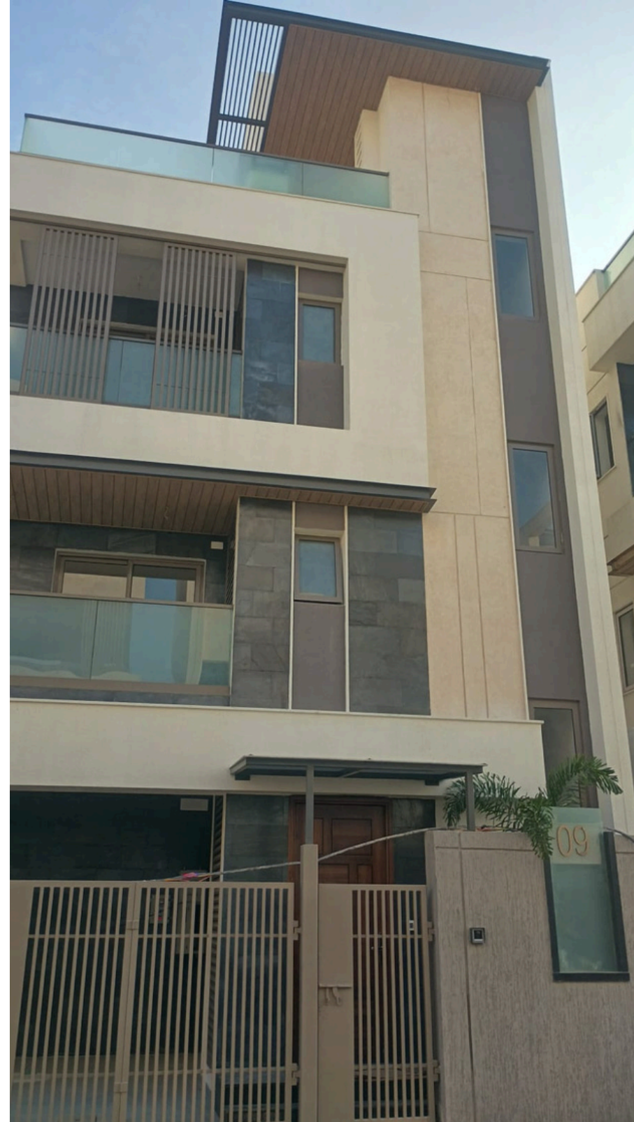
Villa No 9 - Front Elevation View