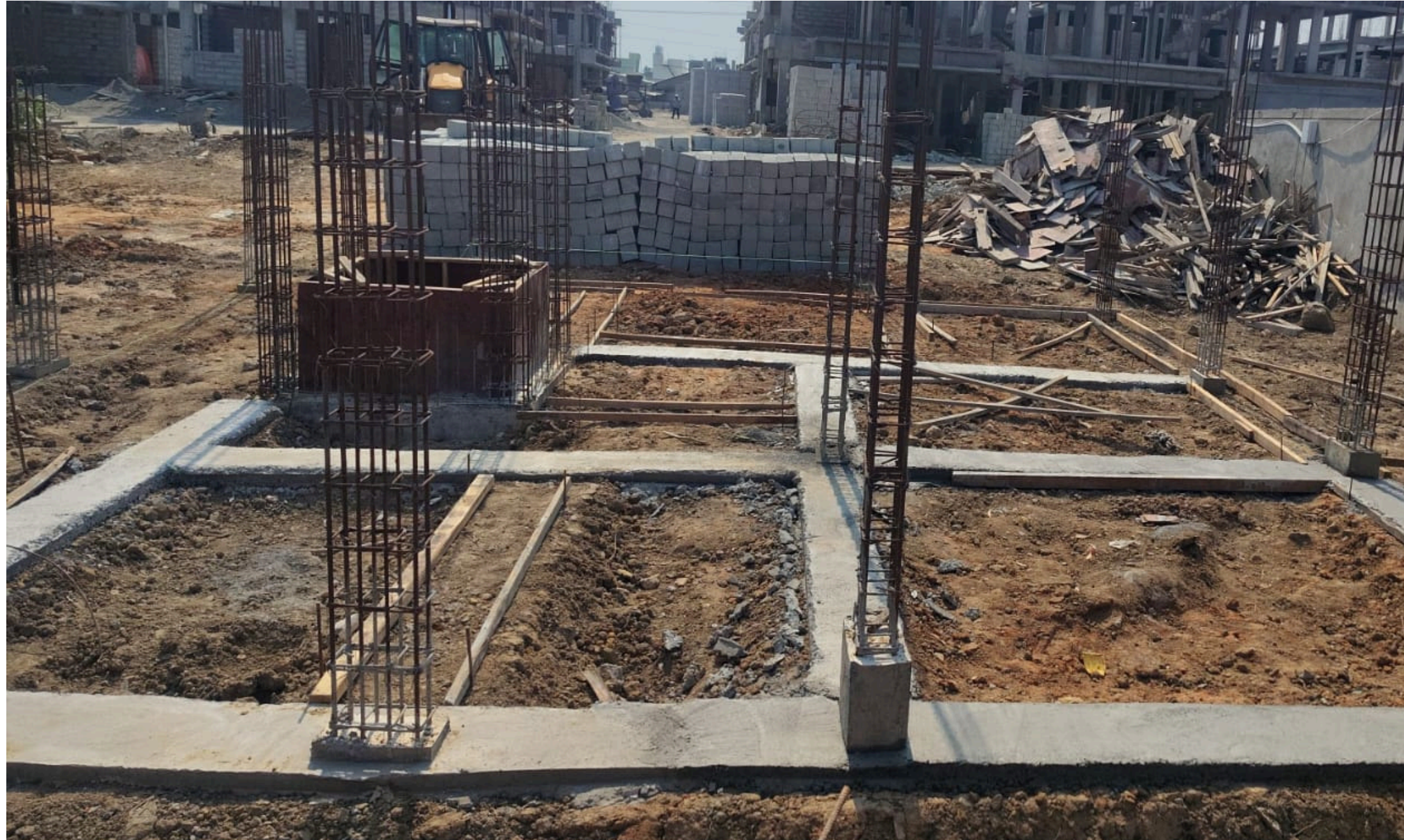
Villa No 112–Plinth Beam PCC Pouring Work In Progress