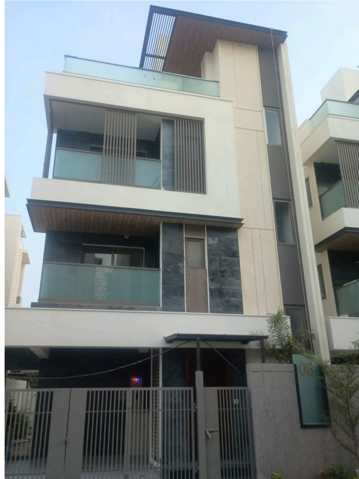
Villa No 6 –Front Elevation View