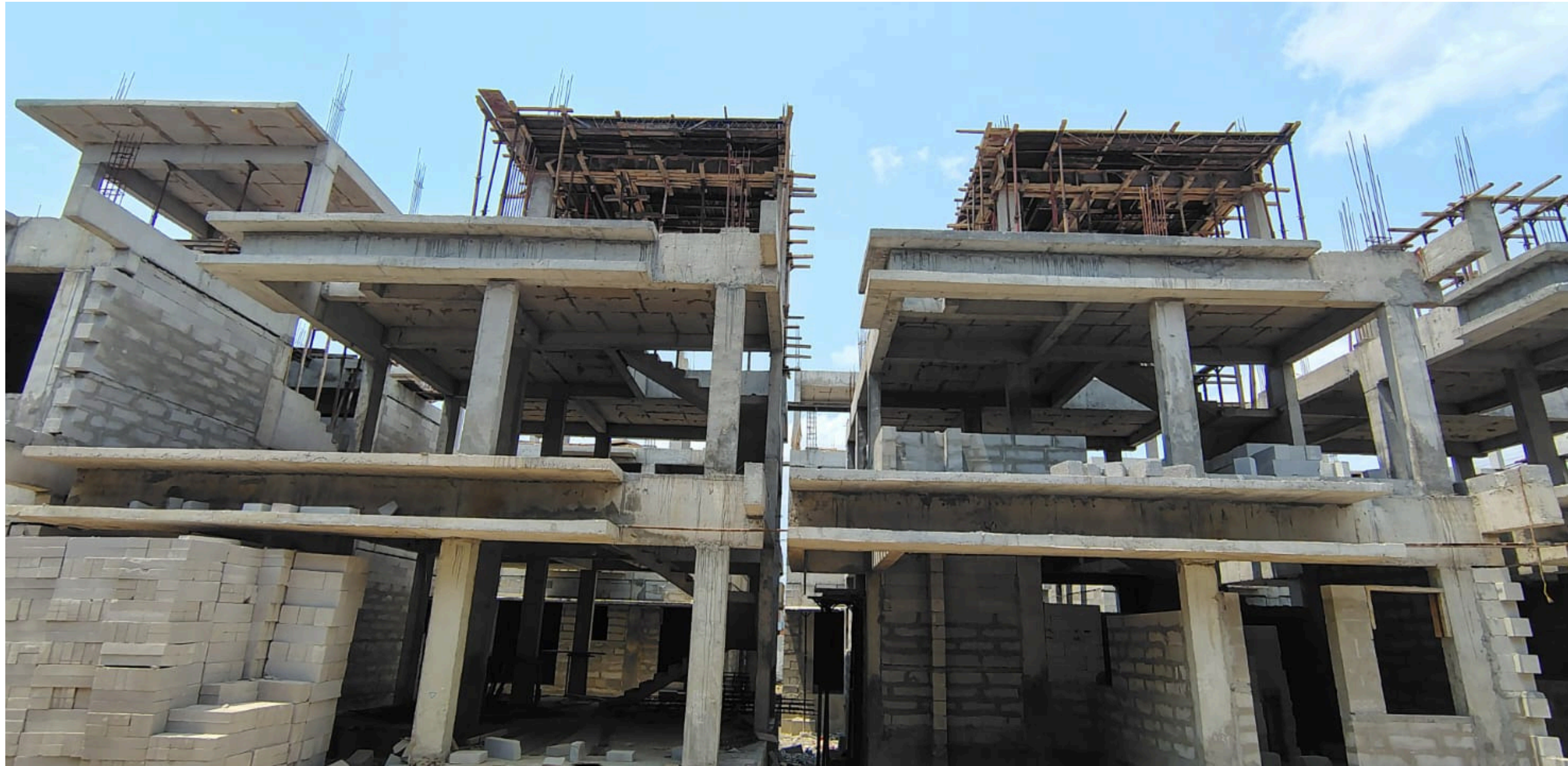
Villa No 57&58- Head Room Roof Slab Concrete Pouring Completed