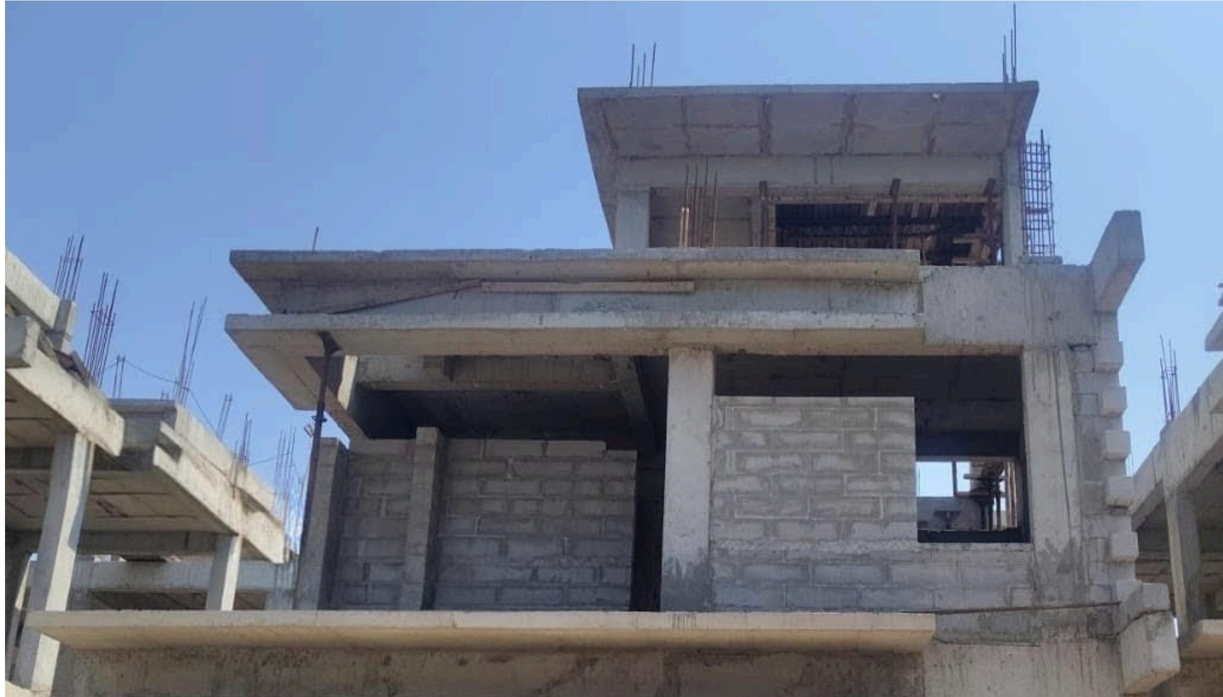
Villa No 56 – FF Block Work In Progress