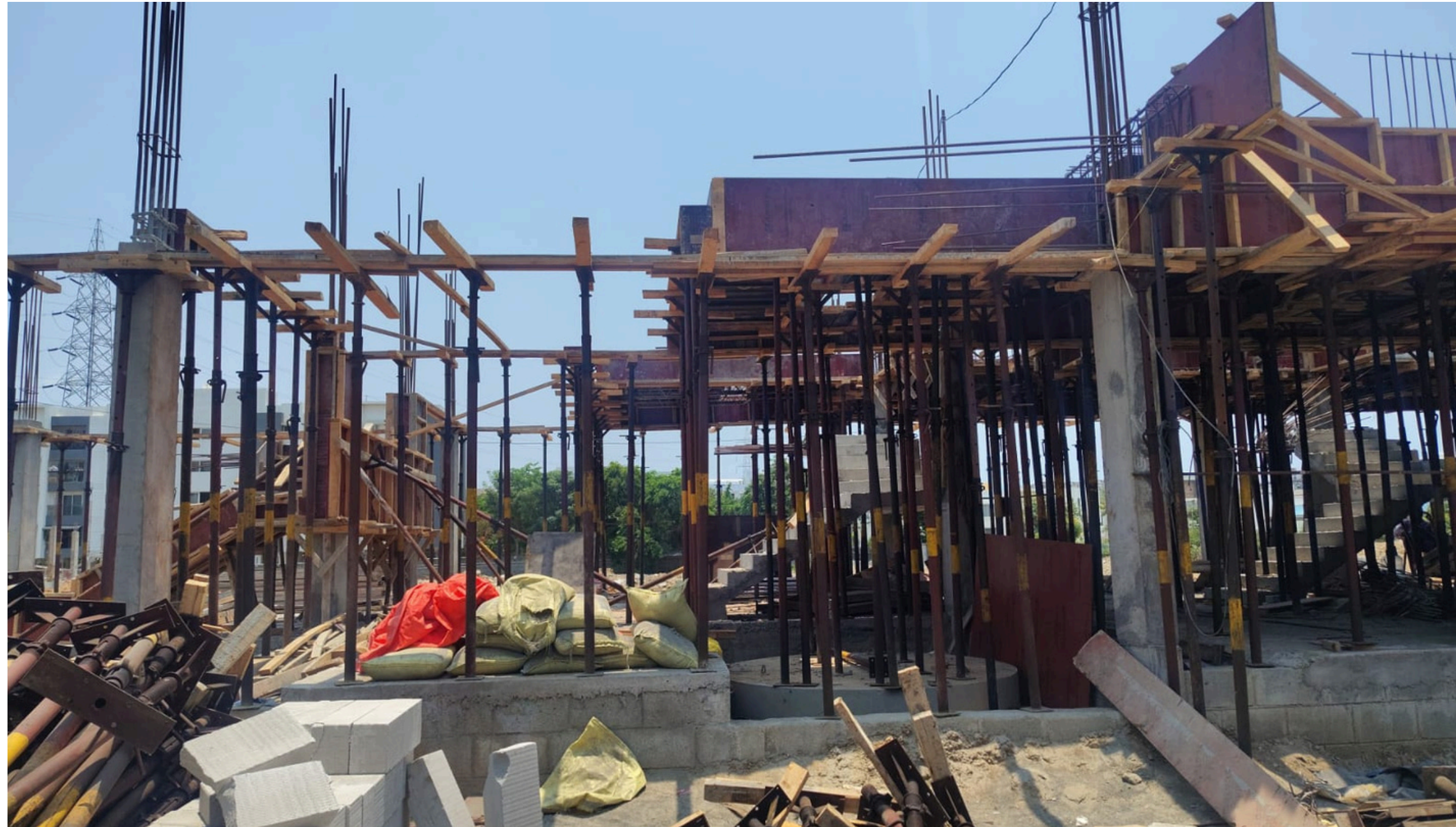
Villa No 93–GF Roof Slab Shuttering Work In Progress