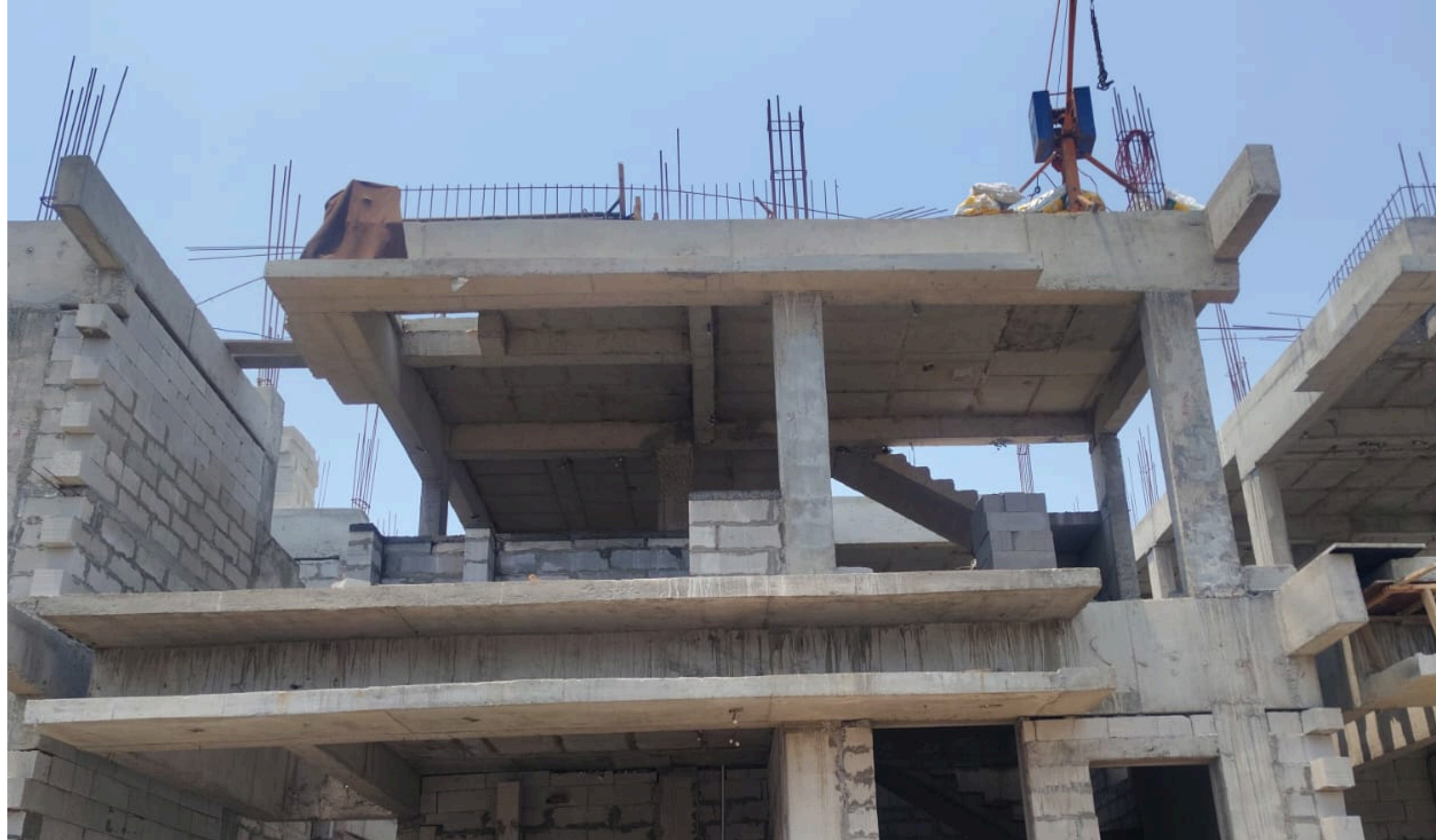
Villa No 77 –FF Block Work In Progress