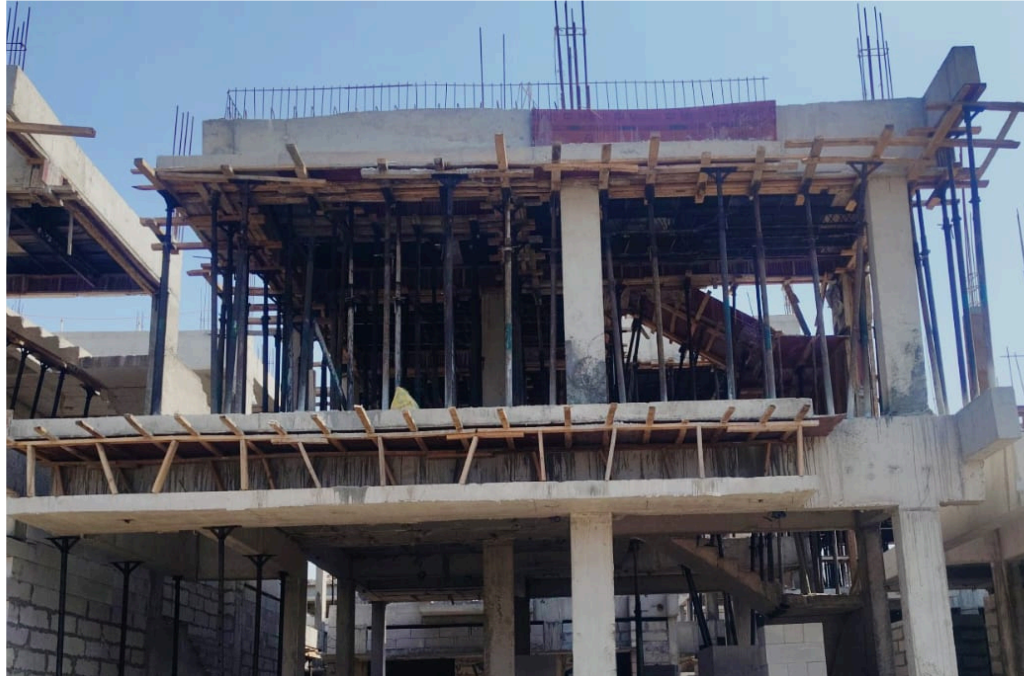
Villa No 78–FF Roof Slab concrete Pouring completed