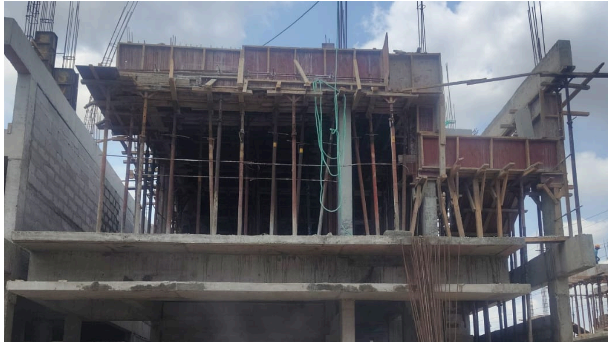
Villa No 43 –FF Roof Slab Concrete work Completed