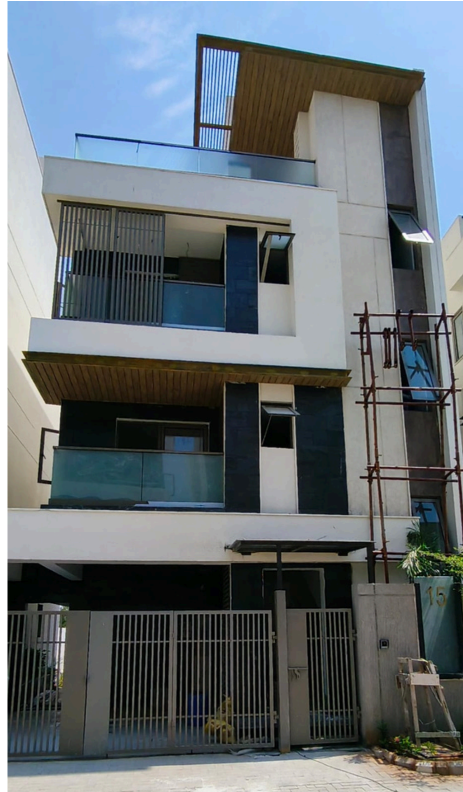
Villa No 15 –Front Elevation View