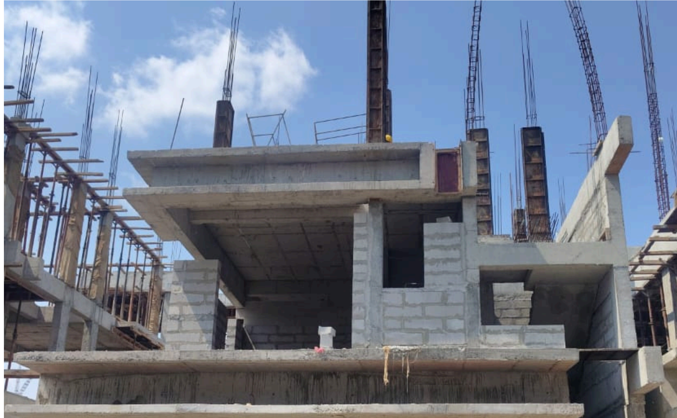
Villa No 42 –SF Roof Slab Column Concrete Pouring Completed