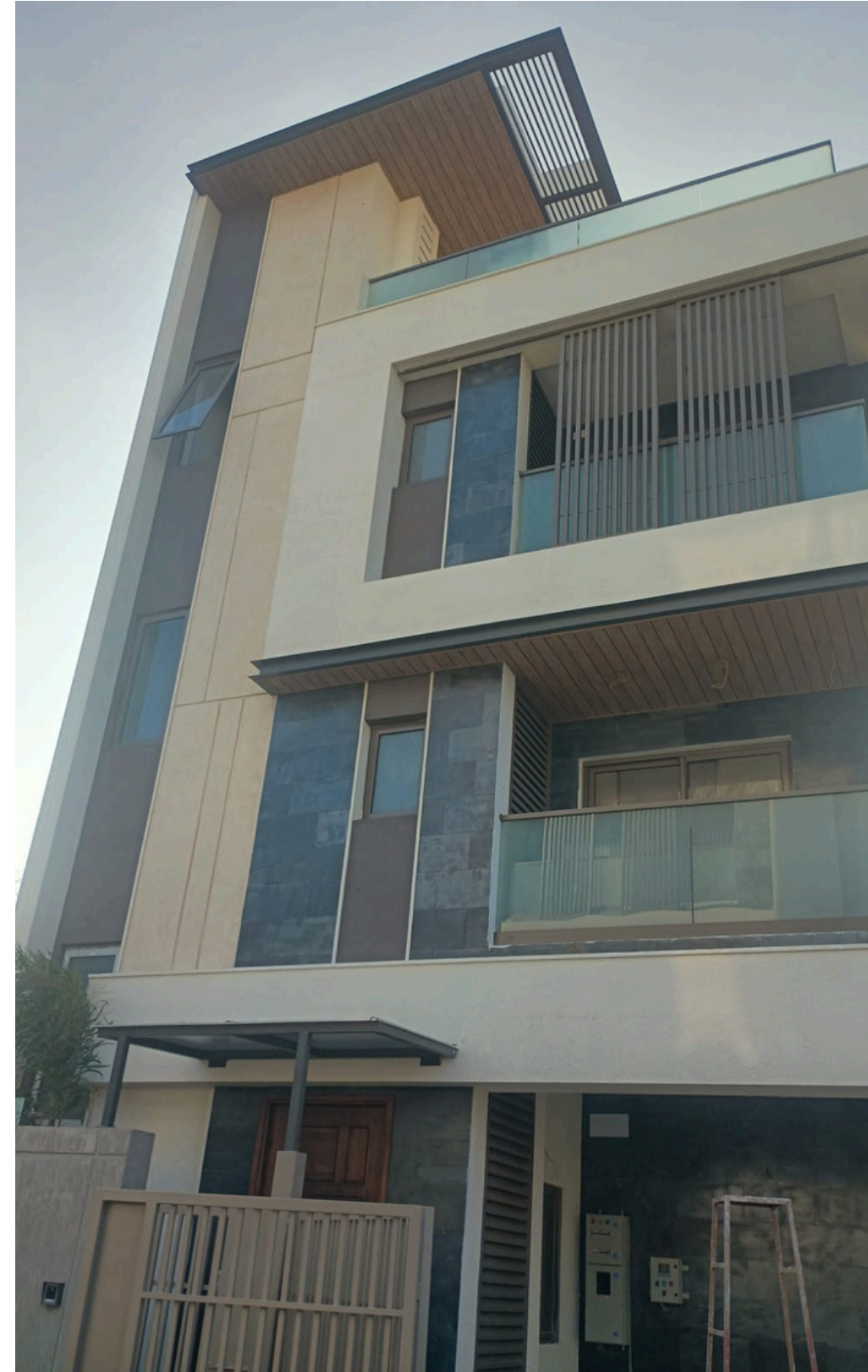
Villa No 4 –Front Elevation View