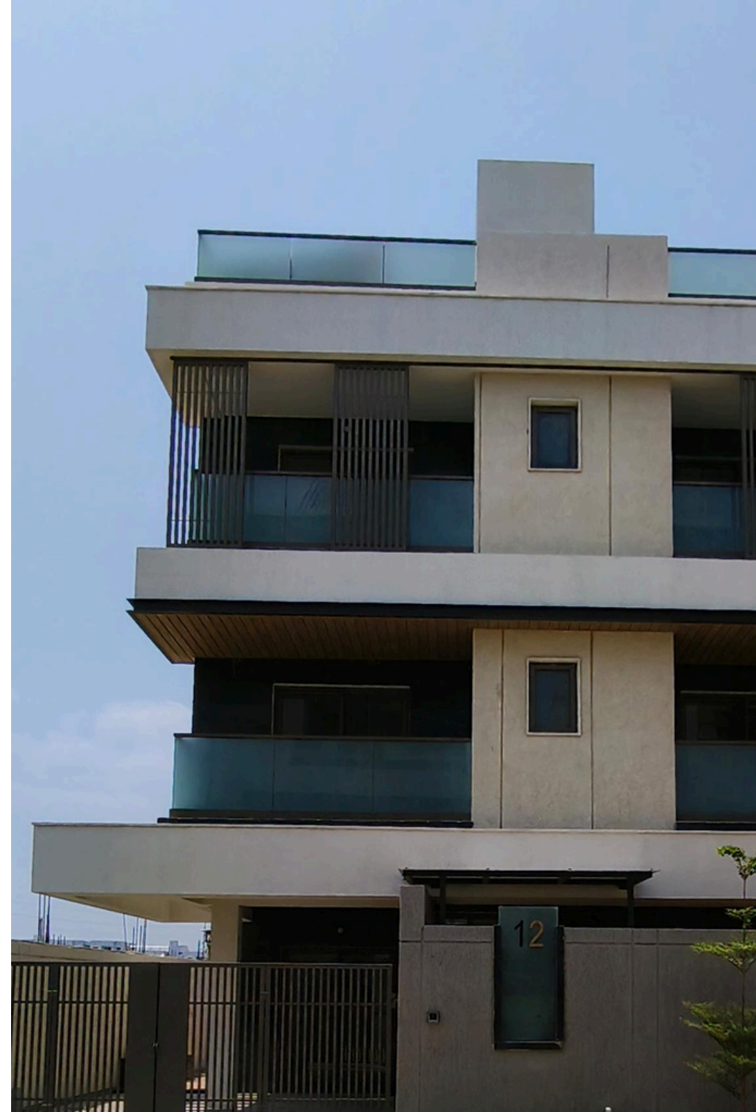
Villa No 12 –Front Elevation View