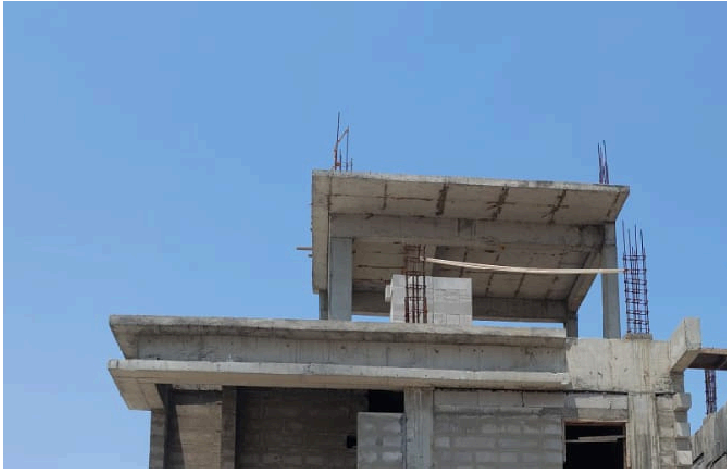
Villa No 47 –Head Room Slab Concrete Pouring Completed