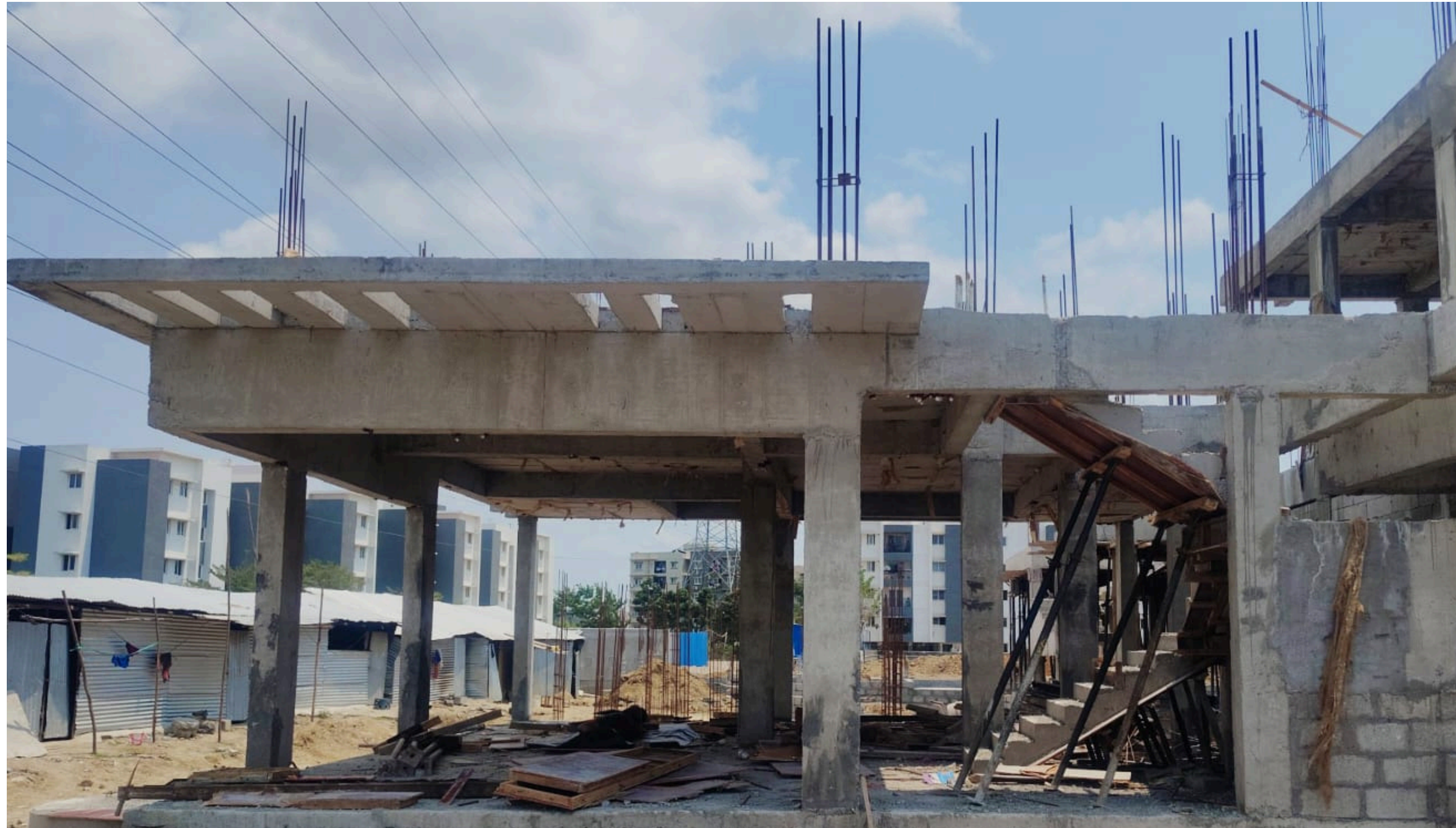
Villa No 62–GF Roof Slab Concrete Pouring Work Completed