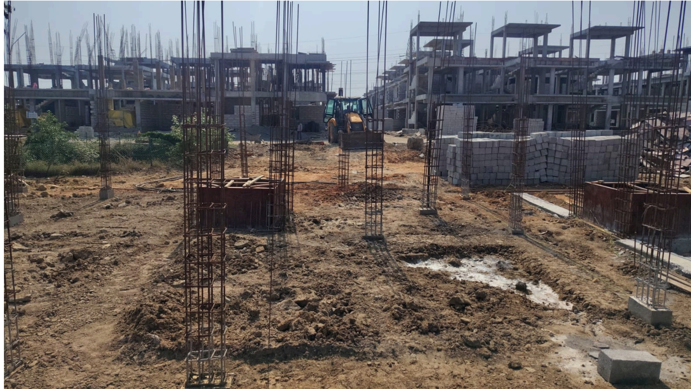
Villa No 111–Plinth Beam PCC Dressing Work In Progress