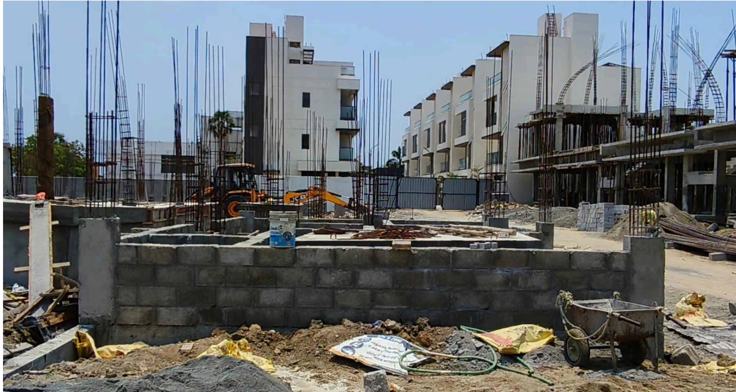
Villa No 116– Basement Block Work Completed