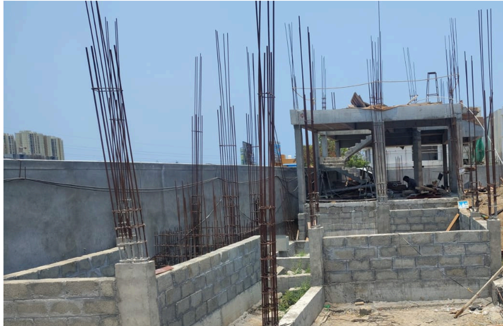
Villa No 113–Basement Block Work Completed