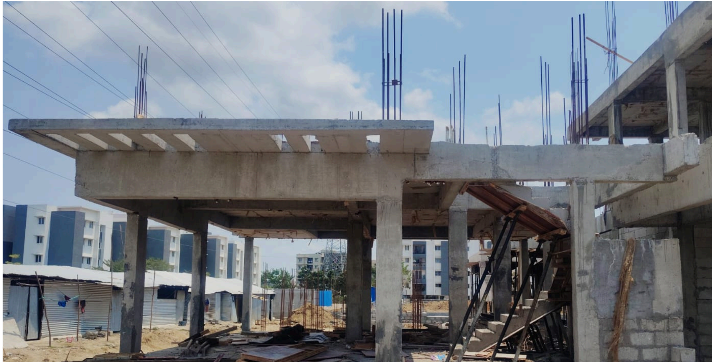
Villa No 62-GF Roof Slab Concrete Pouring Completed