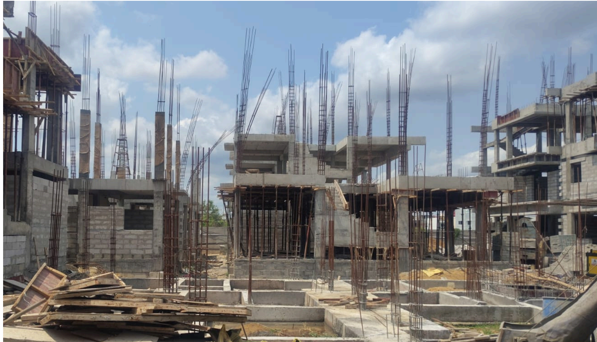
Villa No 34 – Plinth Beam Concrete Pouring work Completed