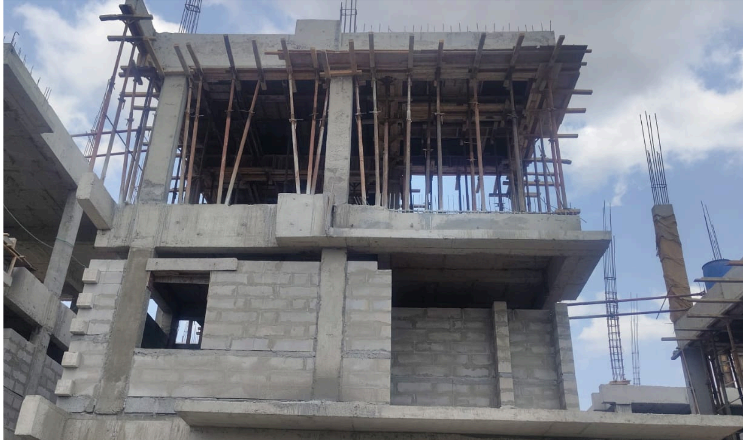
Villa No 40–FF Block Work In Progress