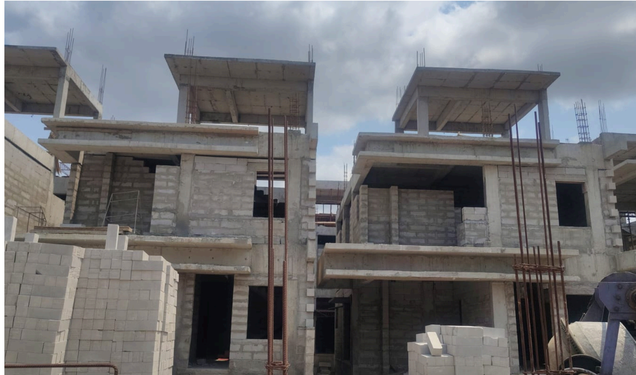
Villa No -51&52 FF Block Work In Progress