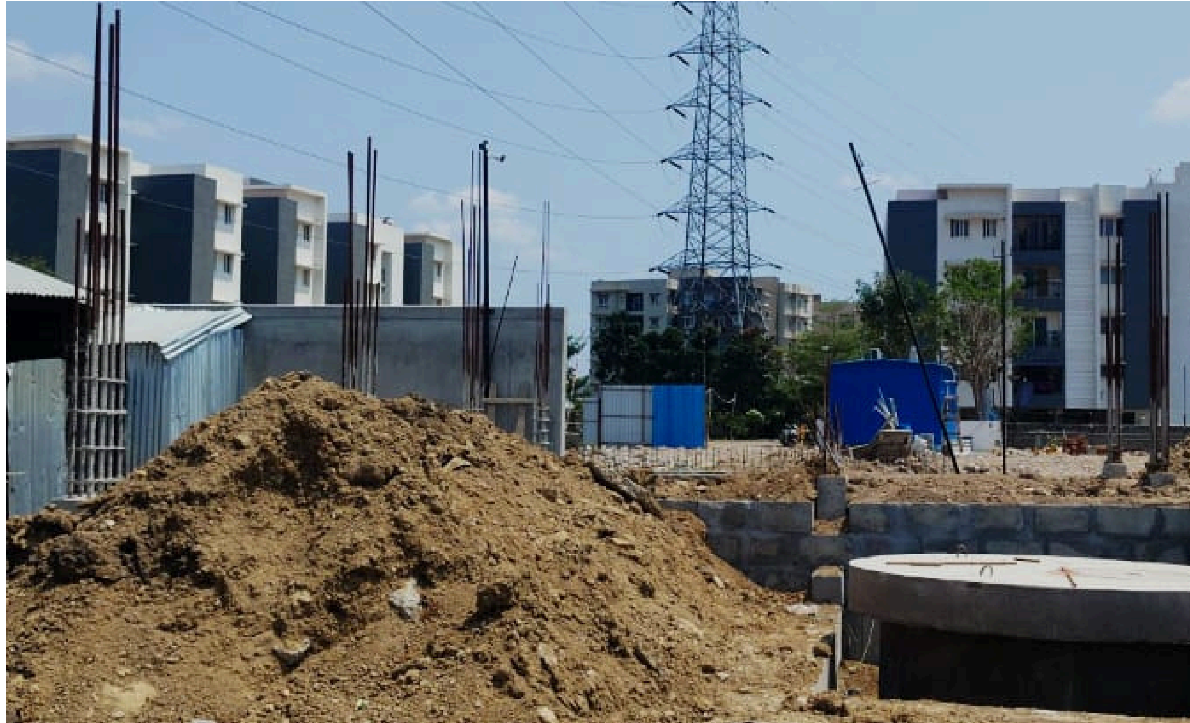
Villa No 83 –Basement Back Filling Work In Progress