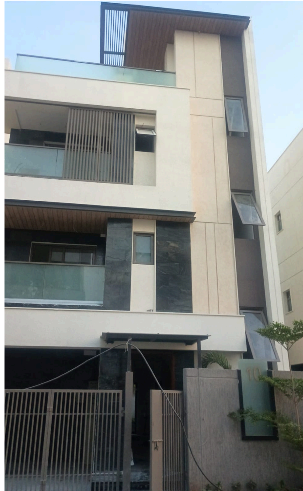
Villa No 10 – Front Elevation View