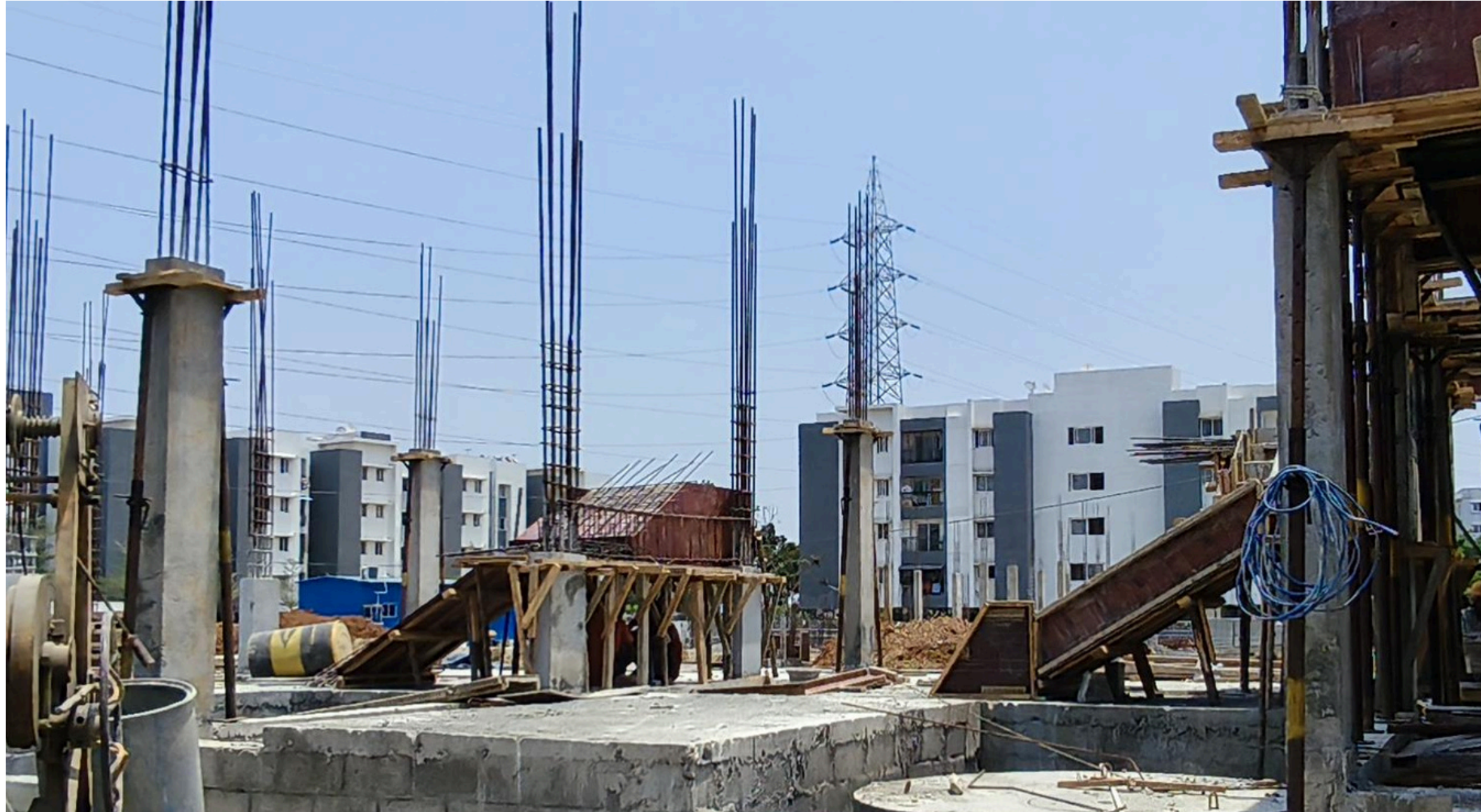
Villa No 90 –GF Staircase Reinforcement Work In Progress