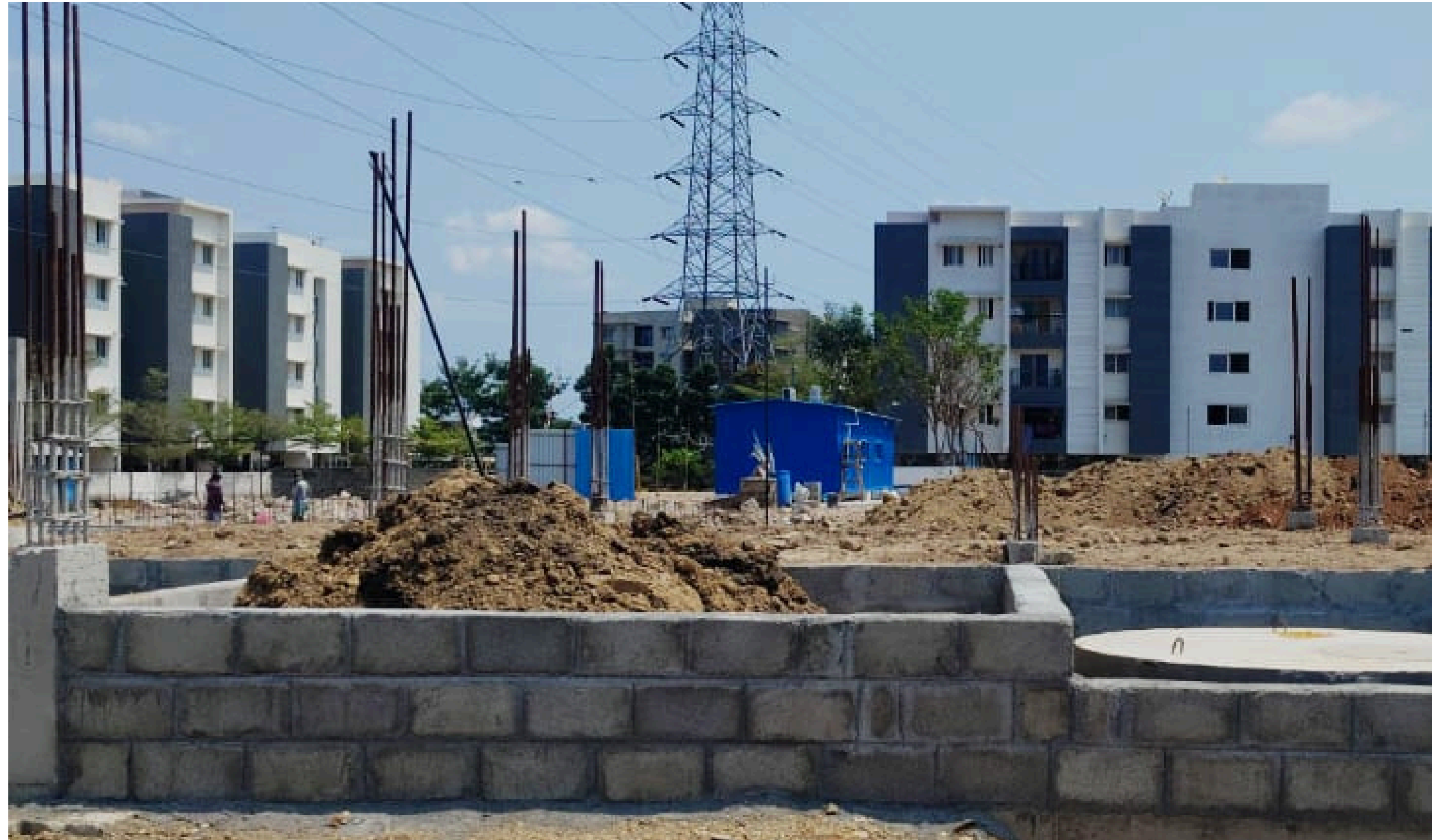
Villa No 84 –Basement Back Filling Work In Progress