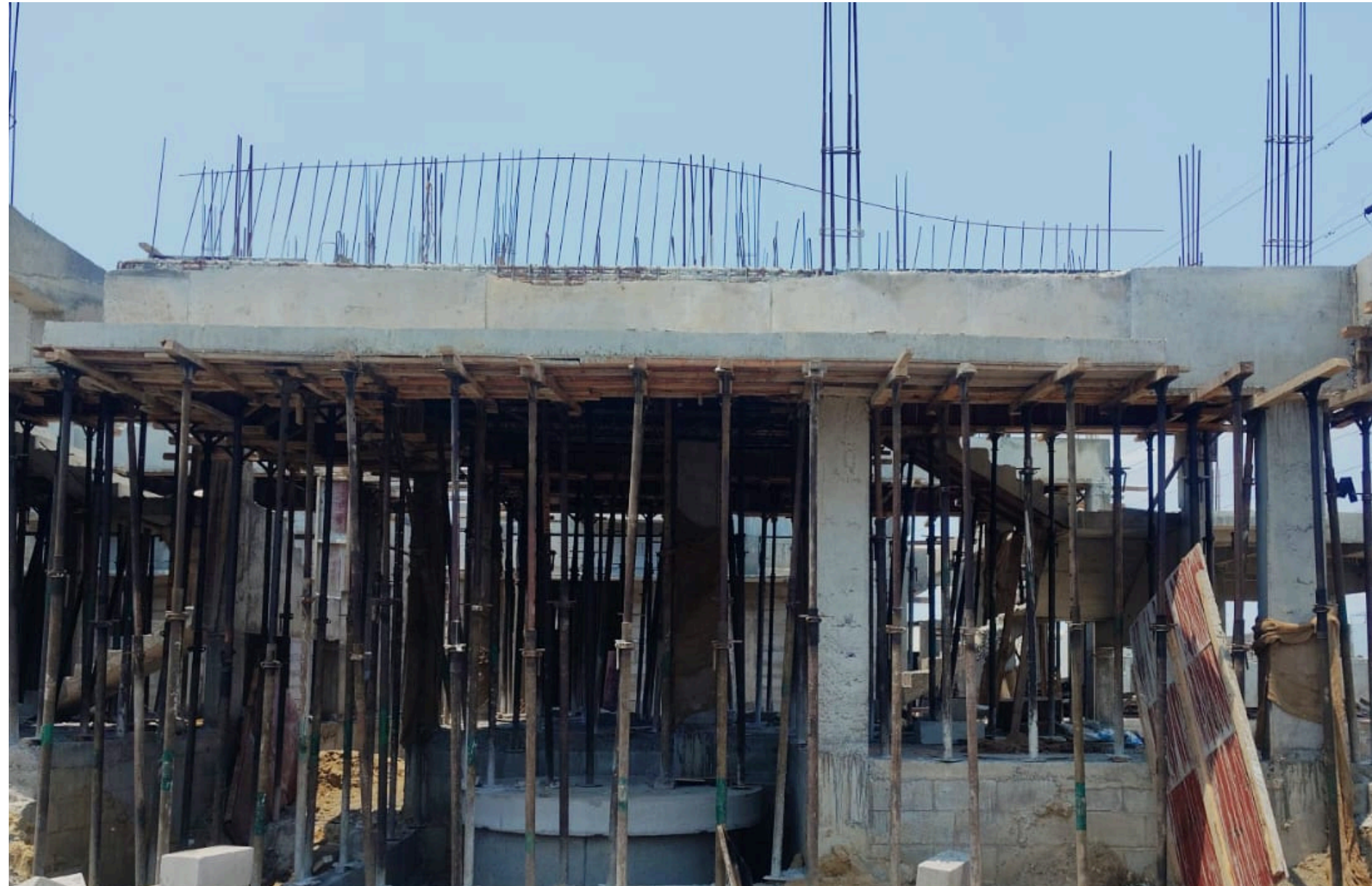
Villa No 81– GF Roof Slab Concrete Completed