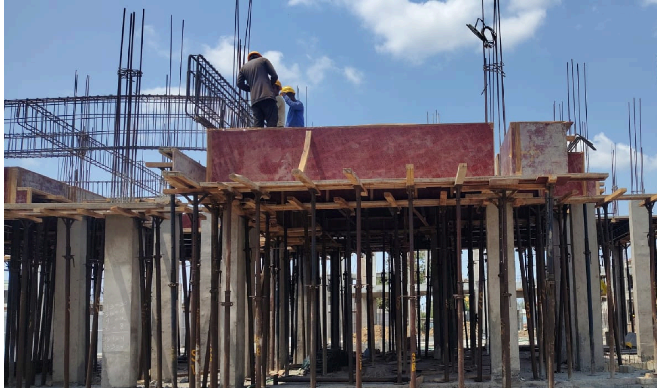
Villa No 105 – GF Roof Slab Reinforcement Work In Progress