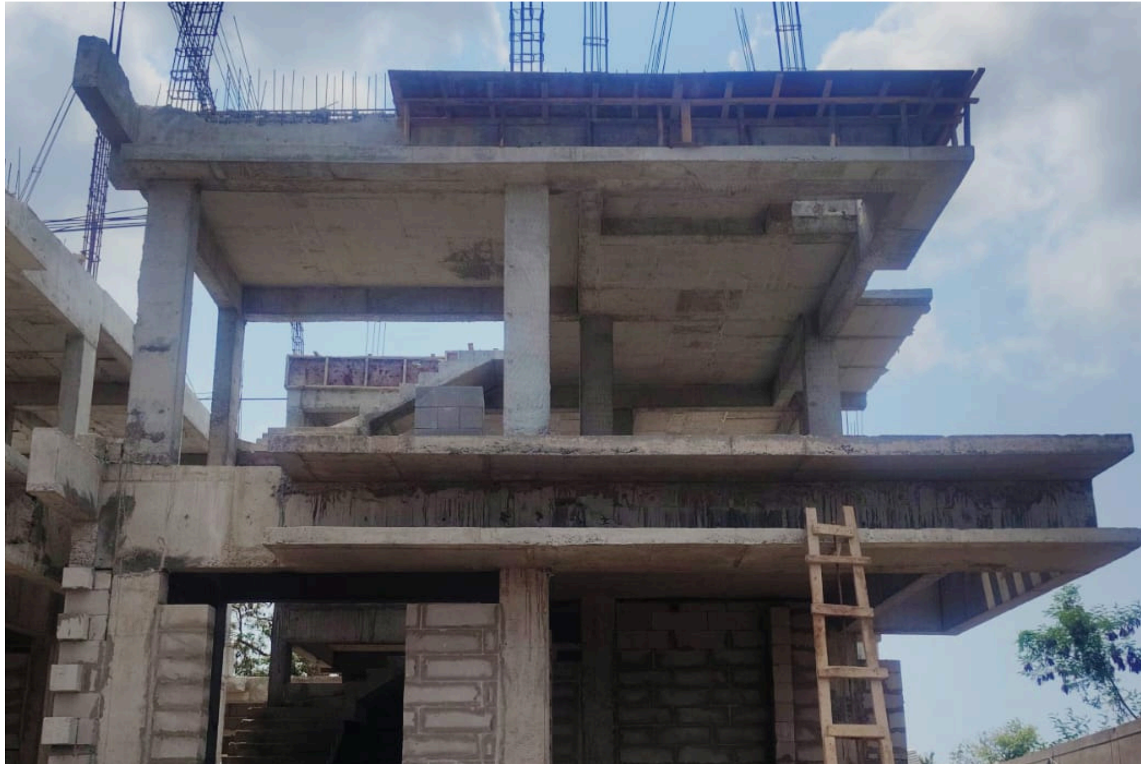
Villa No 38–SF Column Reinforcement Work In Progress