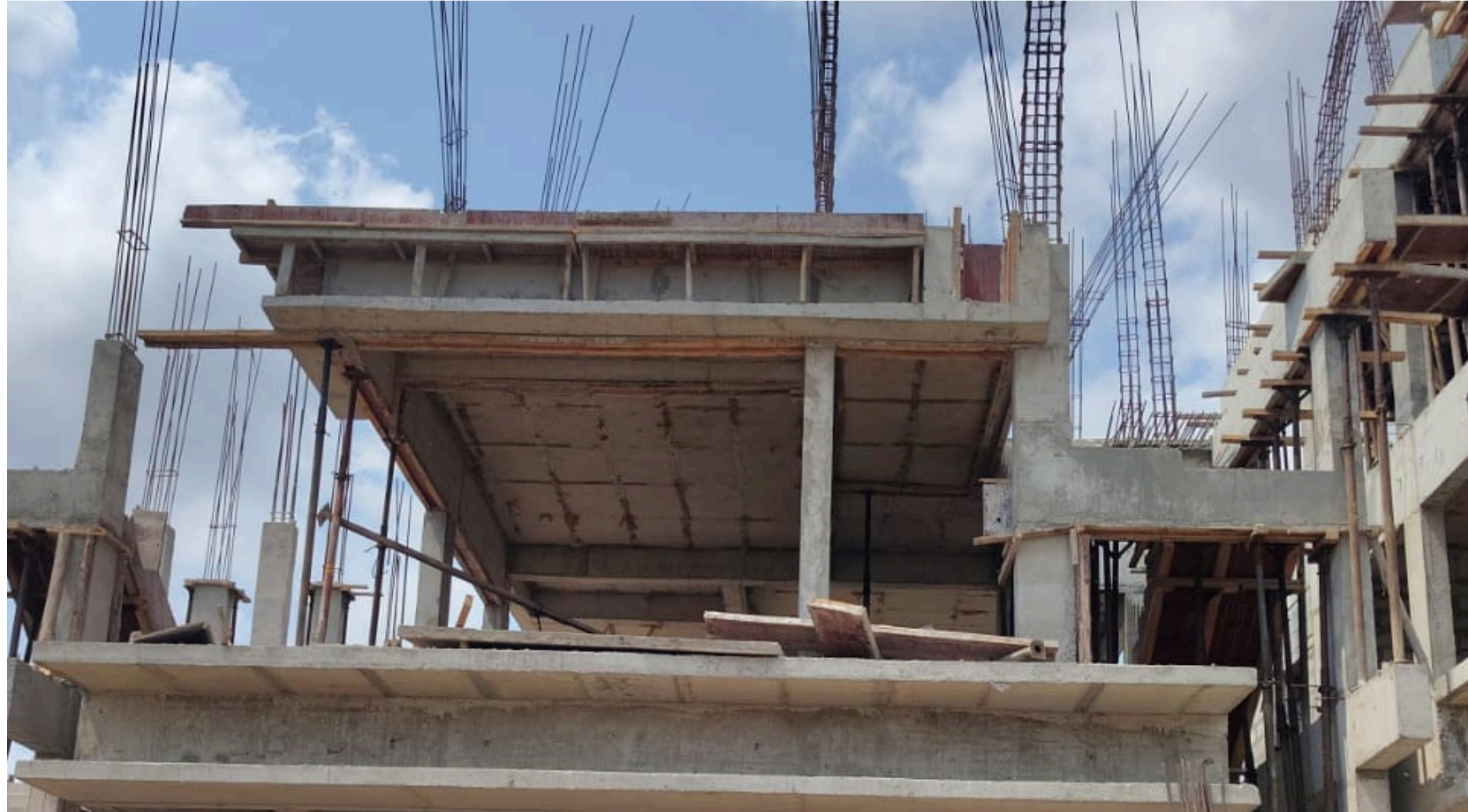
Villa No 26- SF Column Reinforcement work In Progress