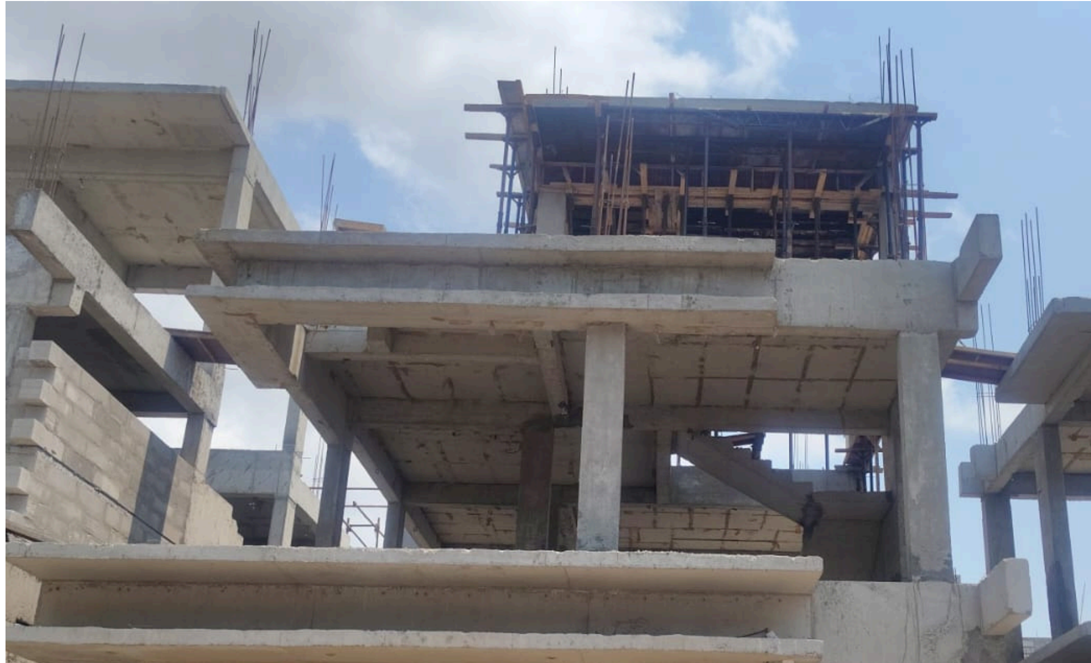
Villa No 70 – Head Room Slab Concrete Pouring Completed