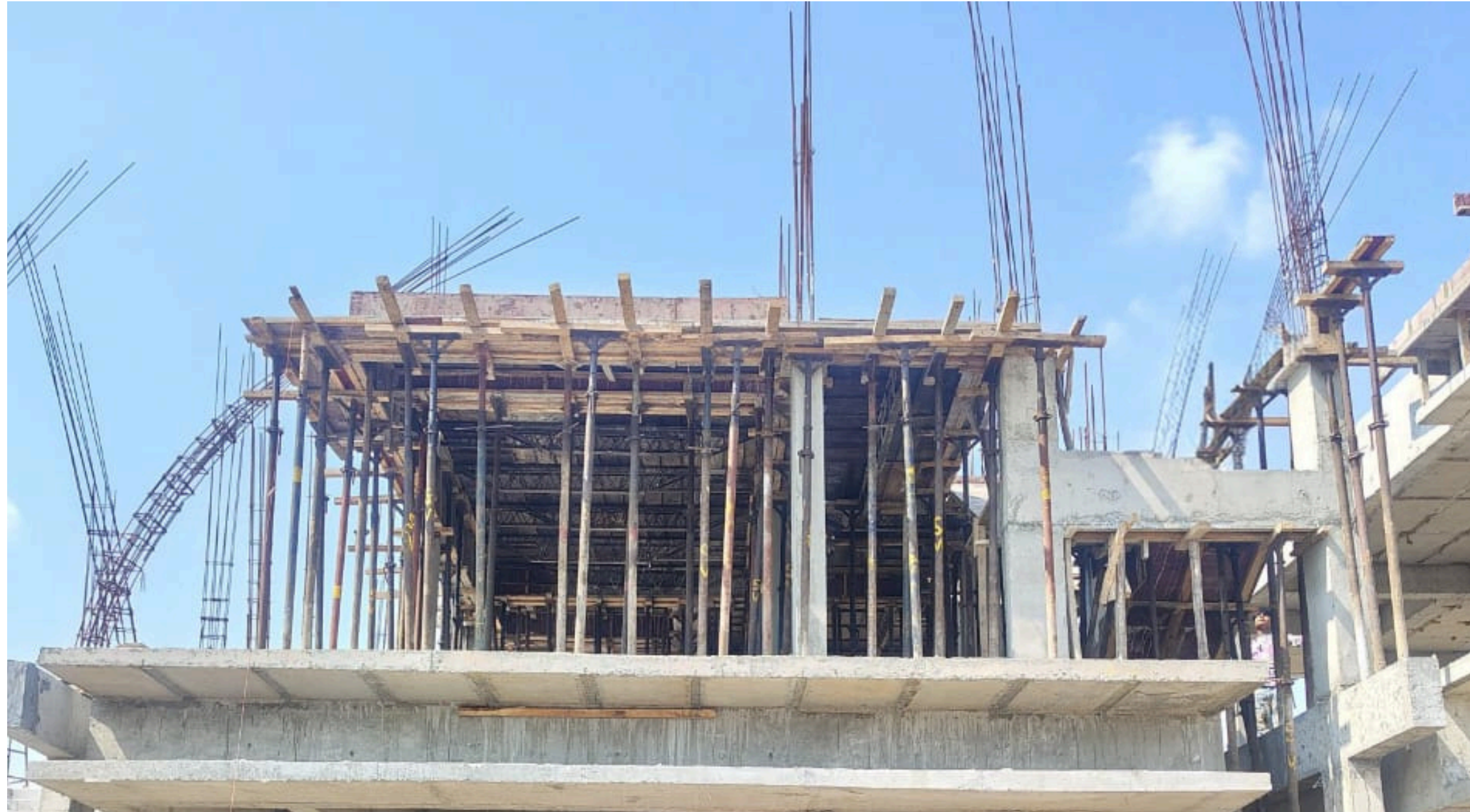
Villa No 25- FF Roof Slab Shuttering Work In Progress