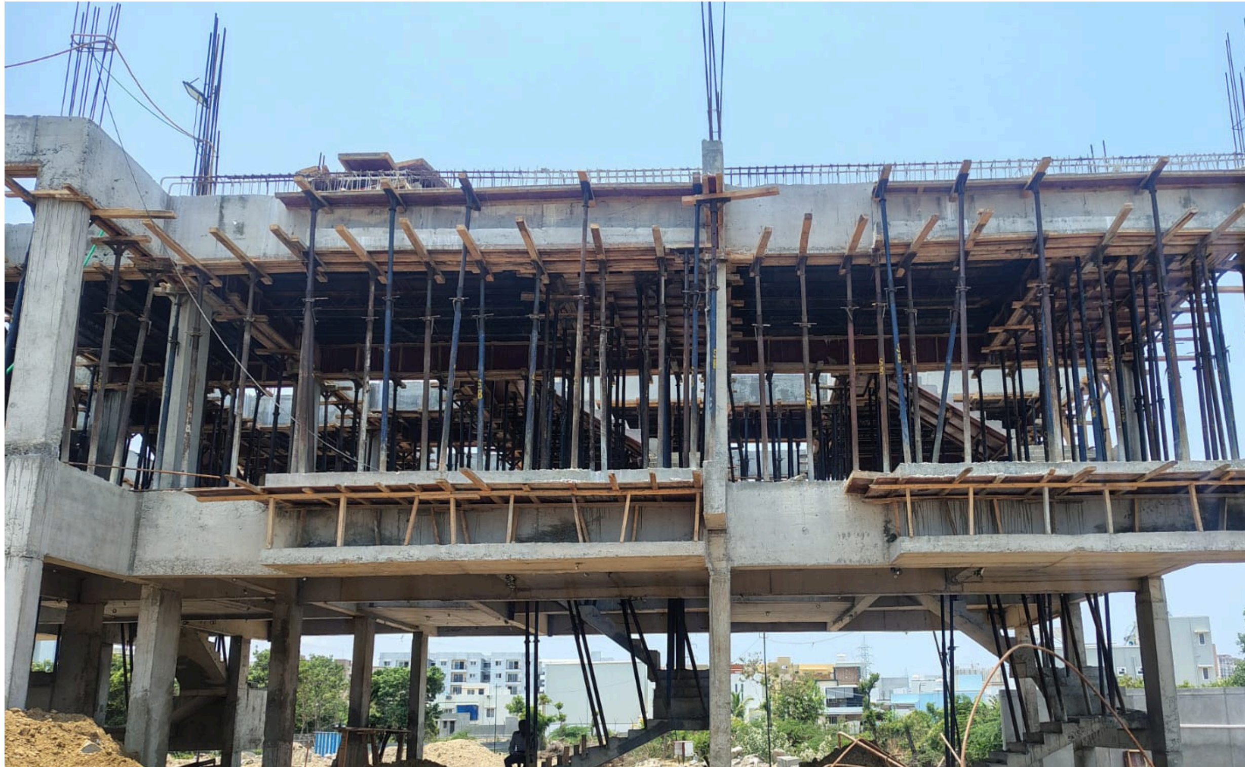
Villa No 99 to 102–FF Roof Slab Concrete Pouring Work Completed