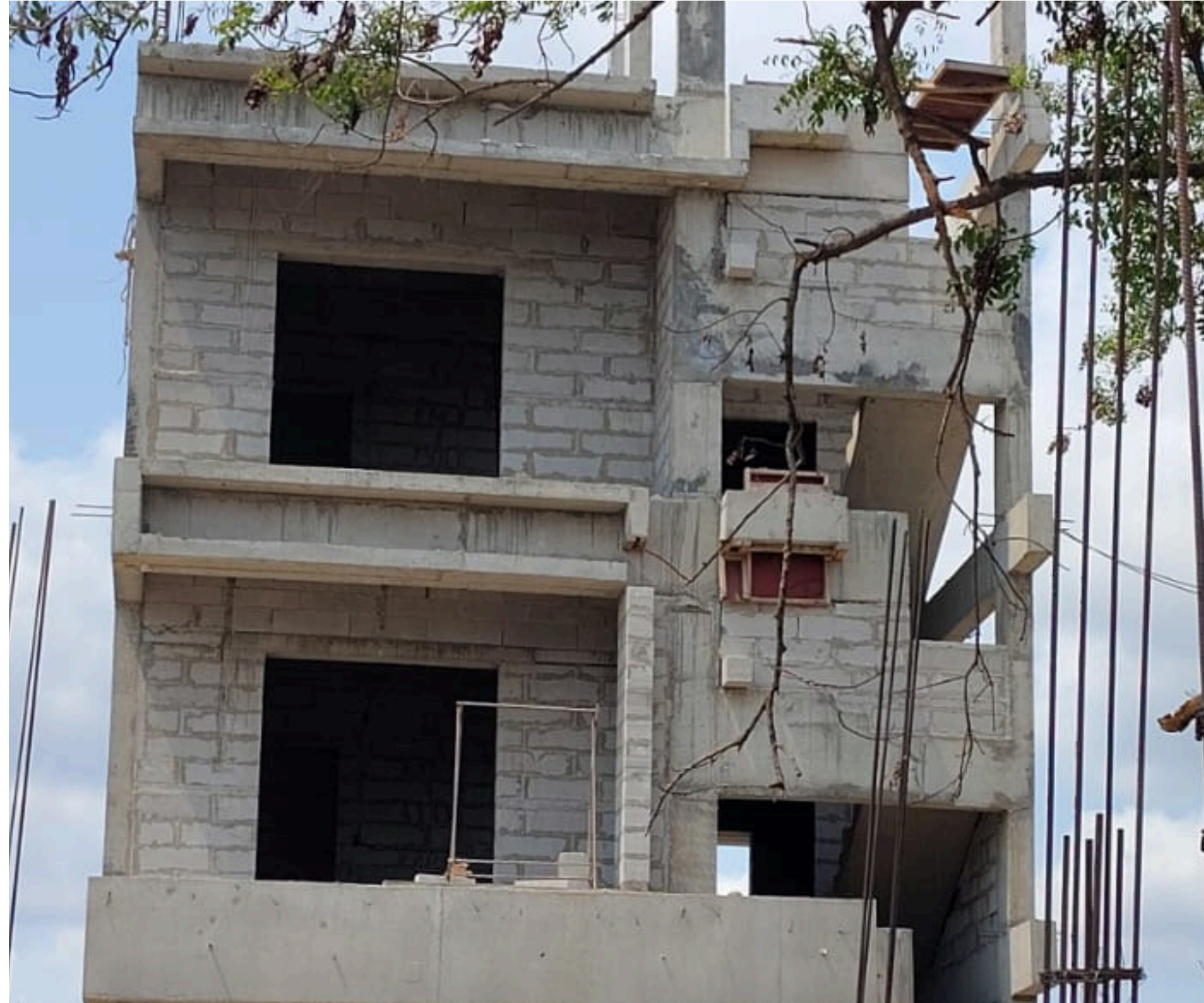
Villa No-29 Head Room Column Concrete work Completed