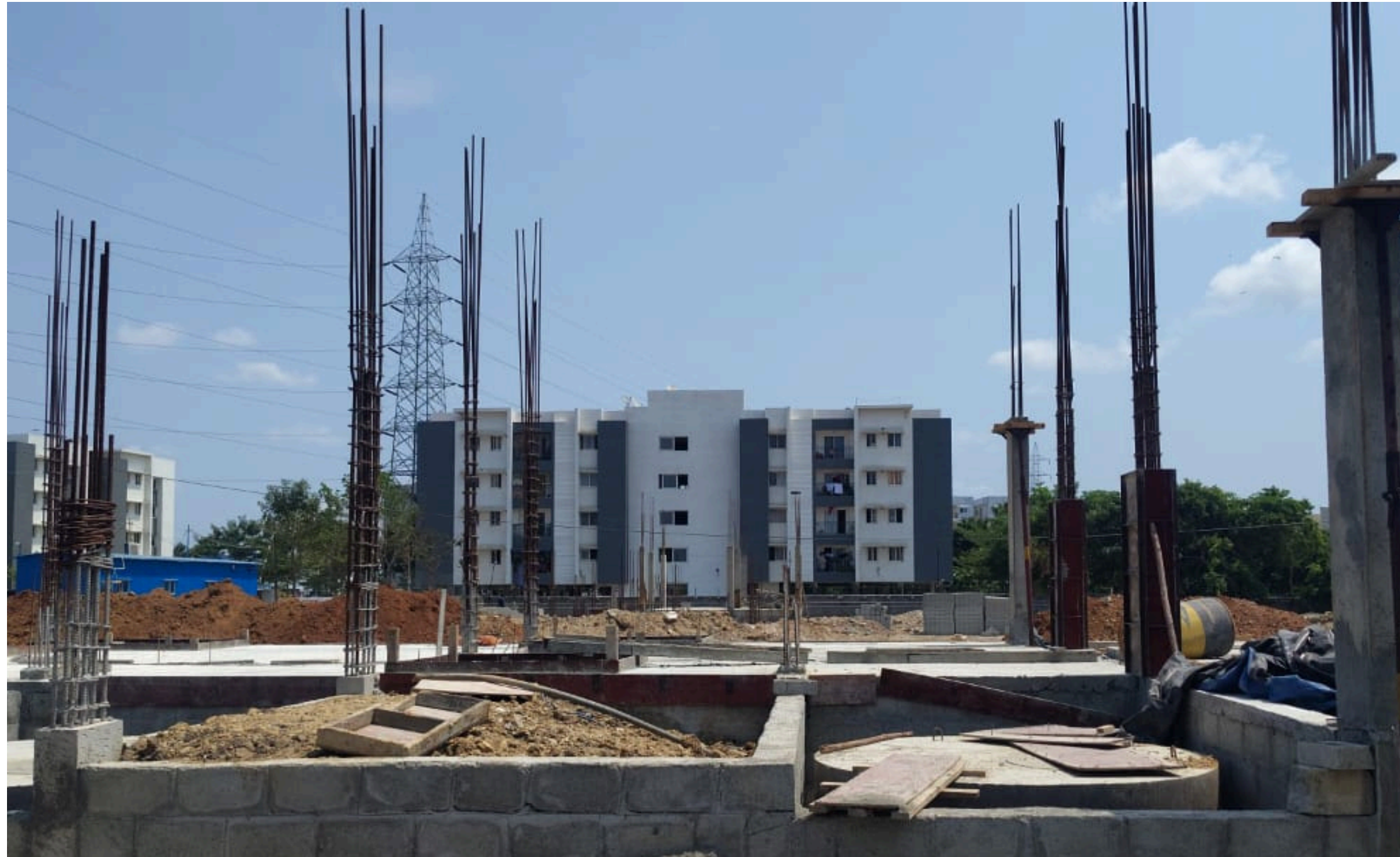
Villa No 88–Basement Backfilling Work In Progress