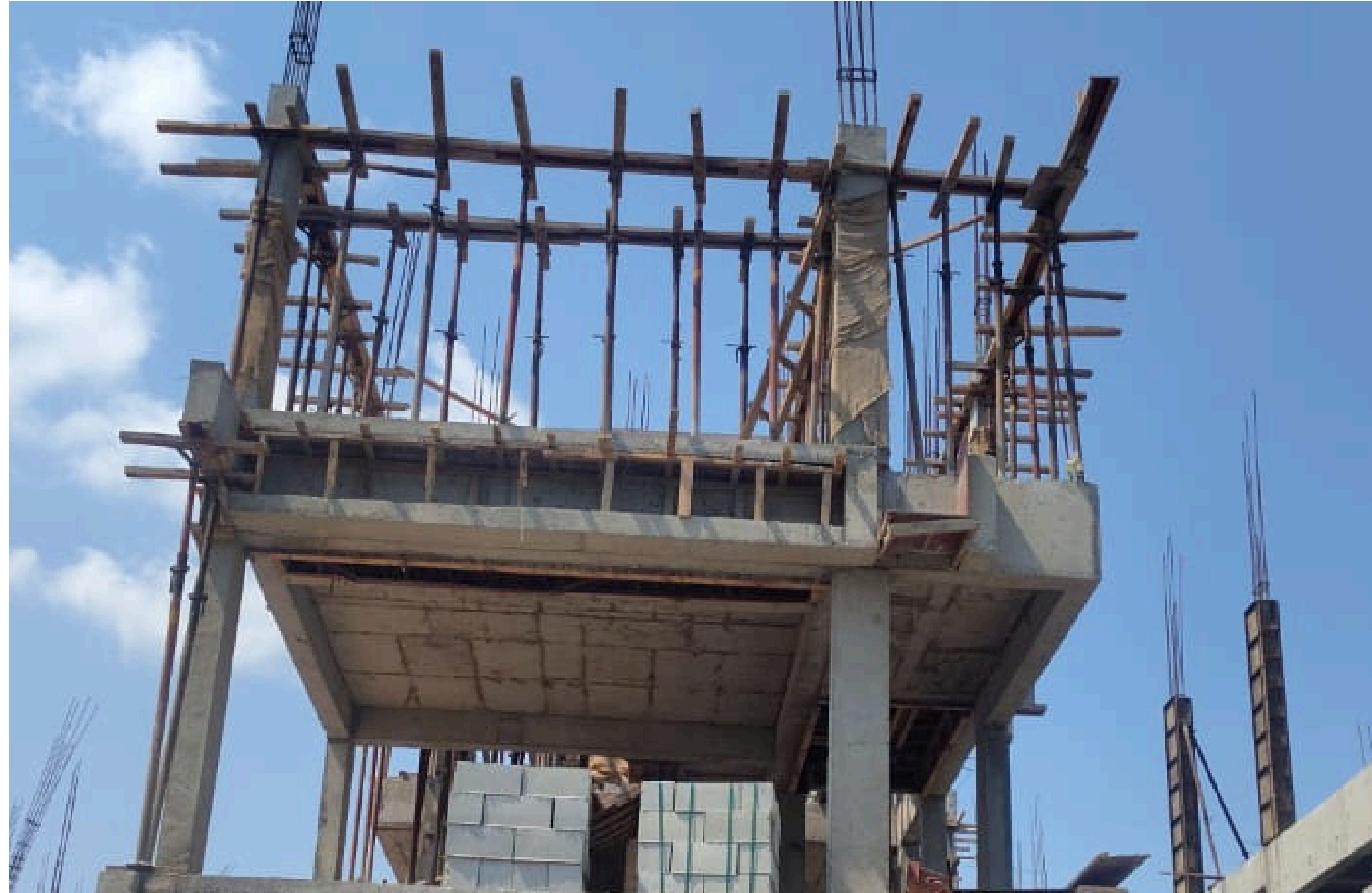
Villa No 41- SF Roof Slab Shuttering work Progress