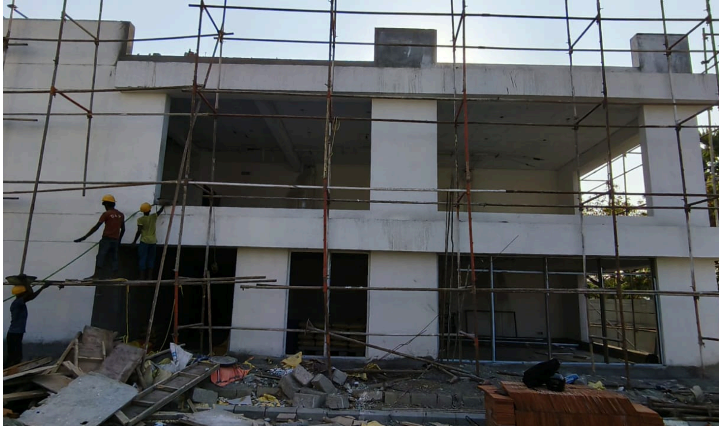
Villa No 18&19 – Club House Front Elevation View