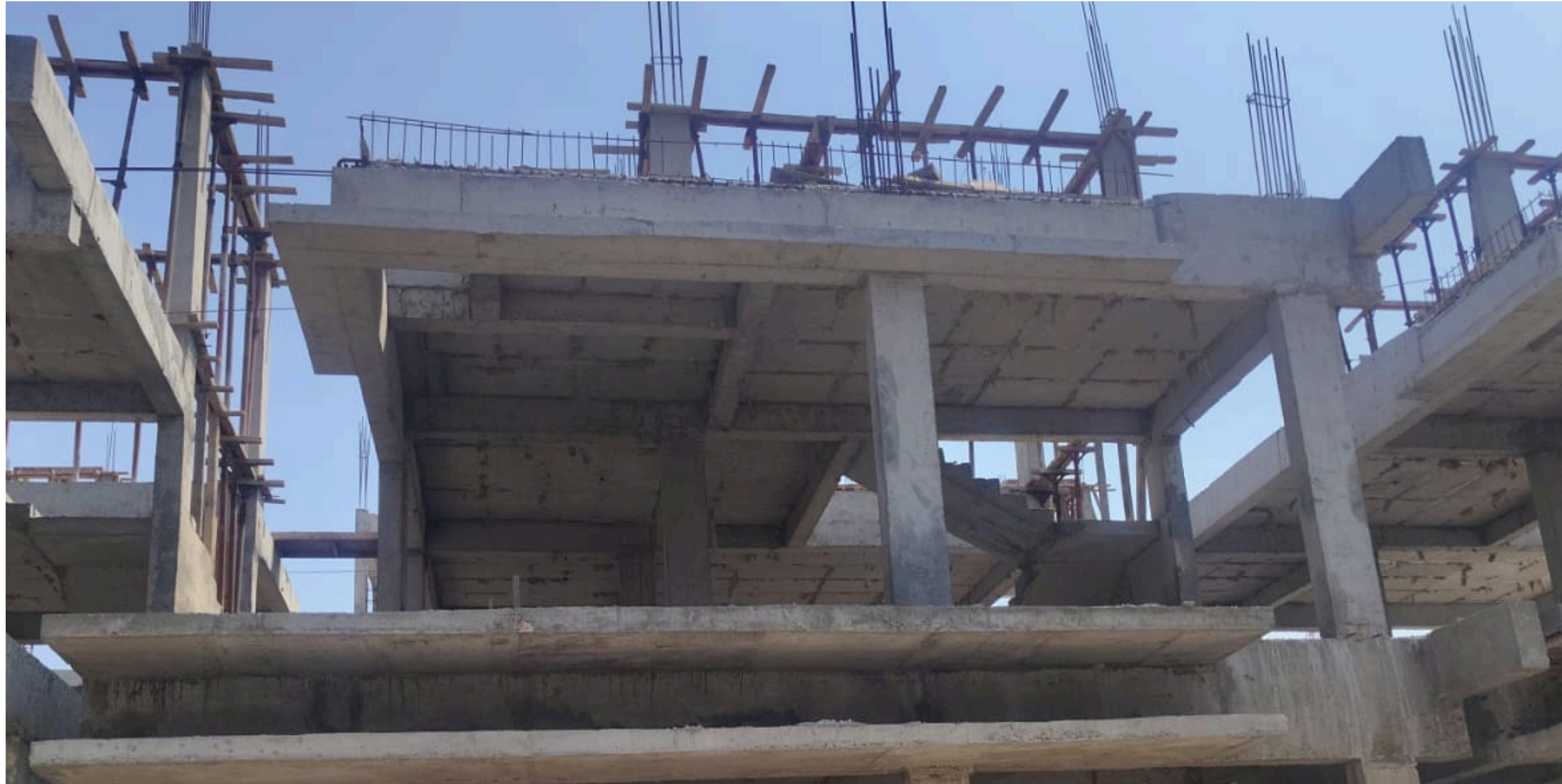
Villa No 60 – Head Room Roof Slab Shuttering Work In Progress