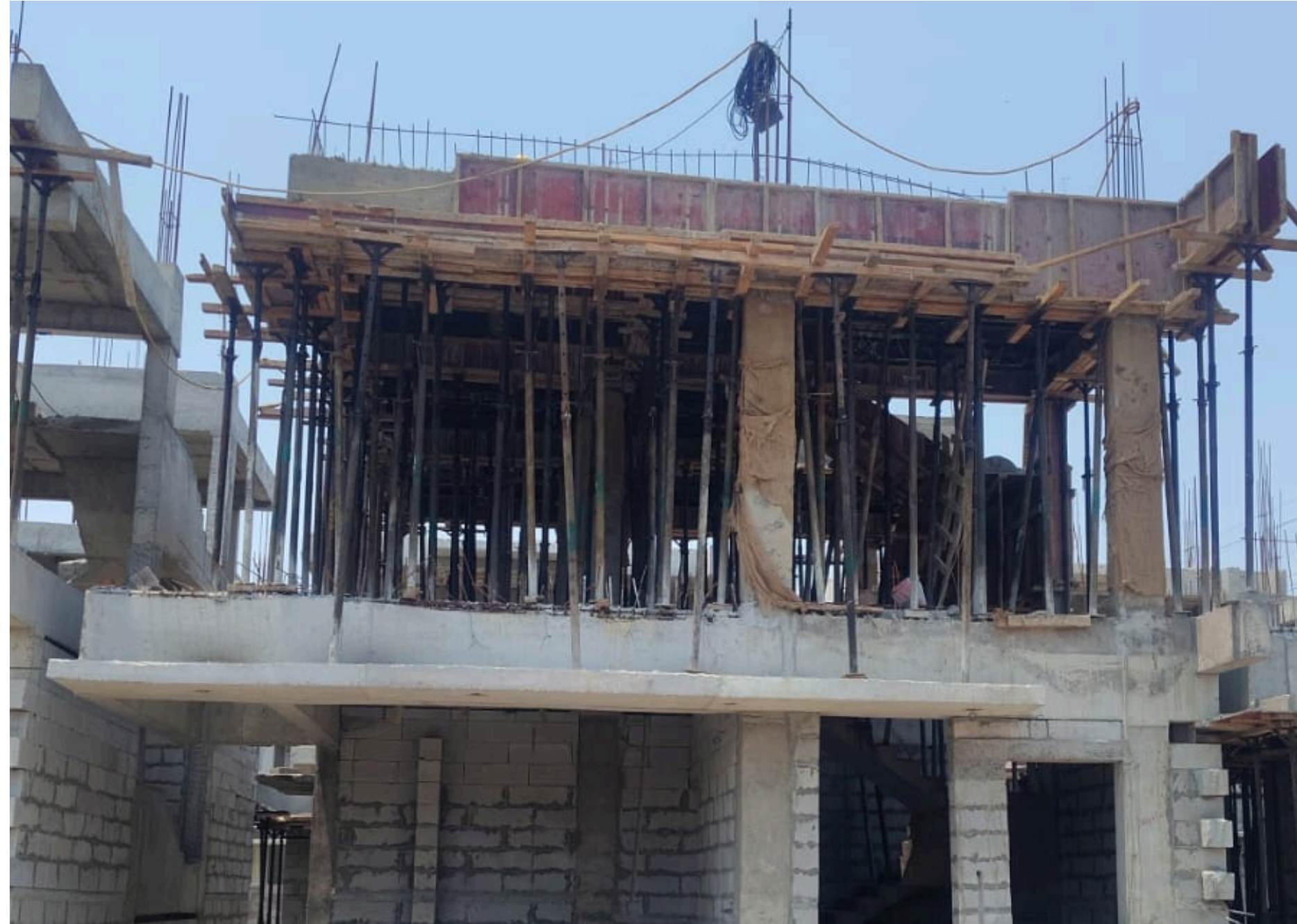
Villa No 79 –FF Roof Slab Concrete Completed