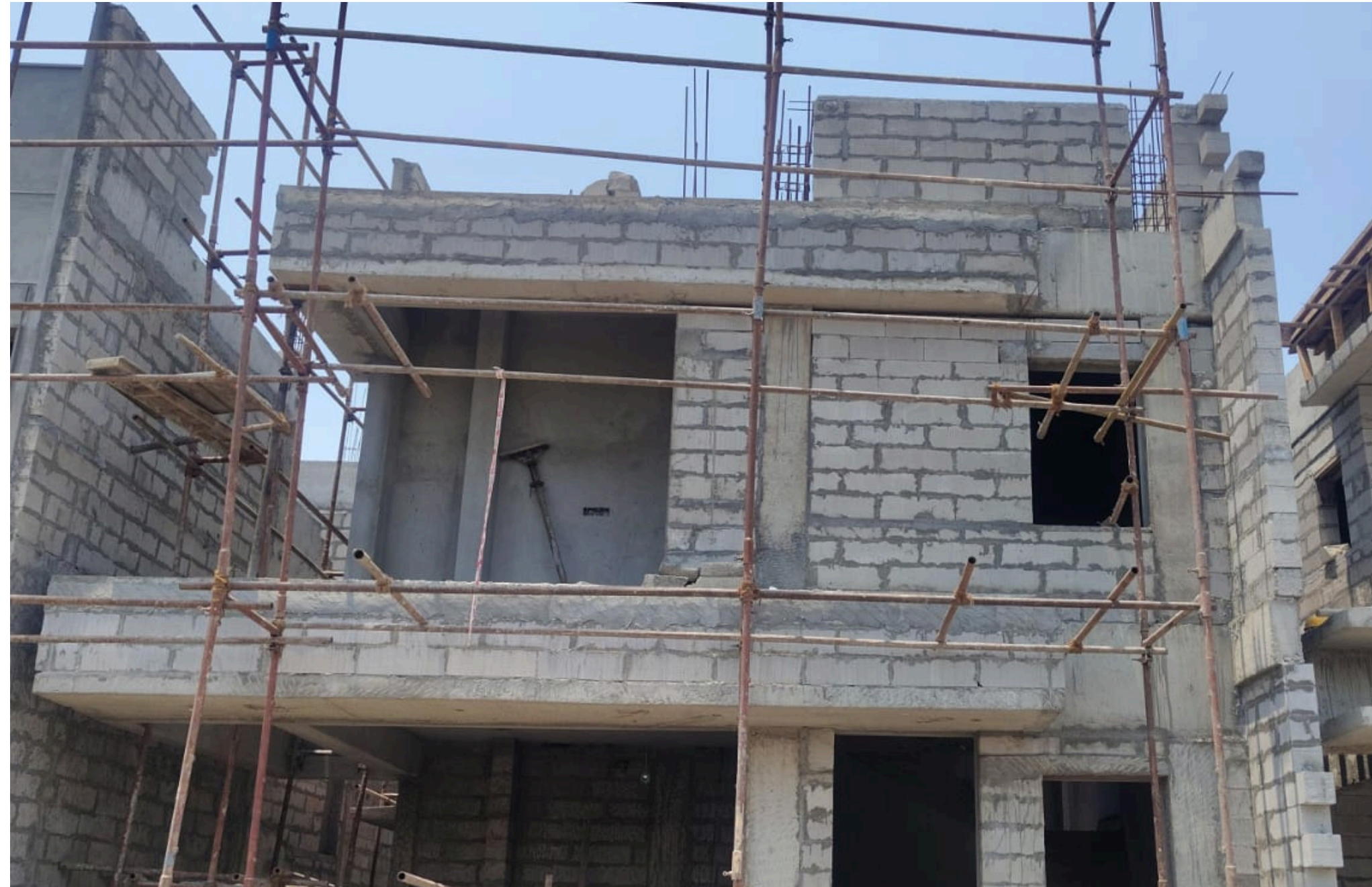
Villa No 75 –Parapet Wall Block Work In Progress