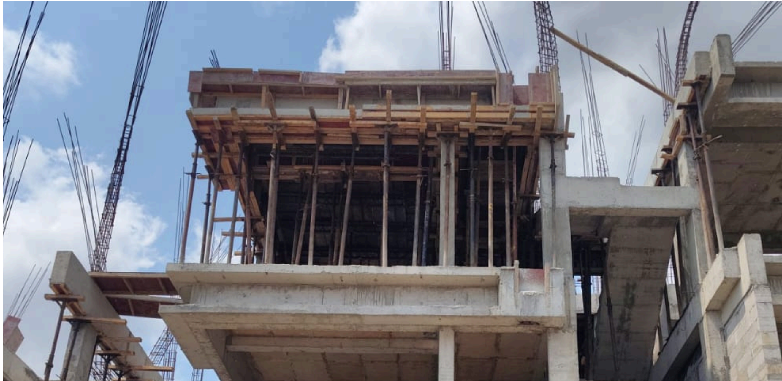
Villa No 27 –Head Room Roof Slab Column Reinforcement Work In Progress