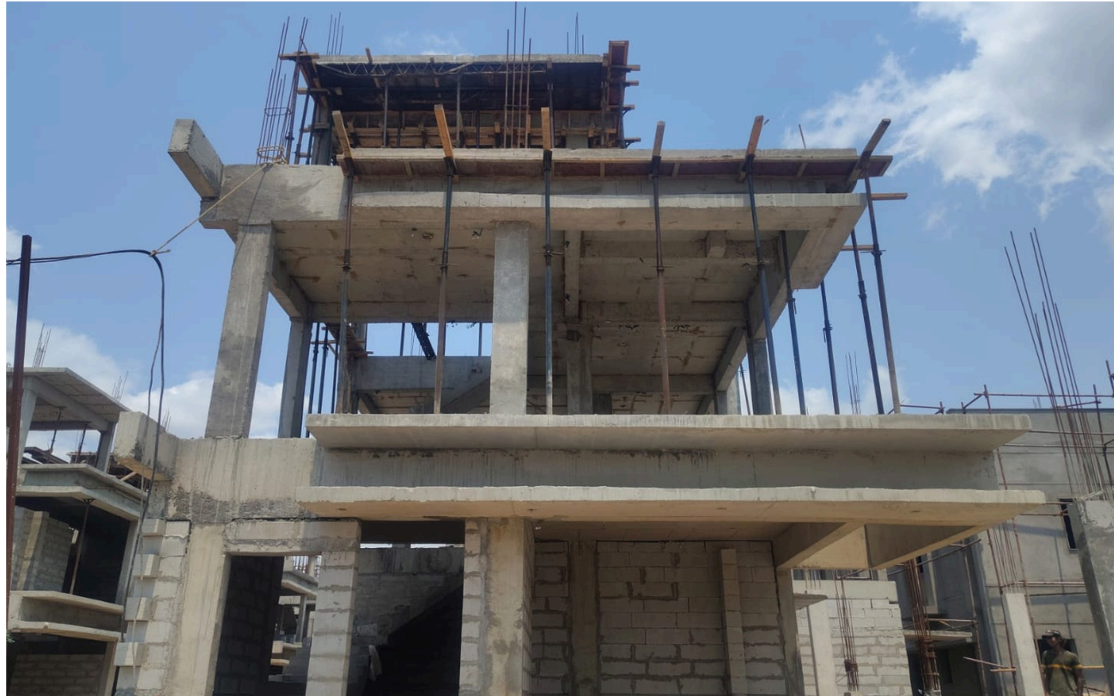
Villa No 71 –Head Room Roof Slab Concrete Pouring Completed