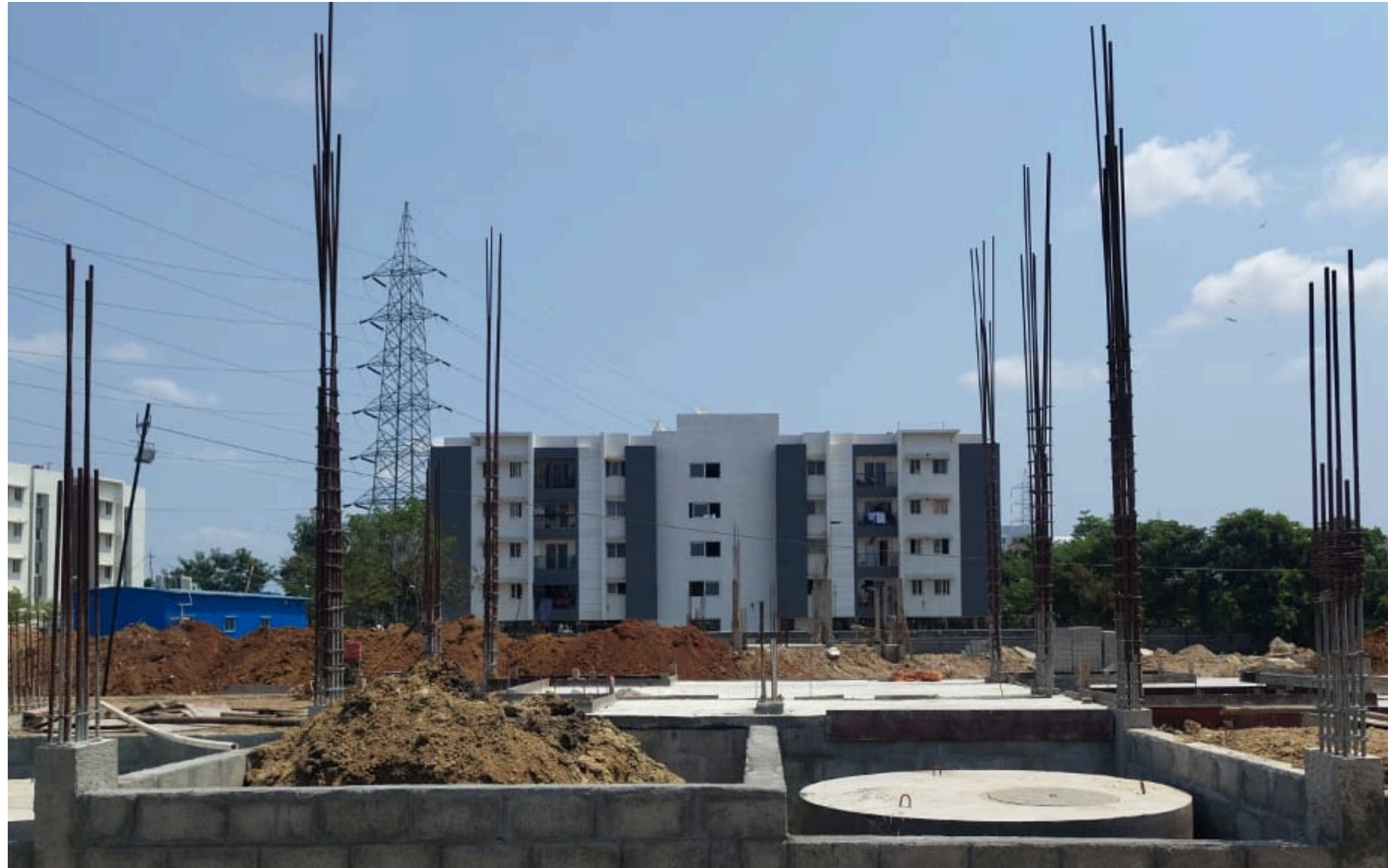
Villa No 86–Basement Back Filling Work In Progress