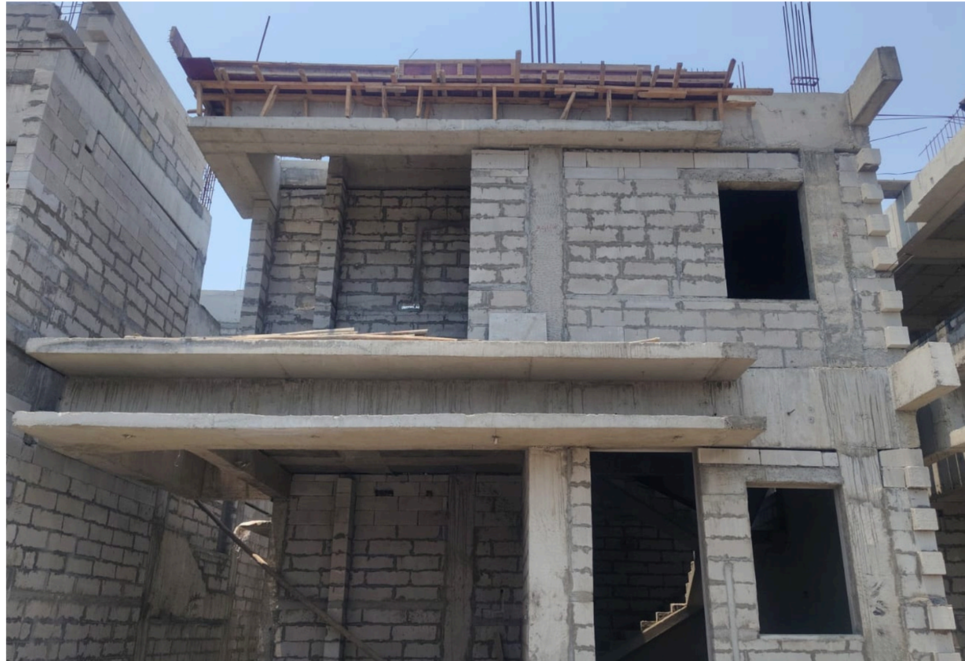
Villa No 76 –FF Block Work Completed