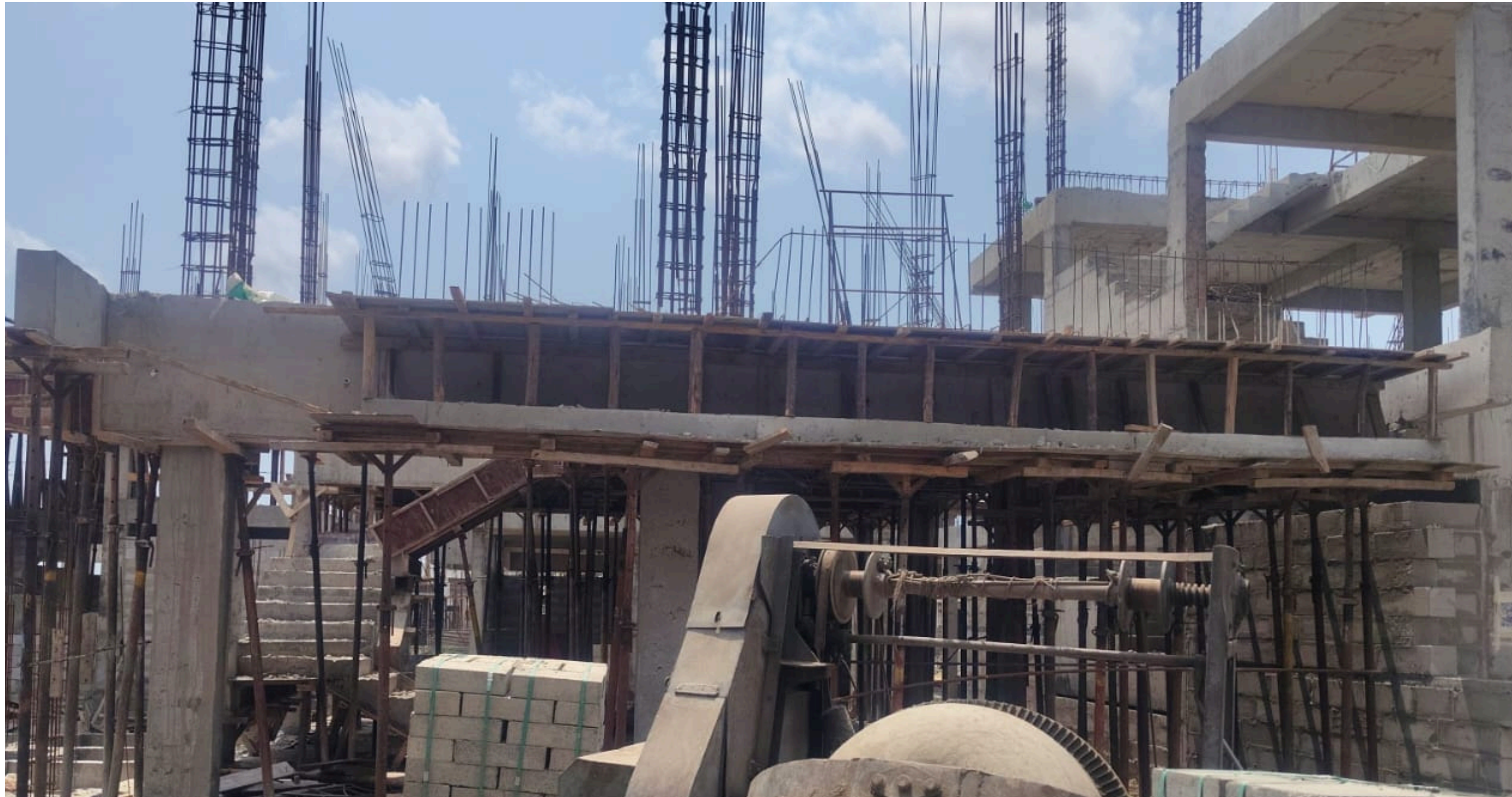
Villa No 36–FF Column Reinforcement Work In Progress