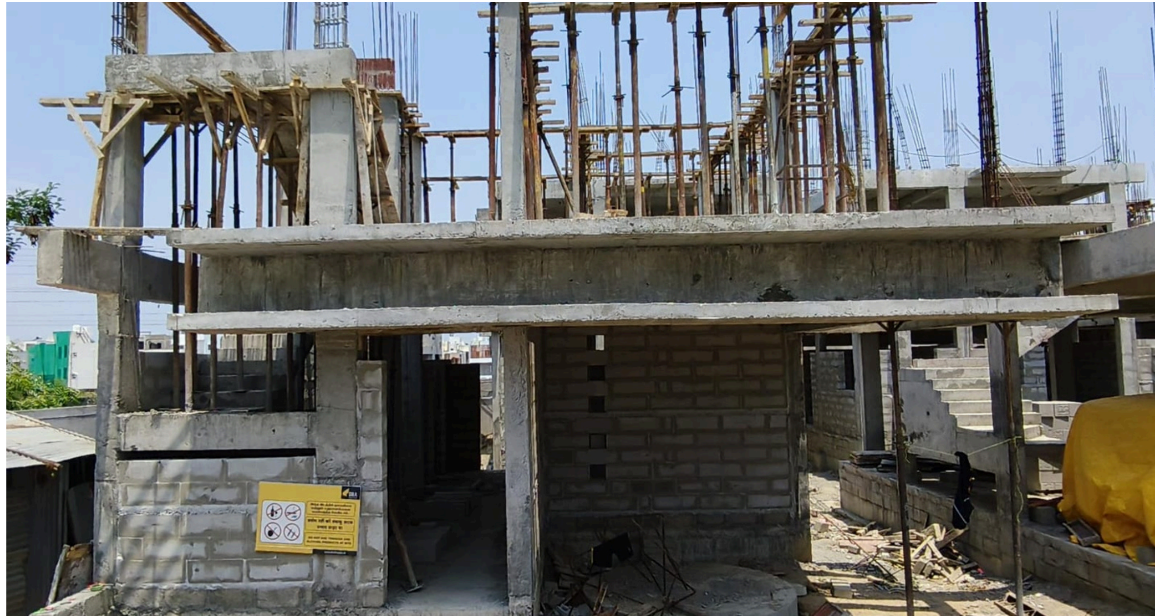
Villa No 30 – FF Roof Slab Shuttering Work In Progress