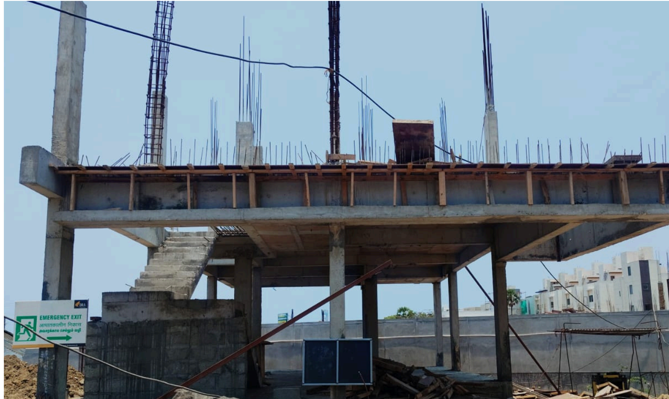
Villa No 108–FF Column Concrete Pouring Completed