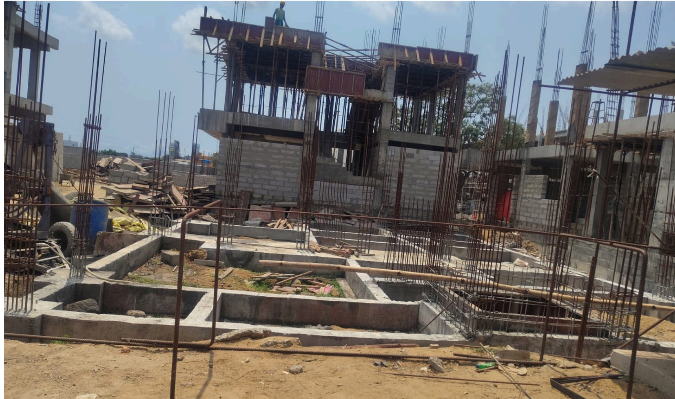
Villa No 35- Plinth Beam Concrete Pouring work Completed