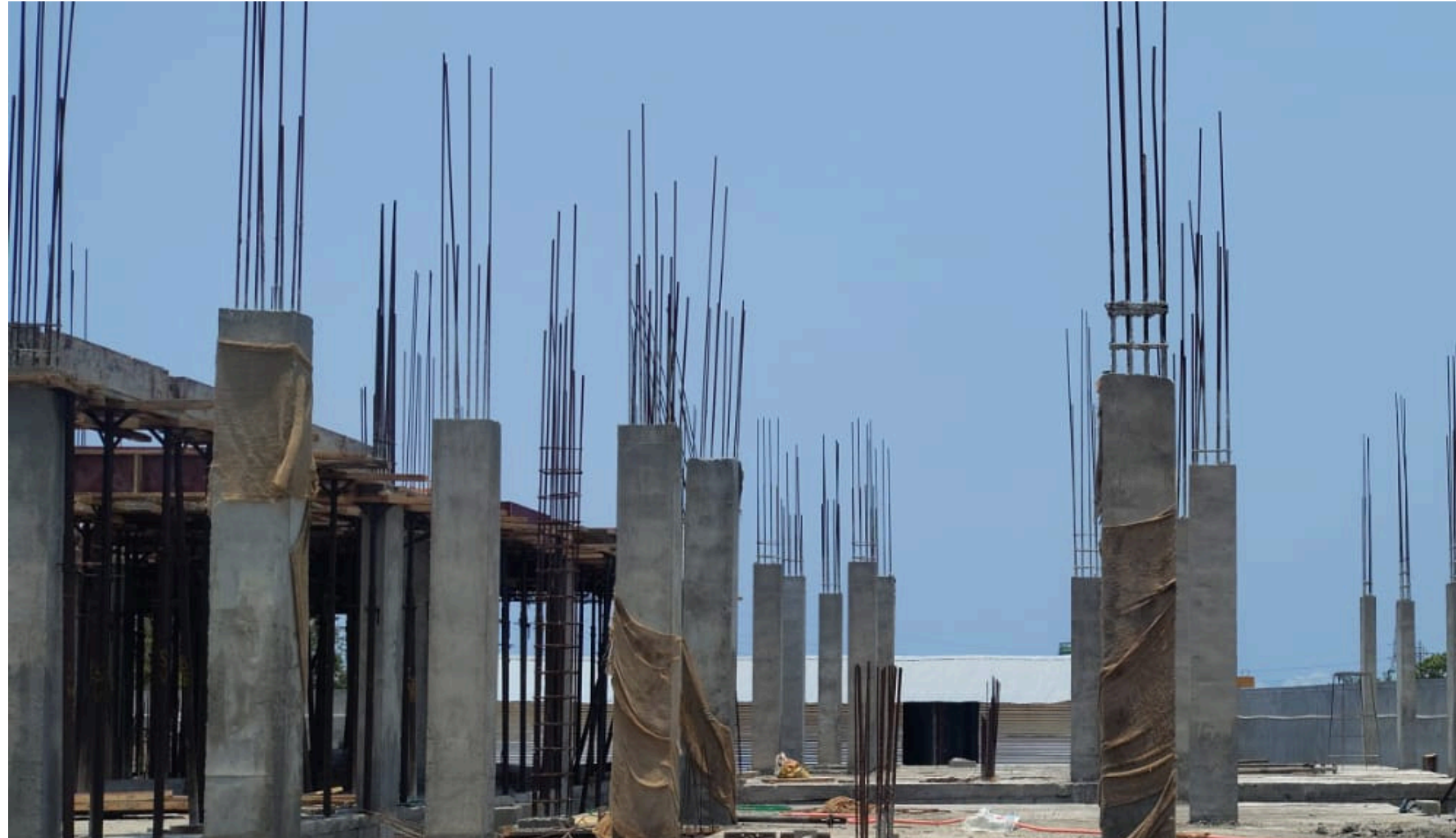
Villa No 106–GF Column Concrete Pouring Work Completed