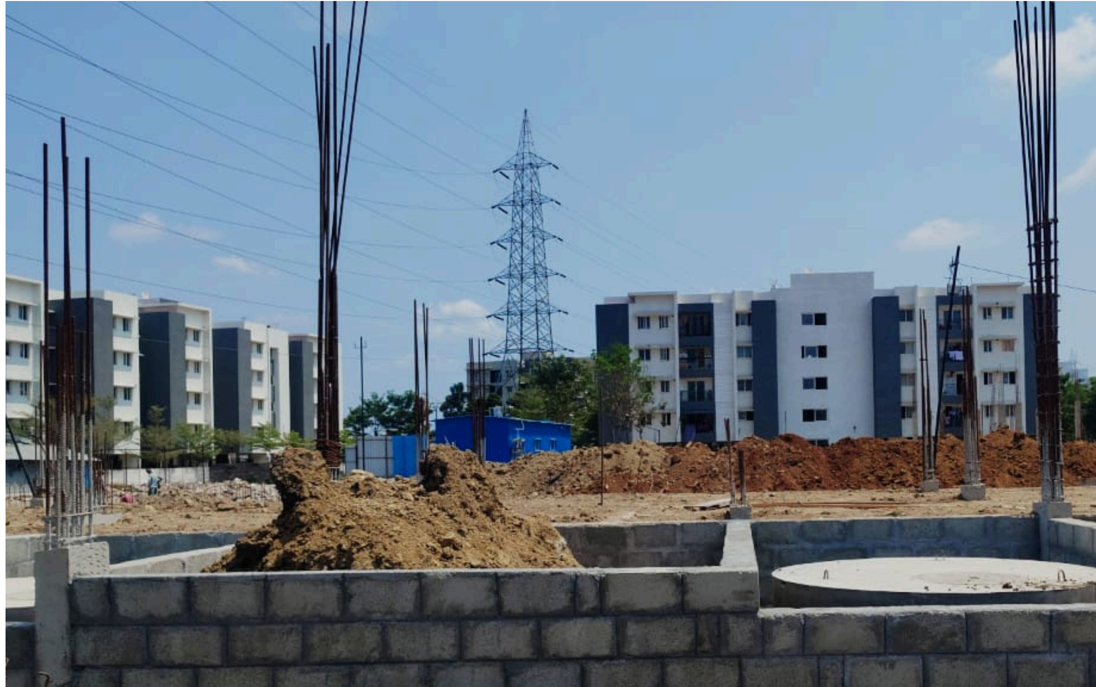
Villa No 85 –Basement Back Filling Work In Progress