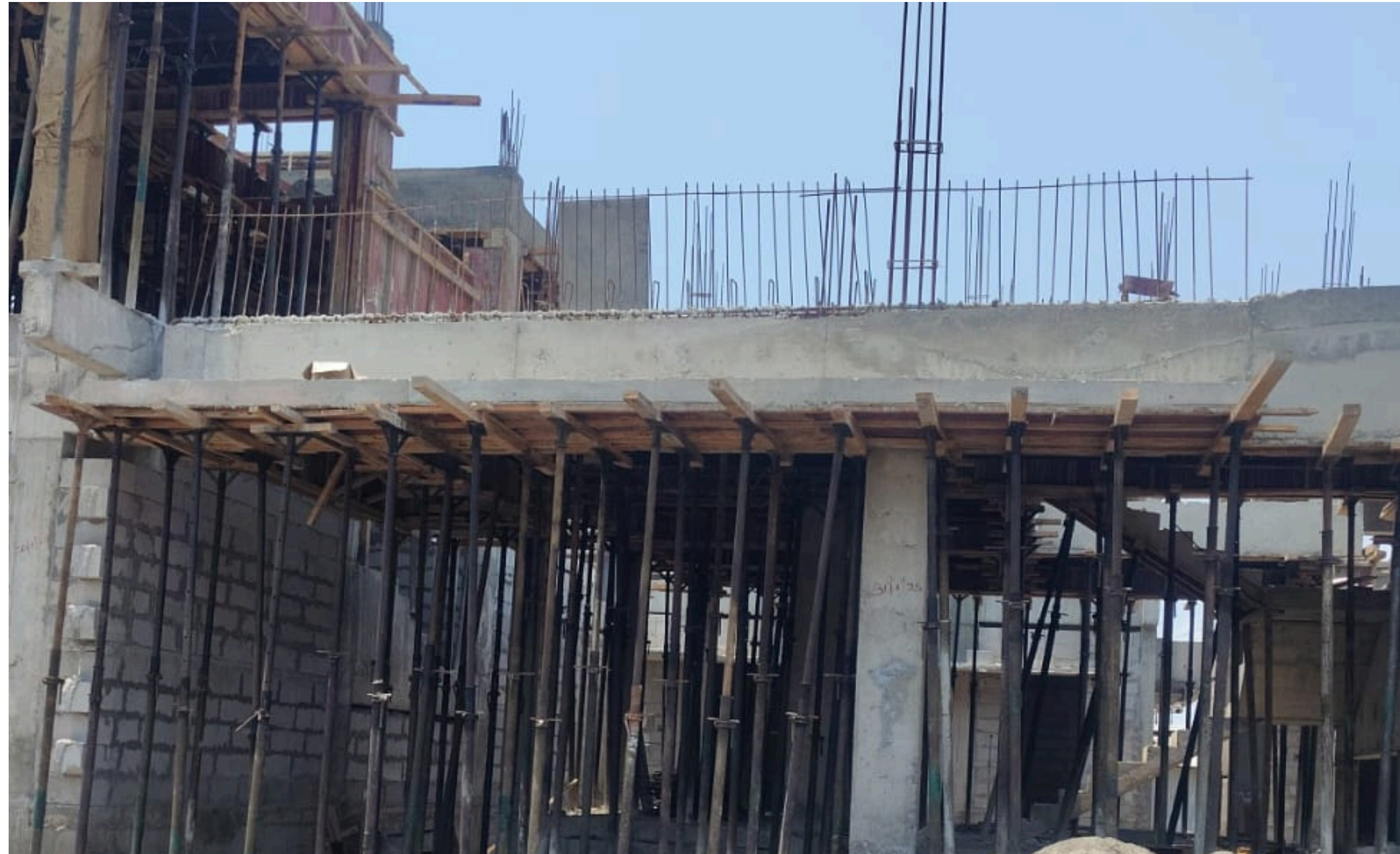
Villa No 80 –GF Roof Slab Concrete Completed