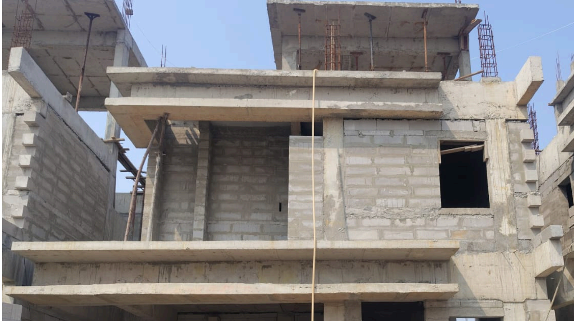
Villa No 48 –Parapet Wall Block Work In Progress