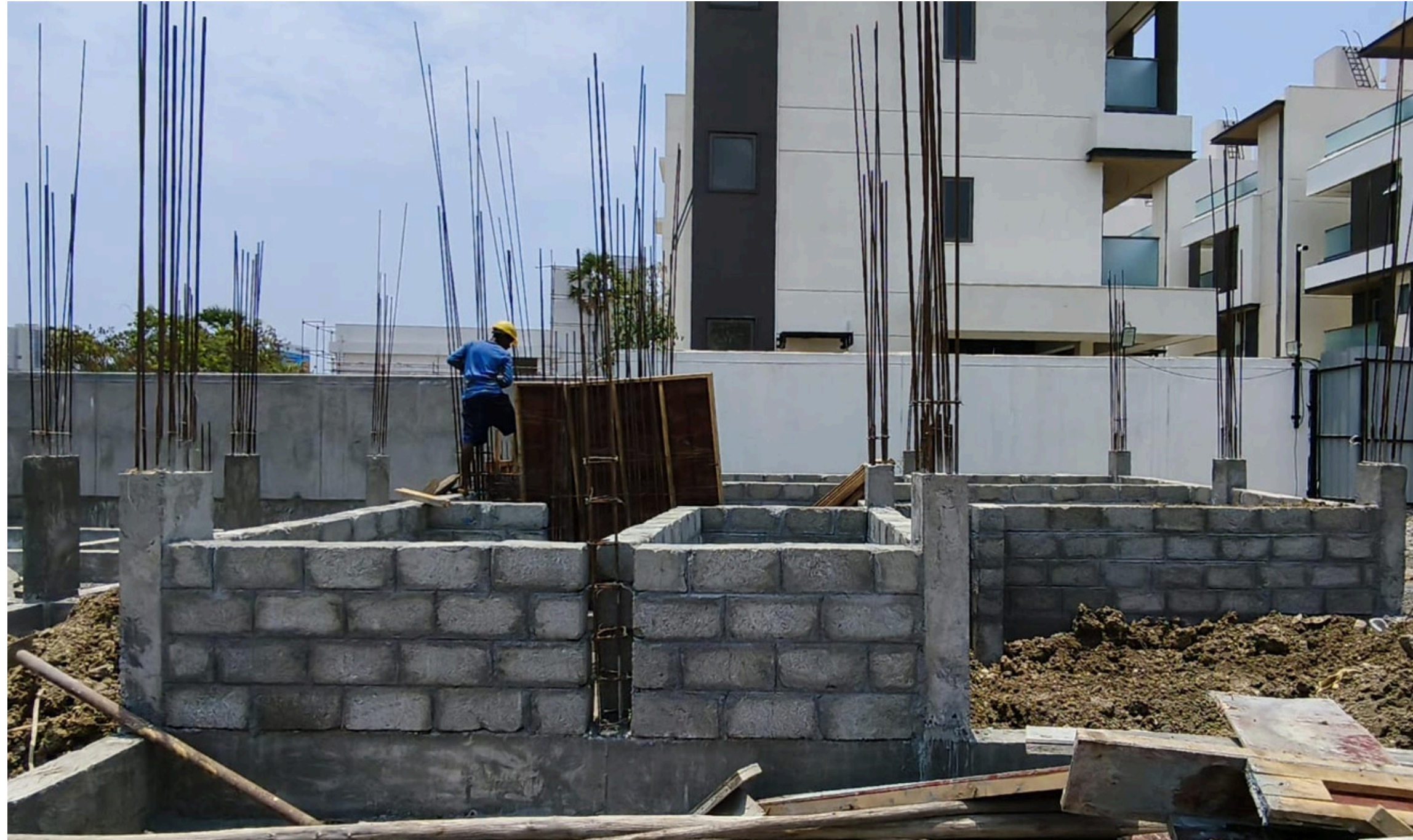
Villa No 122–Basement Block Work In Progress