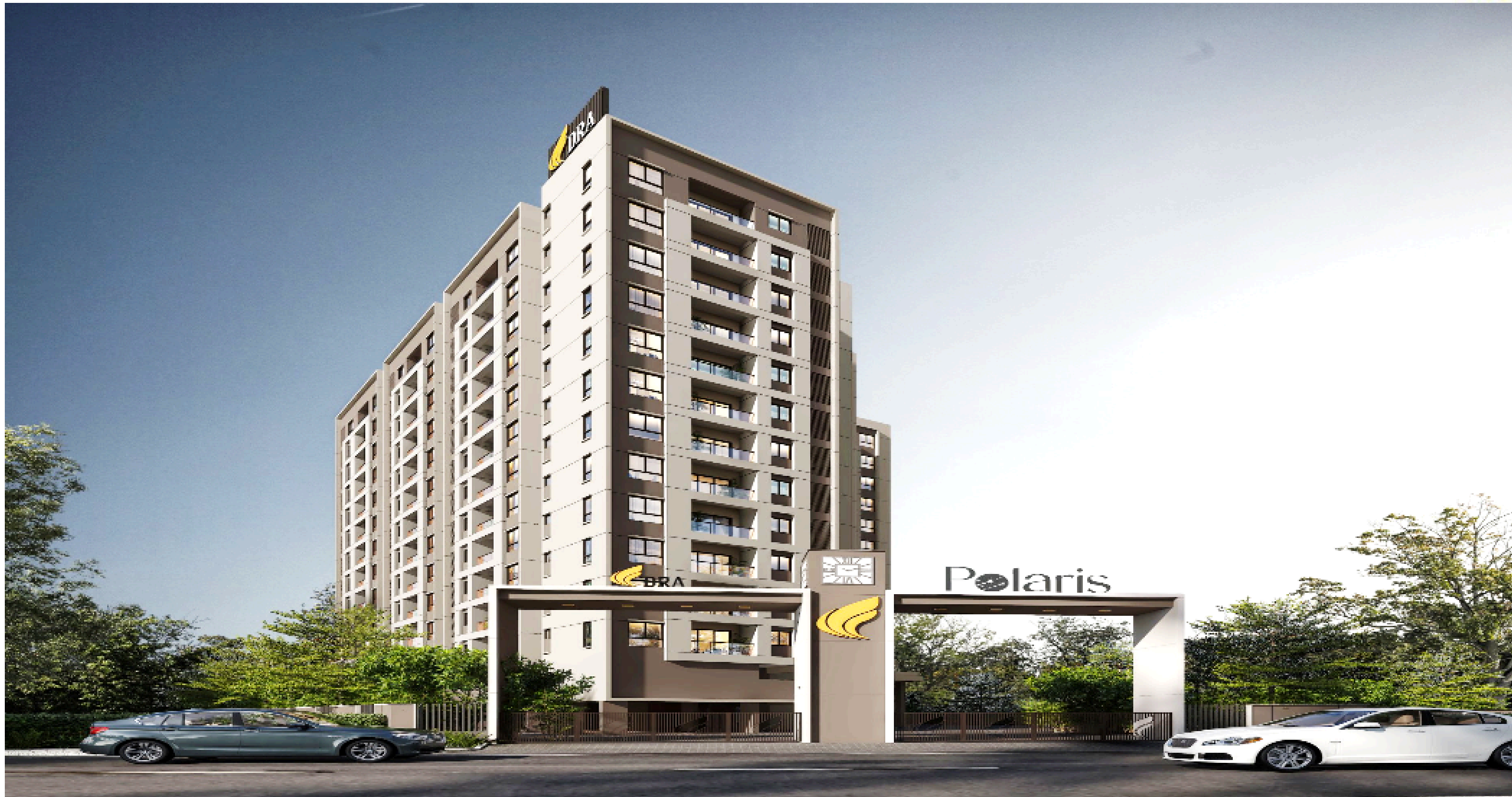
DRA POLARIS Construction update photos – April 2026