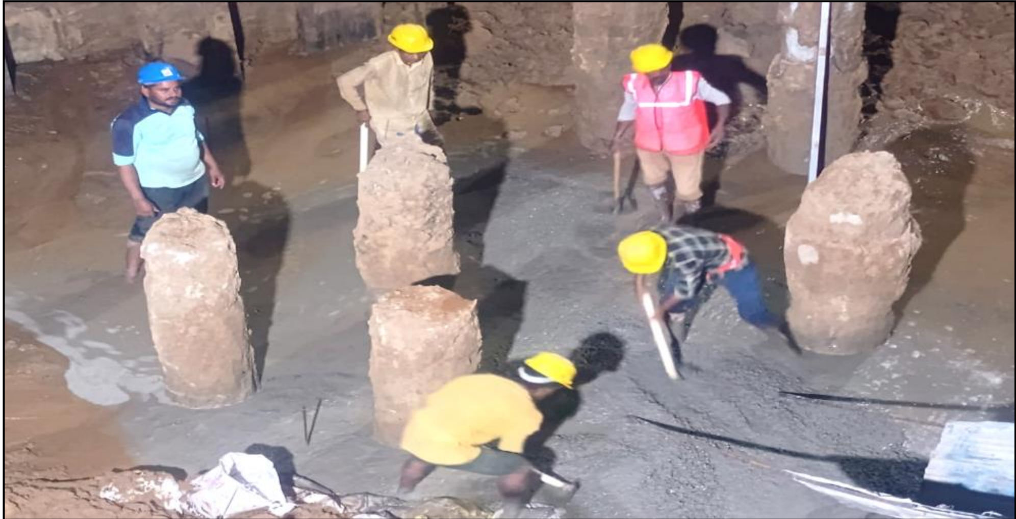
UG Sump –Raft PCC 25cum completed (25 /52 cum)