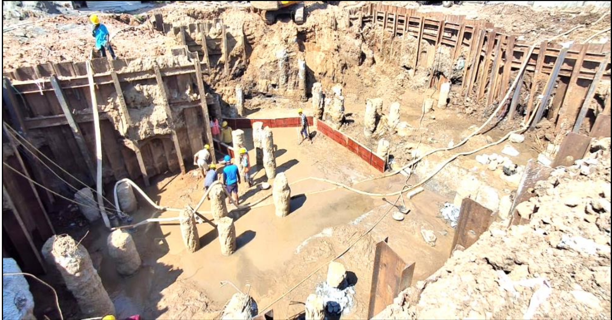
UG Sump dewatering work in progress