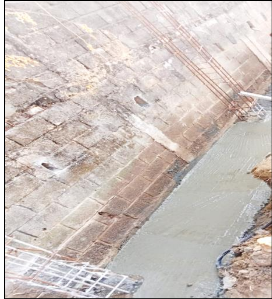
Compound wall – Plinth beam PCC work 39m completed (94/113m)