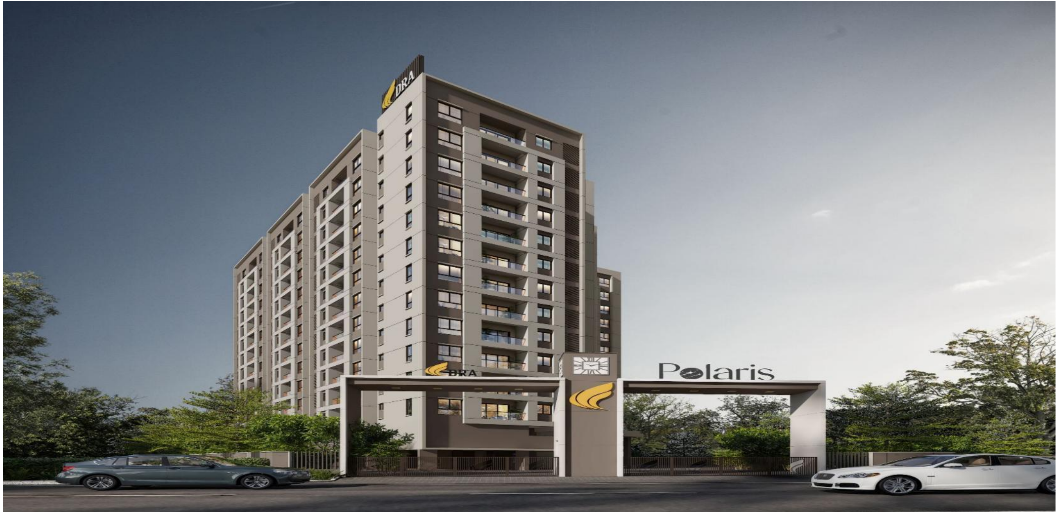
DRA POLARIS Construction updates photos – March 2025