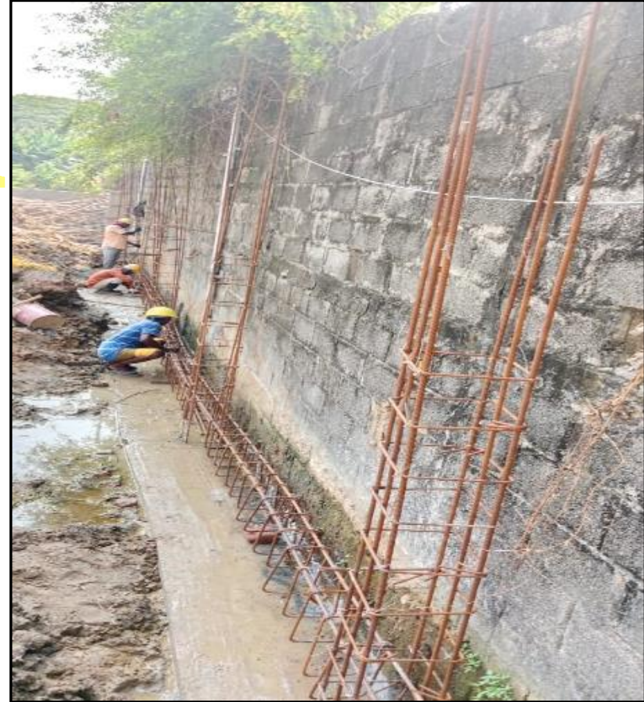
Compound wall plinth beam & RC wall reinforcement work 29m completed (70/113 m)