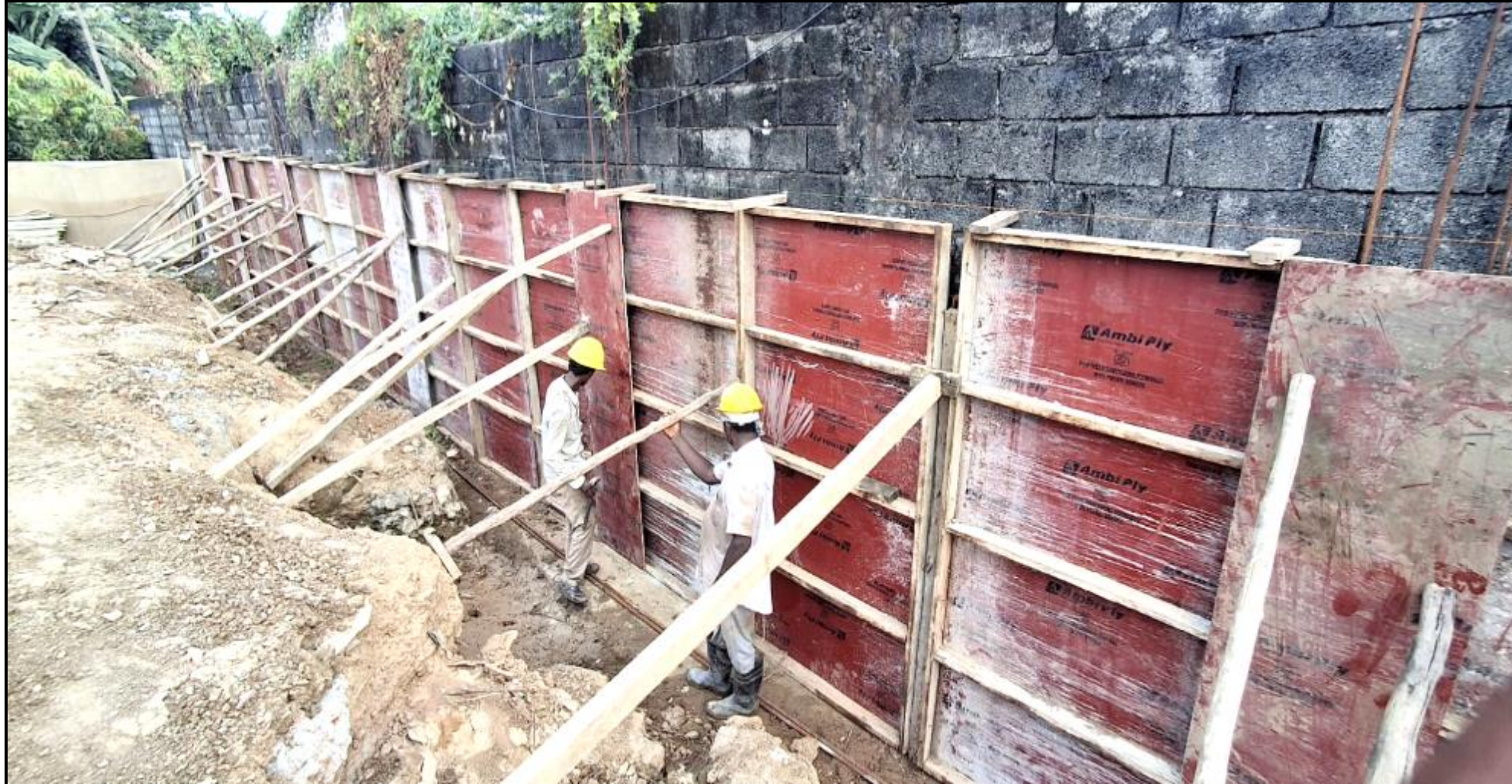
Compound wall – Plinth beam & RC wall shuttering 29m completed (70/113m)