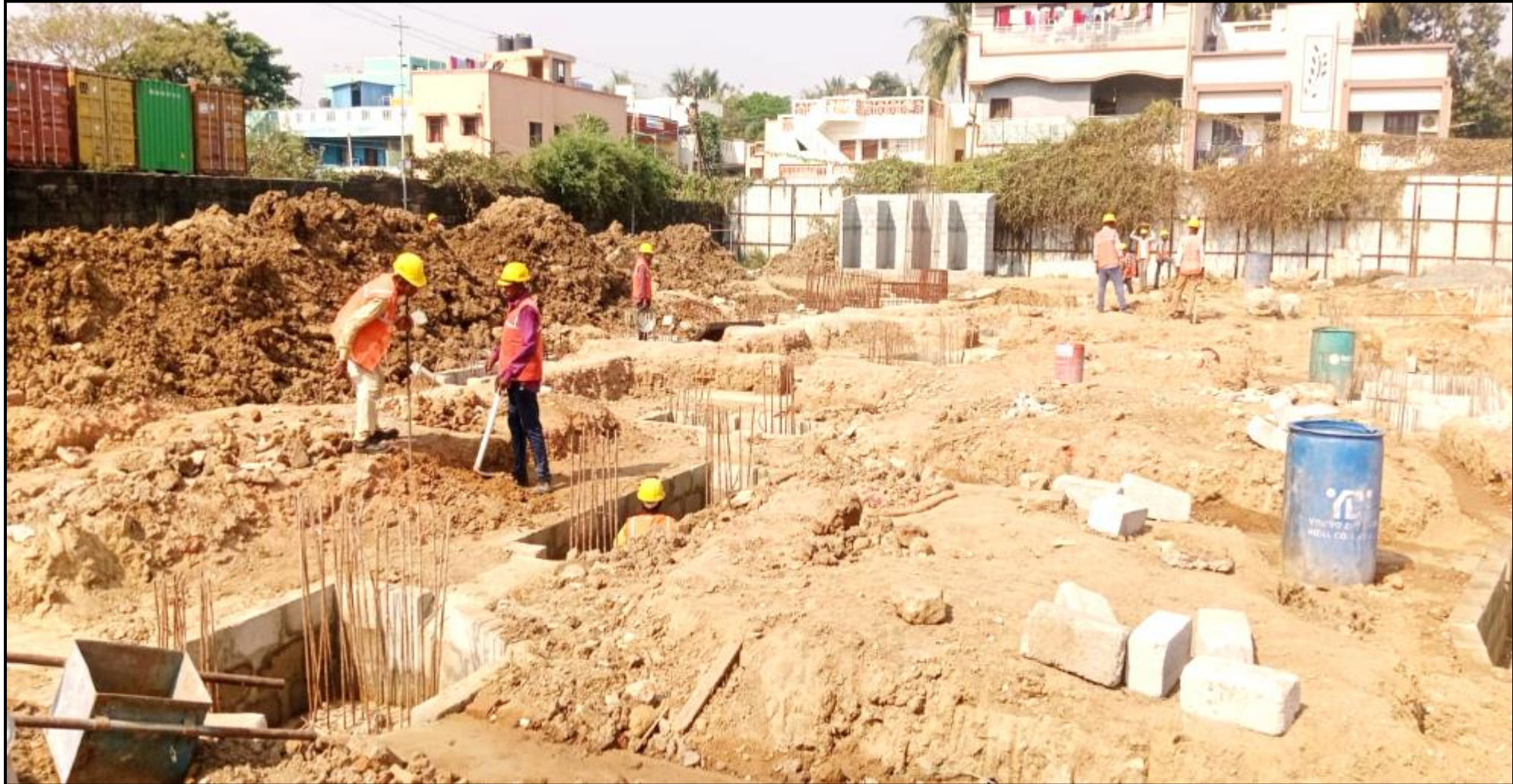
Main building – Pile cap back filling work in progress