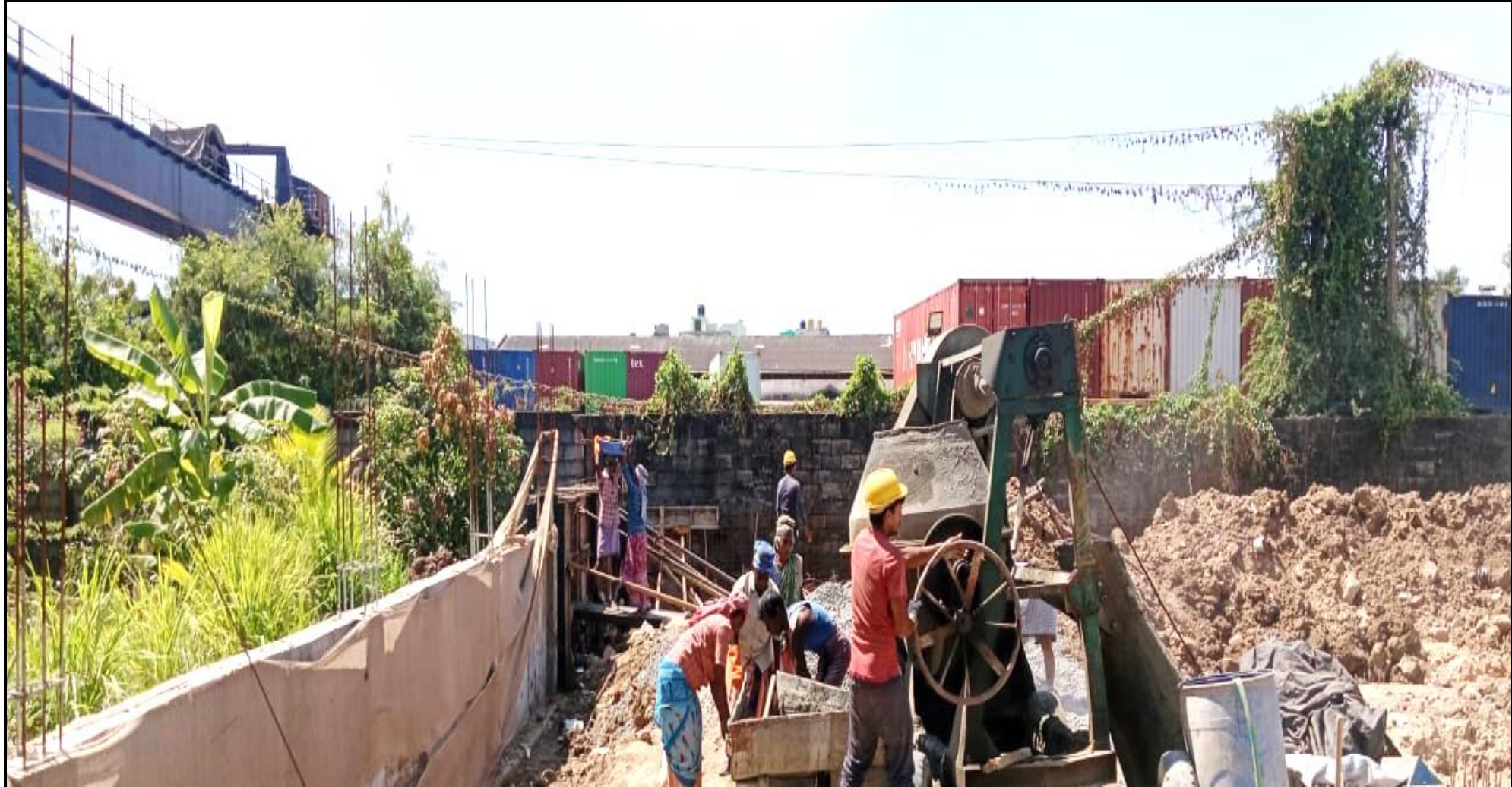
Compound wall – Plinth beam & RC wall concrete work 24m completed (48/113m)