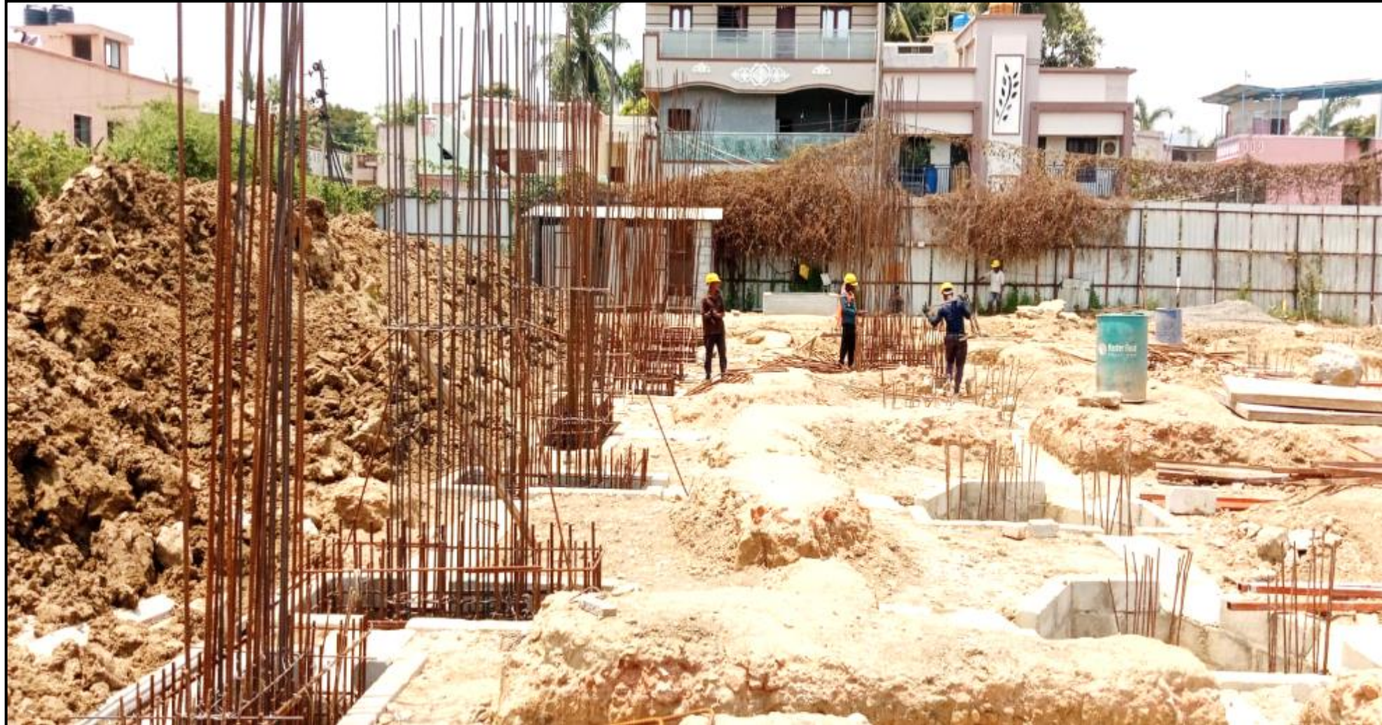
Main building –Pile cap reinforcement work completed (3/47 no's)