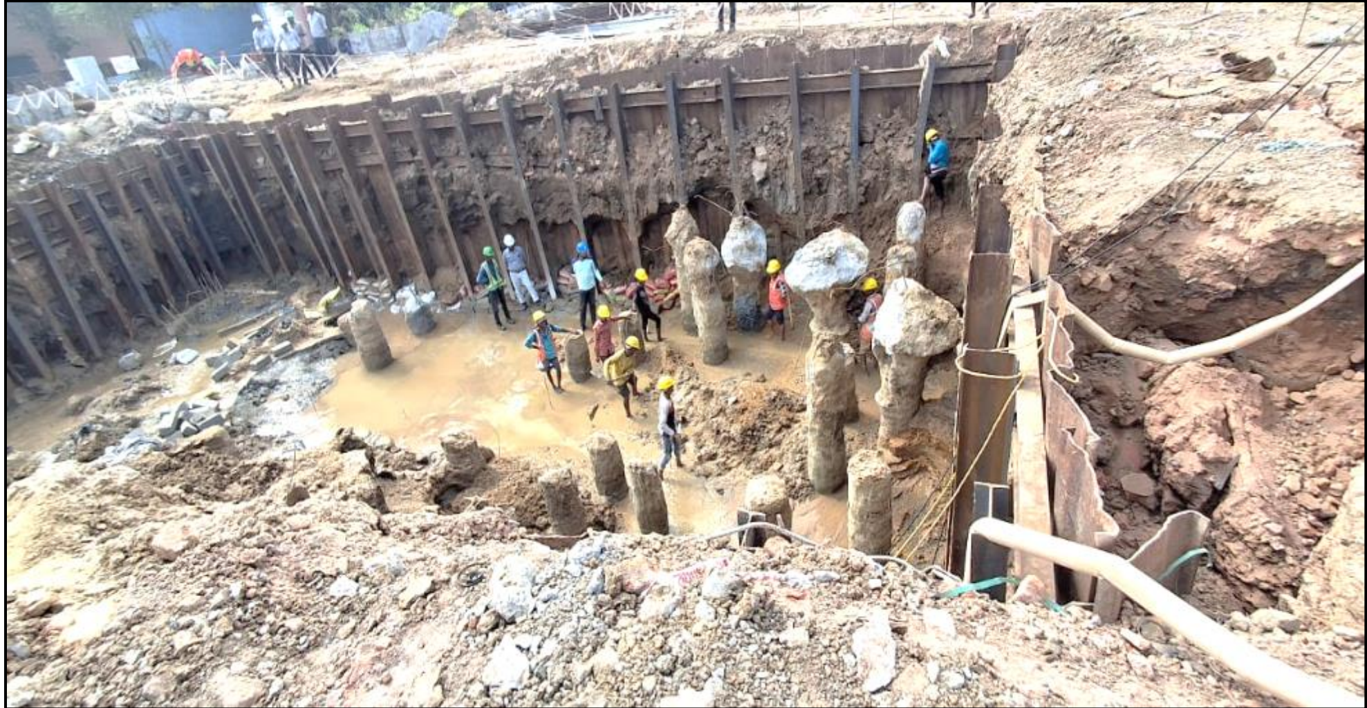
UG Sump –Raft PCC dressing work 171 sqm completed