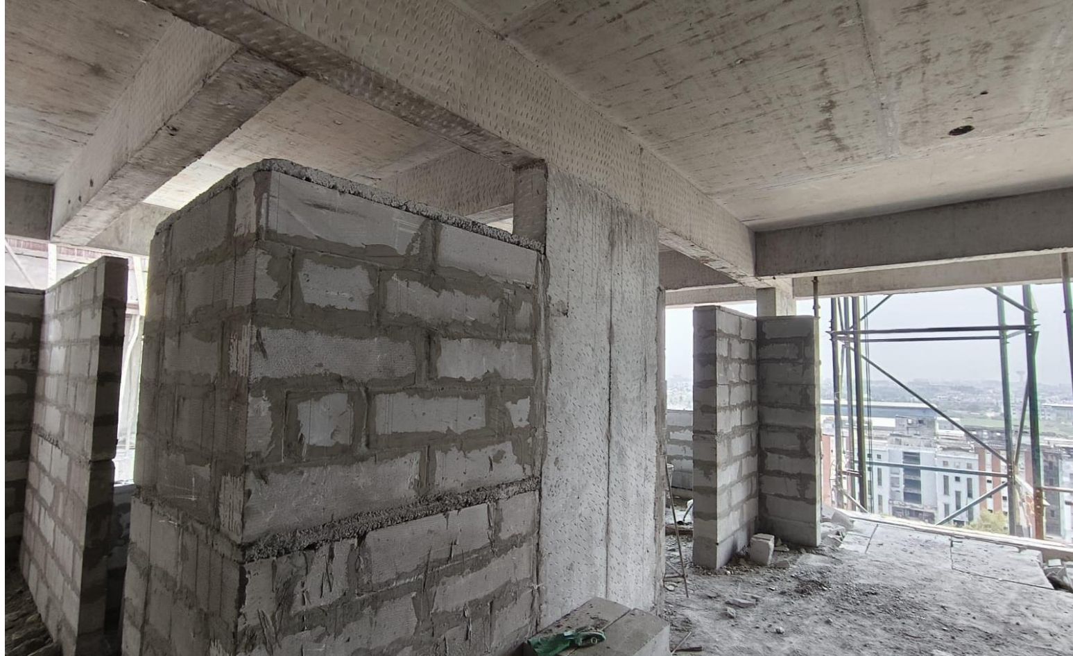
BLOCK 1 - THIRTEENTH FLOOR BLOCK WORK IN PROGRESS