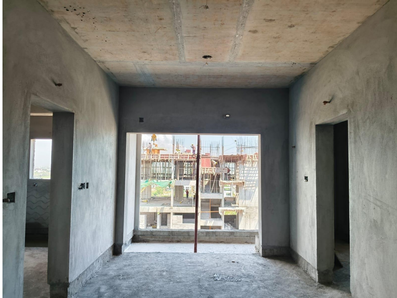
BLOCK 1 - ELEVENTH FLOOR INTERNAL PLASTERING WORK COMPLETED