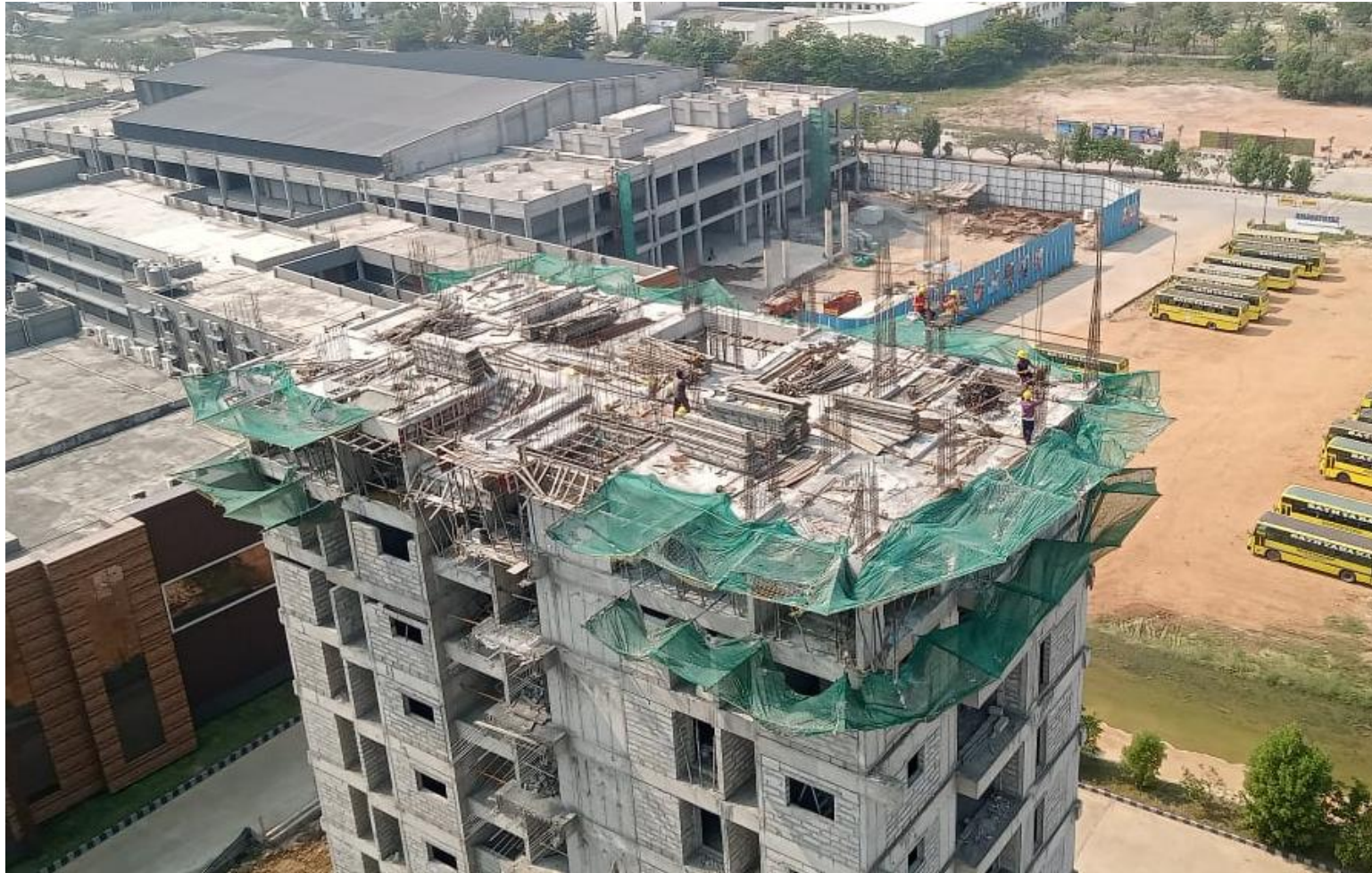
BLOCK 2 POUR 1 - TOP VIEW