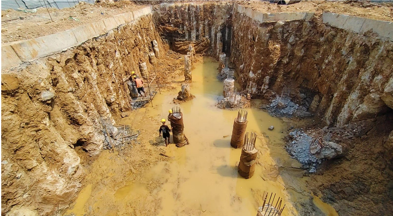
STP - PILE GROWING WORK IN PROGRESS