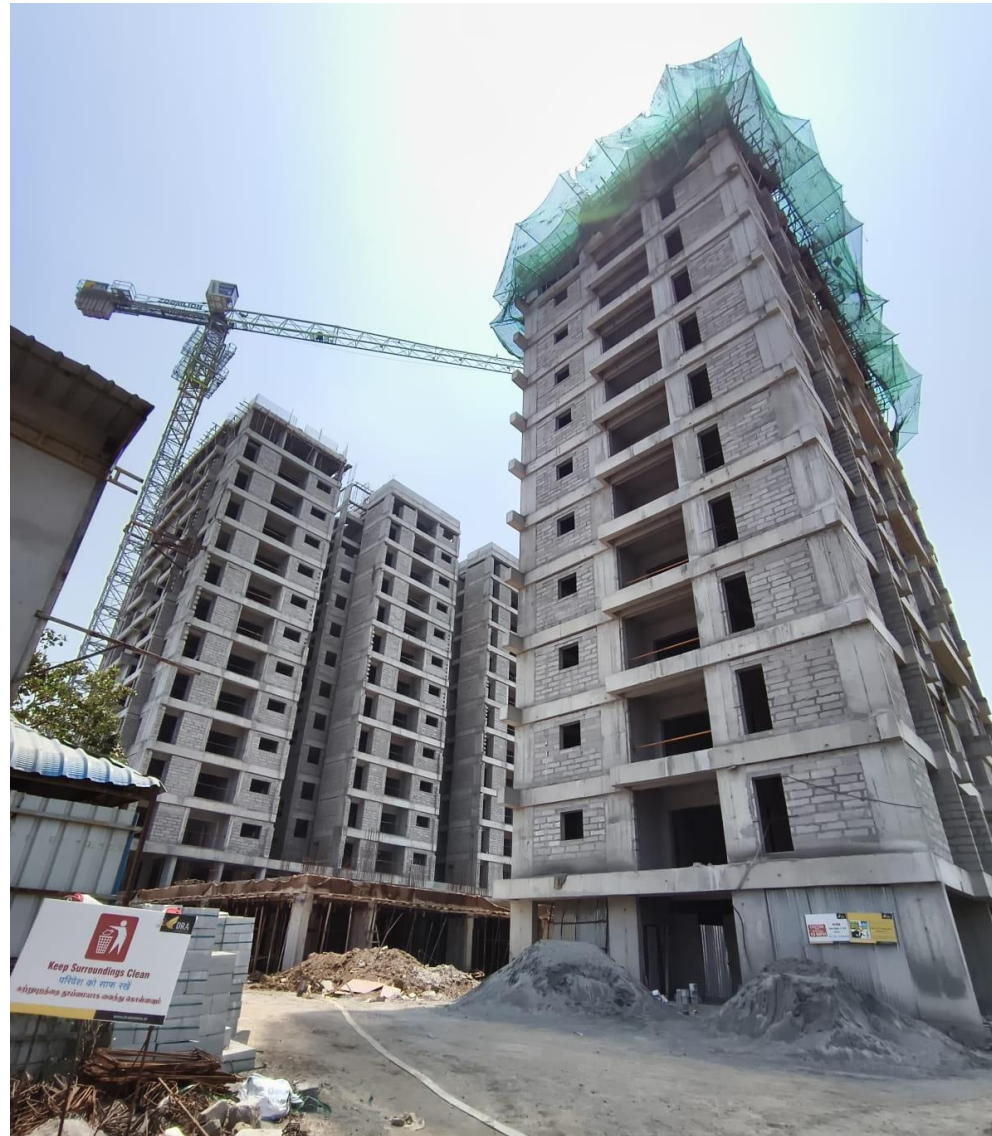
VIEW FROM ENTRANCE