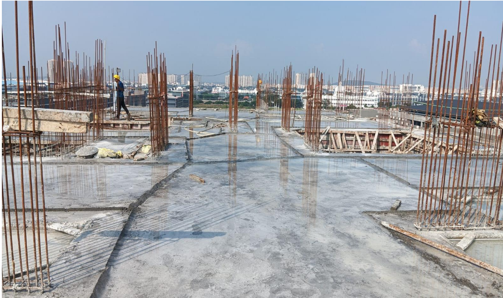
BLOCK 2 POUR 1 - ELEVENTH FLOOR ROOF SLAB CONCRETE COMPLETED