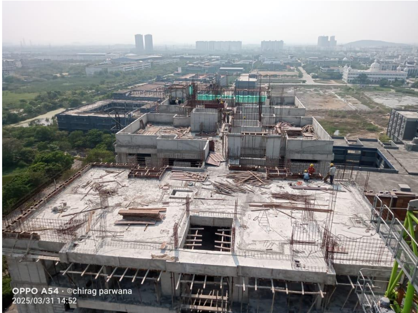
BLOCK 1 - TOP VIEW