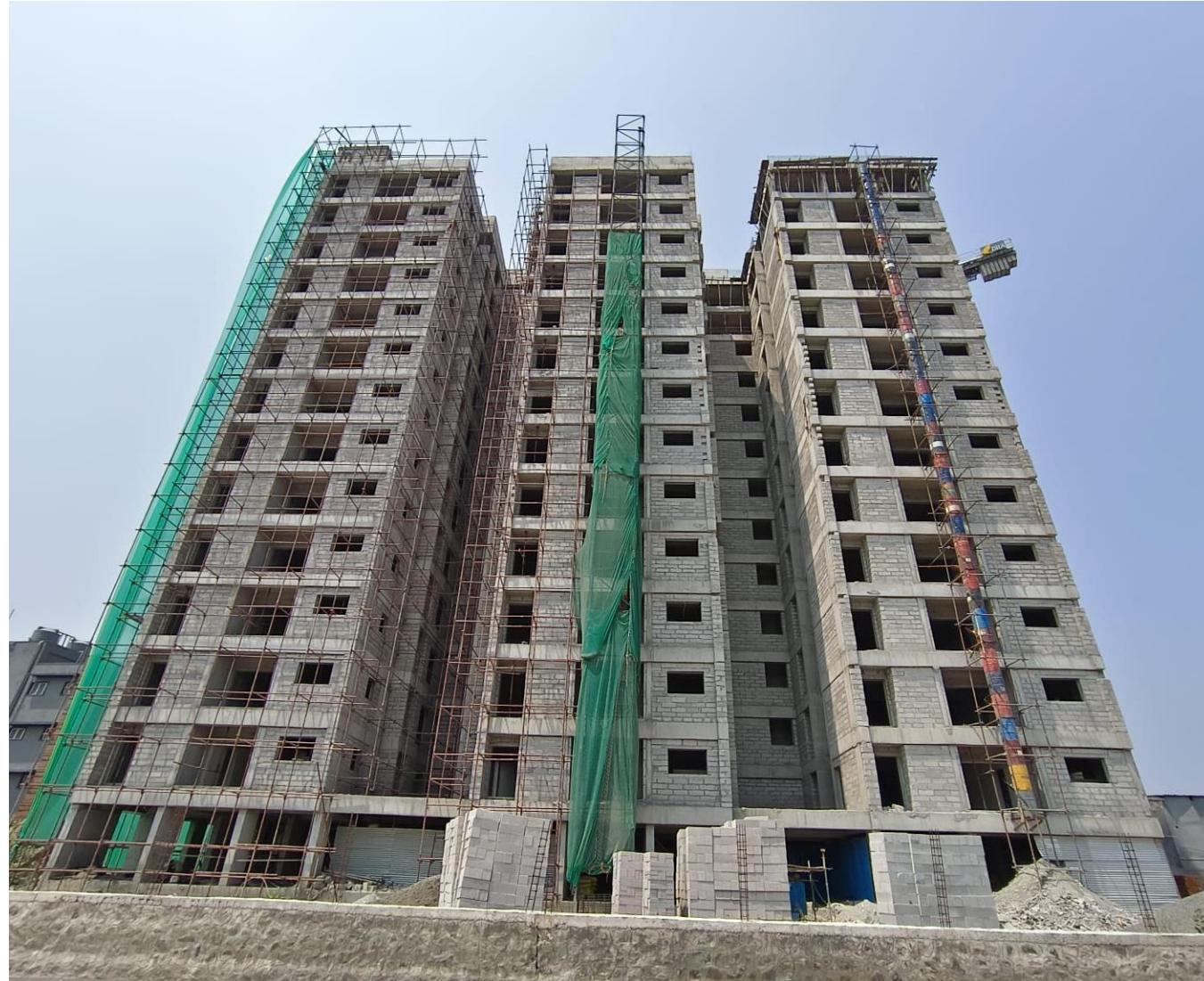
SOUTH SIDE ELEVATION