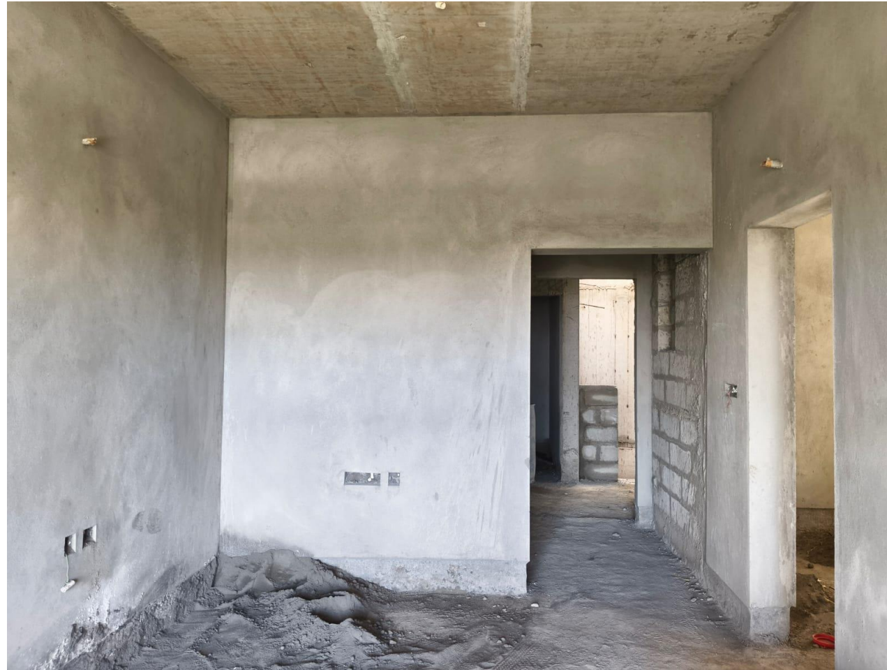
BLOCK 1 - TENTH FLOOR INTERNAL PLASTERING WORK COMPLETED