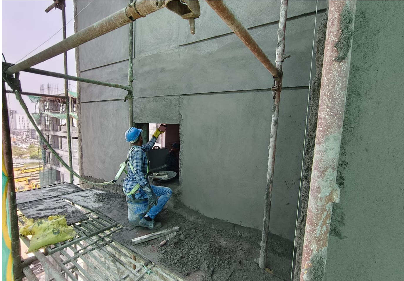
BLOCK 1 - EXTRENAL PLASTERING(WEST SIDE) WORK IN PROGRESS