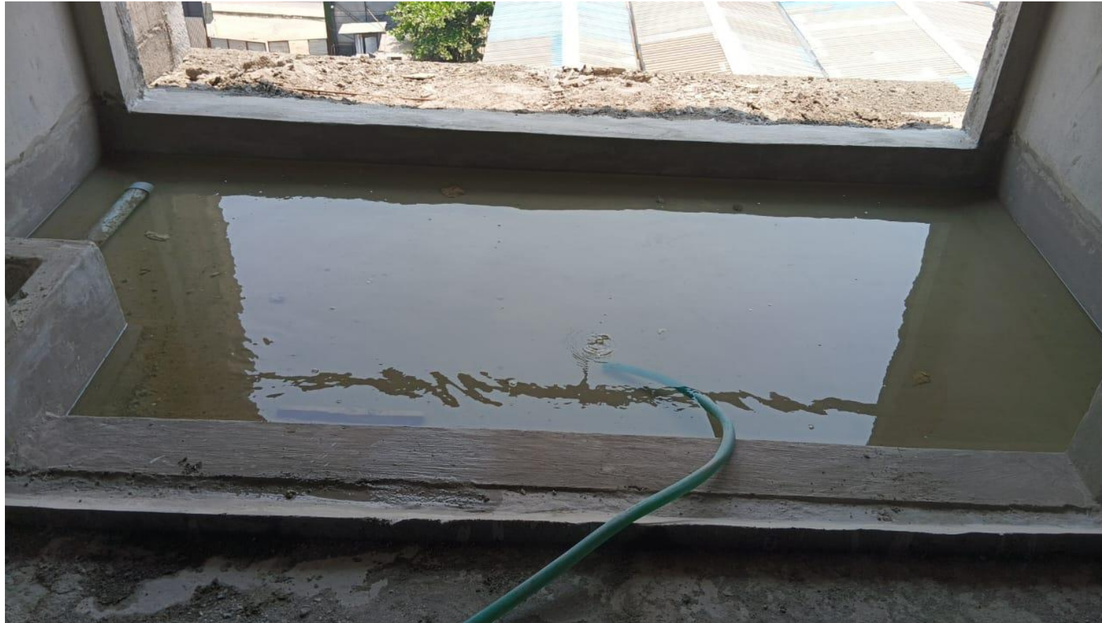
BLOCK 2 POUR 1 - FIFTH FLOOR WATERPROOFING WORK IN PROGRESS