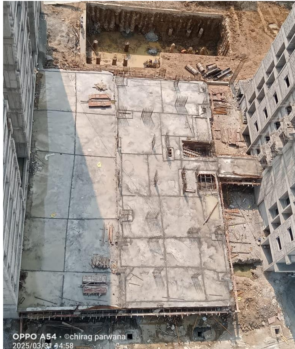
BLOCK 2 POUR 2 - TOP VIEW