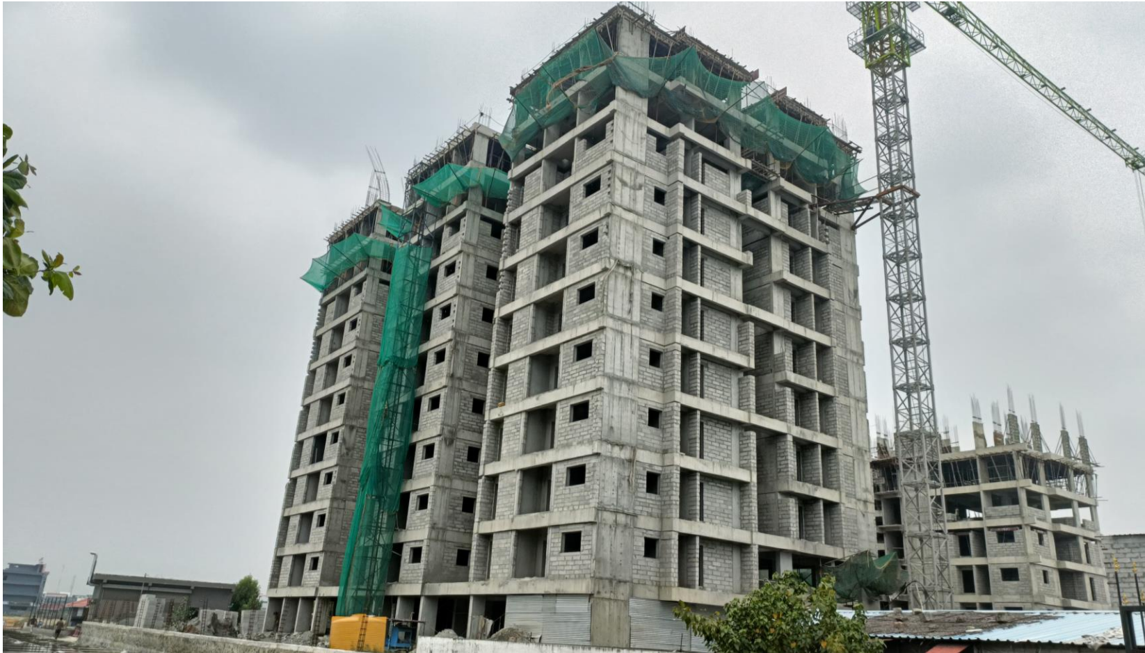
BLOCK 1 – SOUTH SIDE ELEVATION.