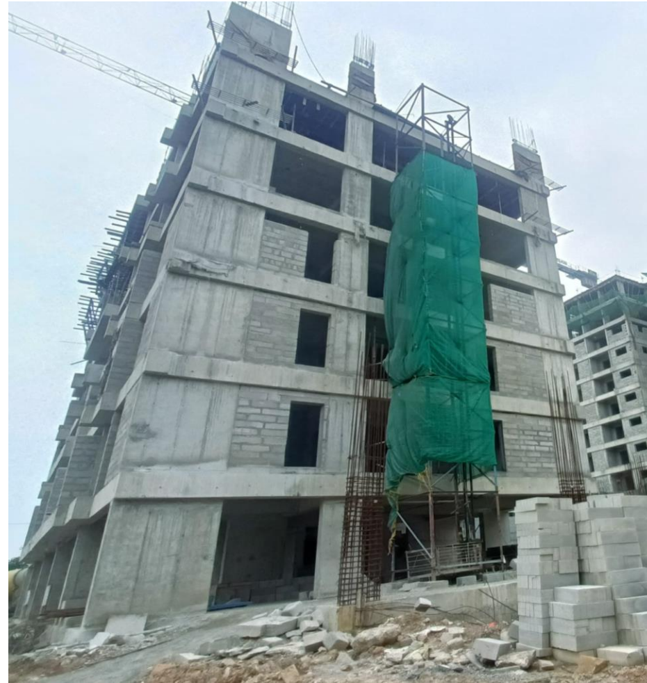
BLOCK 2 POUR 1– WEST SIDE ELEVATION.