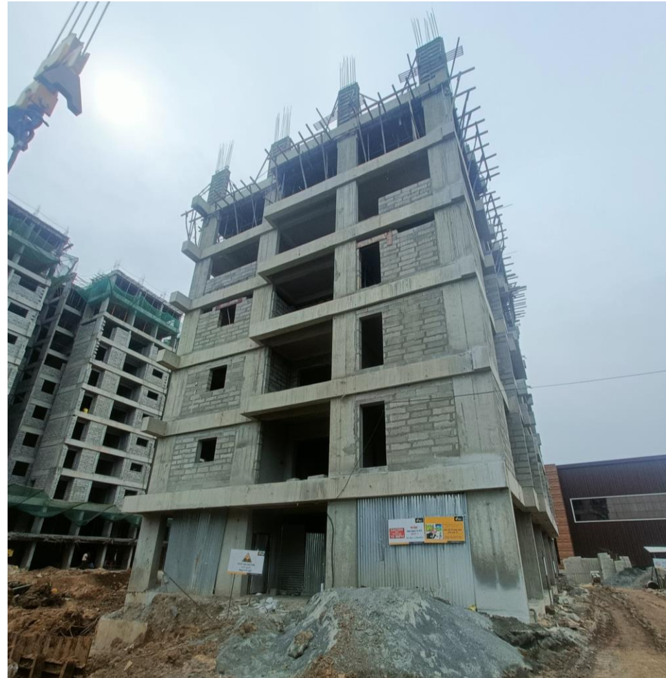
BLOCK 2 POUR 1 – EAST SIDE ELEVATION.