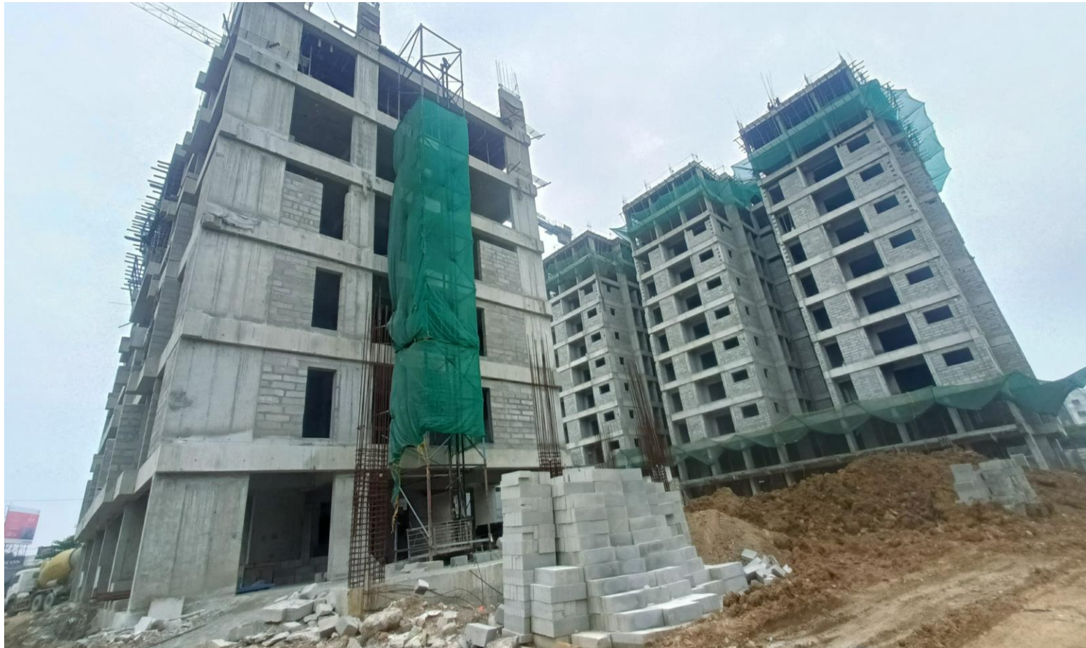
BLOCK 1 – NORTH SIDE ELEVATION.